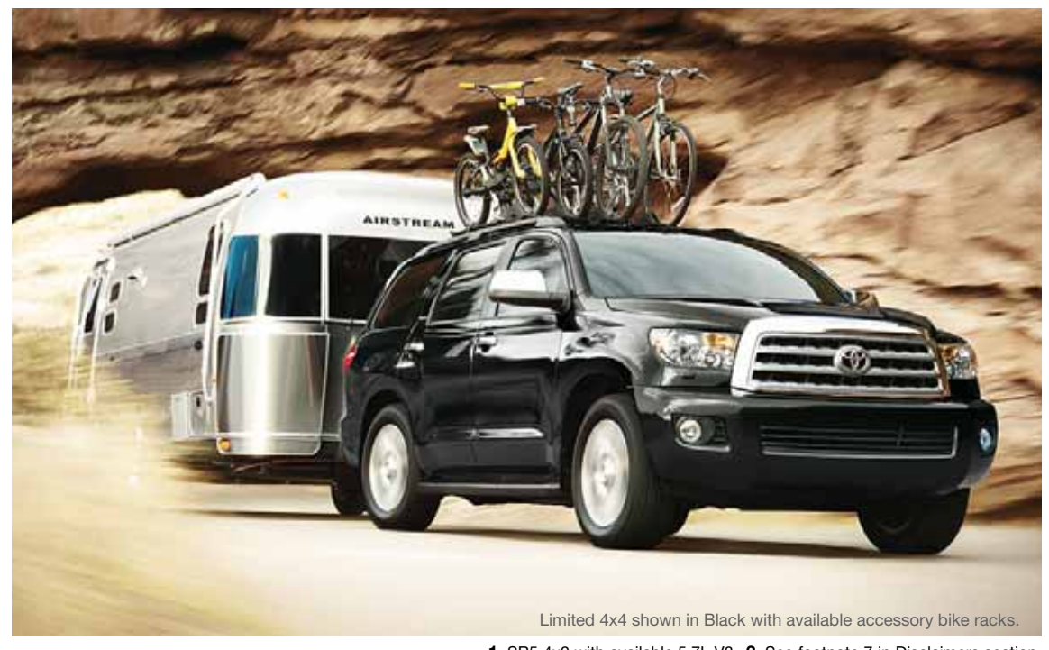
1. SR5 4x2 with available 5.7L V8. 2. See footnote 7 in Disclaimers section.

There's more to towing and hauling than just a powerful engine. Maintaining ride height is especially important when the vehicle is carrying a lot of passengers or cargo weight. That's why Sequoia Platinum features Electronically Modulated Air Suspension. It allows the driver to adjust ride height to compensate for changes in load. So Sequoia's ride is always the same: smooth.