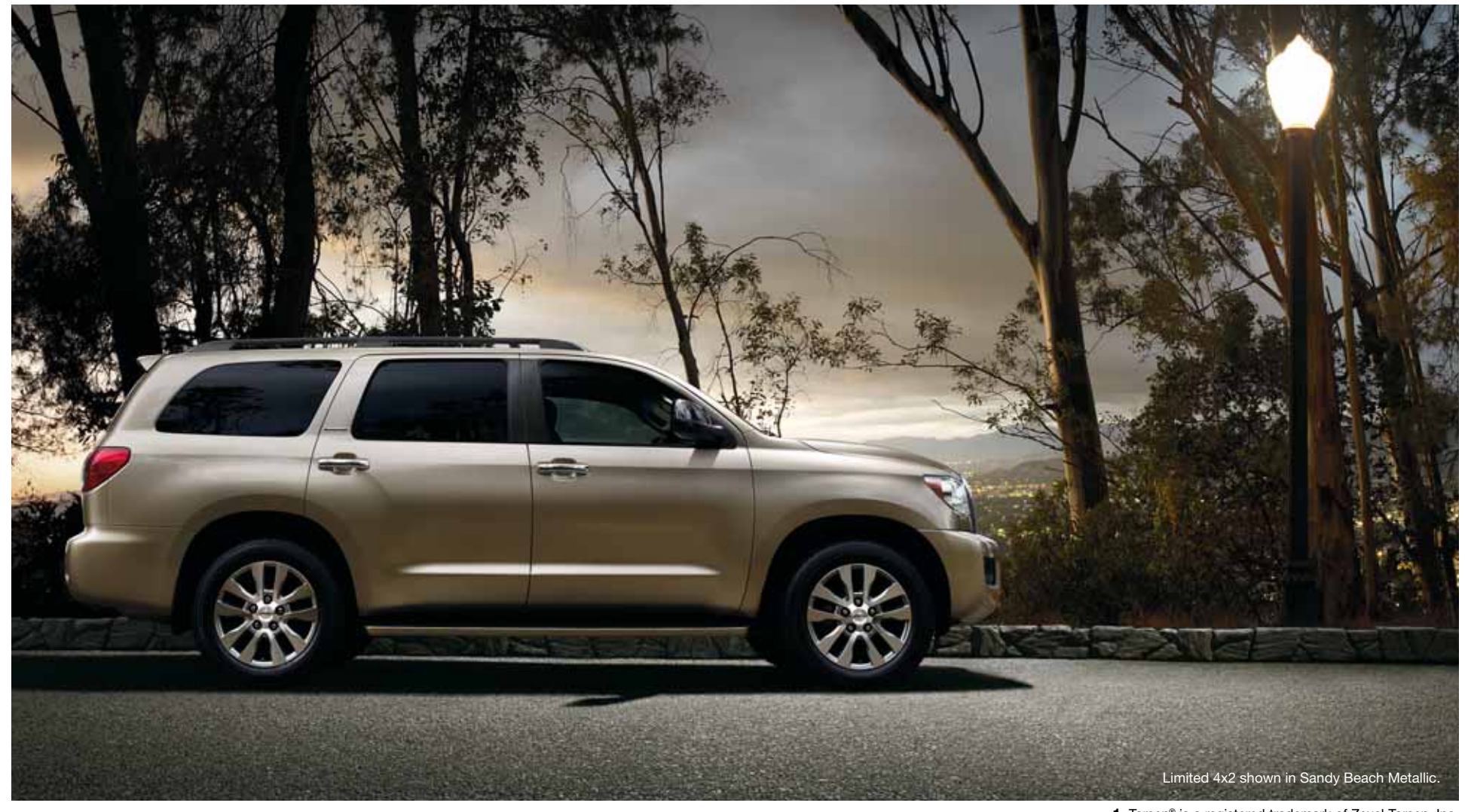
1. Torsen® is a registered trademark of Zexel Torsen, Inc.

No. Features like an available Adaptive Variable Suspension (AVS) system do give Sequoia perfect road manners. But with an available Multi-Mode 4WD system with Torsen<sup>®1</sup> limited-slip center differential, Sequoia is ready whenever the road turns to trail. In fact, that's when the real fun begins.