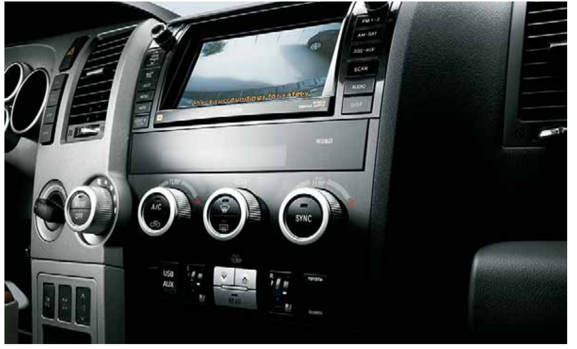
1. See footnote 18 in Disclaimers section. 2. See footnote 15 in Disclaimers section. 3. See footnote 16 in Disclaimers section. 4. See footnote 14 in Disclaimers section.

Sequoia's available touch-screen DVD navigation system includes a backup camera. Put Sequoia in Reverse, and it automatically shows what the camera sees immediately behind you. Which means if you're thinking of towing a boat, you'll be able to line up the tow hitch like a pro. What's more, this nav system has an auxiliary audio input compatible with most USB audio devices. And built-in Bluetooth <sup>®4</sup> technology for hands-free phone capability with music streaming.