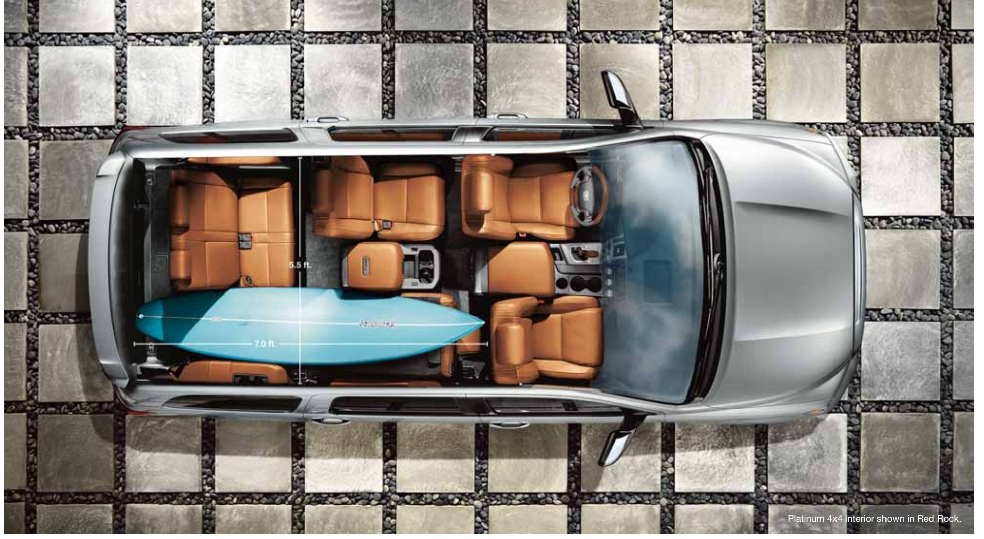
1. Standard on SR5 and Limited. Not available on Platinum. 2. Cargo and load capacity limited by weight and distribution.

ft More than you're likely to need. There's seating for eight¹ with the standard third row. Or you can fold the seats flat for 120.1 cubic feet of oaigo space. all the gear you and your crew will need to go just about anywhere. You could just say it's big — but big is too small a word to do it justice. you can fold the seats flat for 120.1 cubic feet of cargo space? That's enough room for