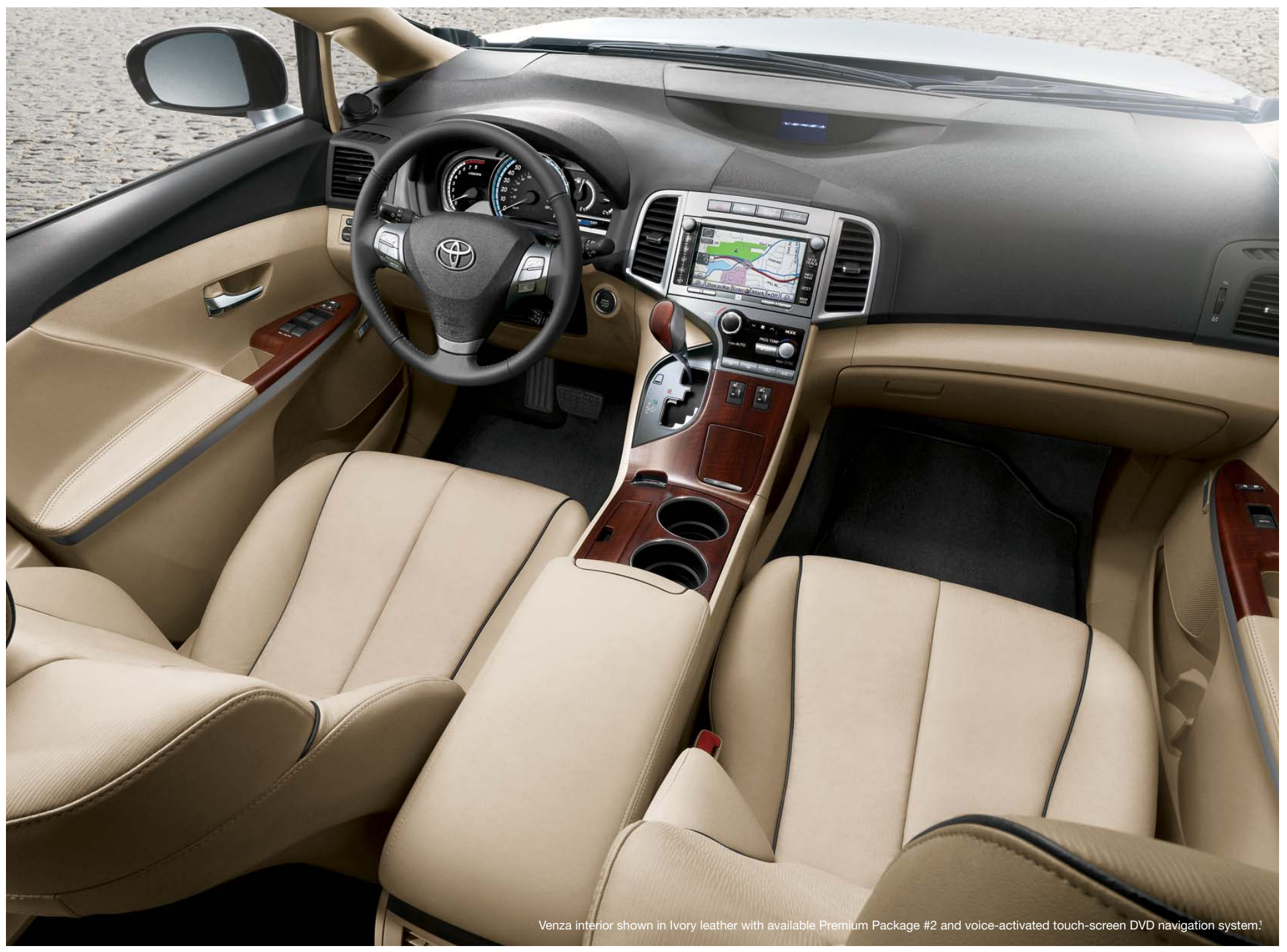
1. See footnote 7 Disclaimers section.