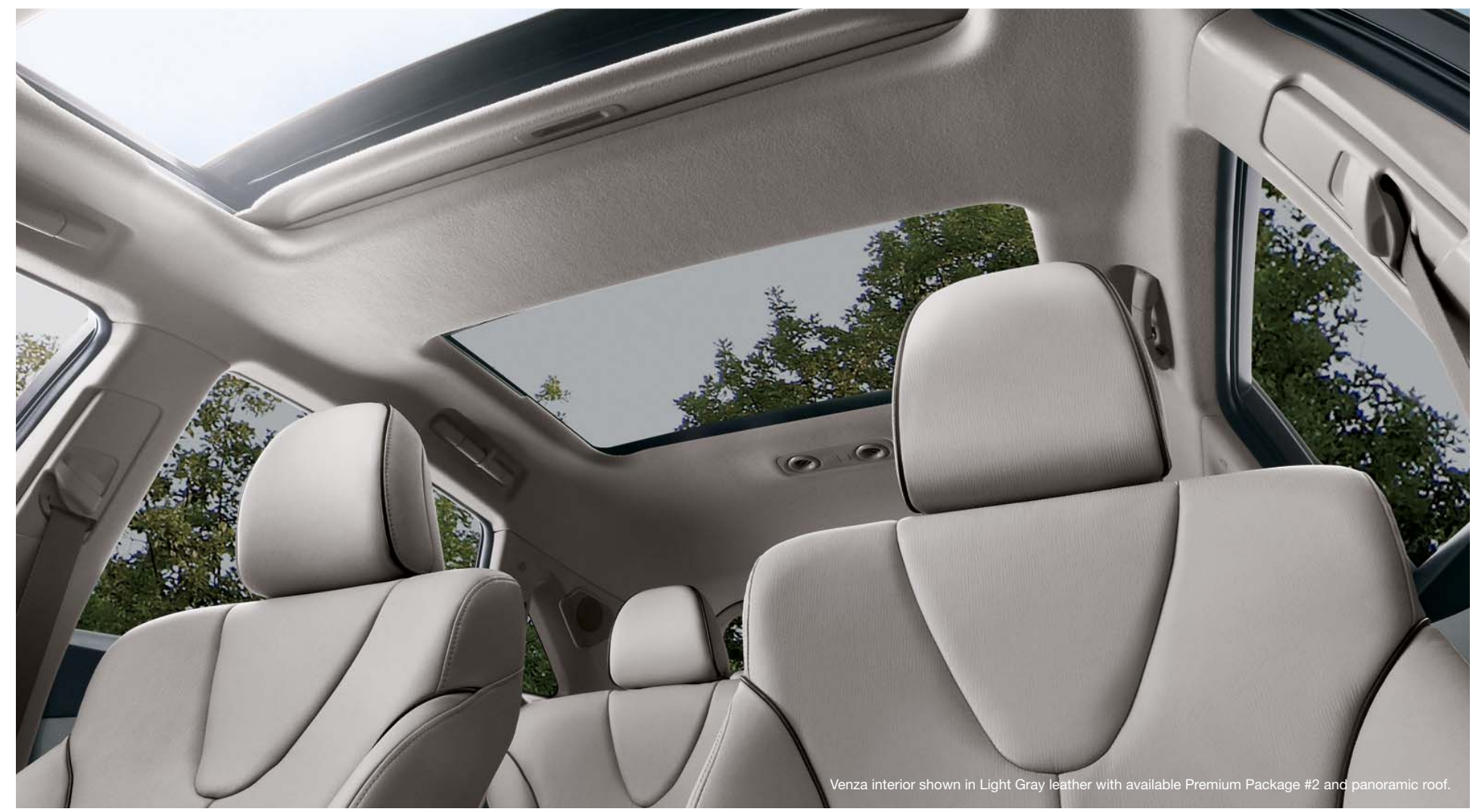
1. See footnote 9 in Disclaimers section. 2. See footnotes 7 and 8 in Disclaimers section.

An available backup camera displays the area behind the vehicle visible to the camera on the available Multi-Information Display. Or, on vehicles equipped with the available voice-activated touch screen DVD navigation system, it is displayed on the screen.