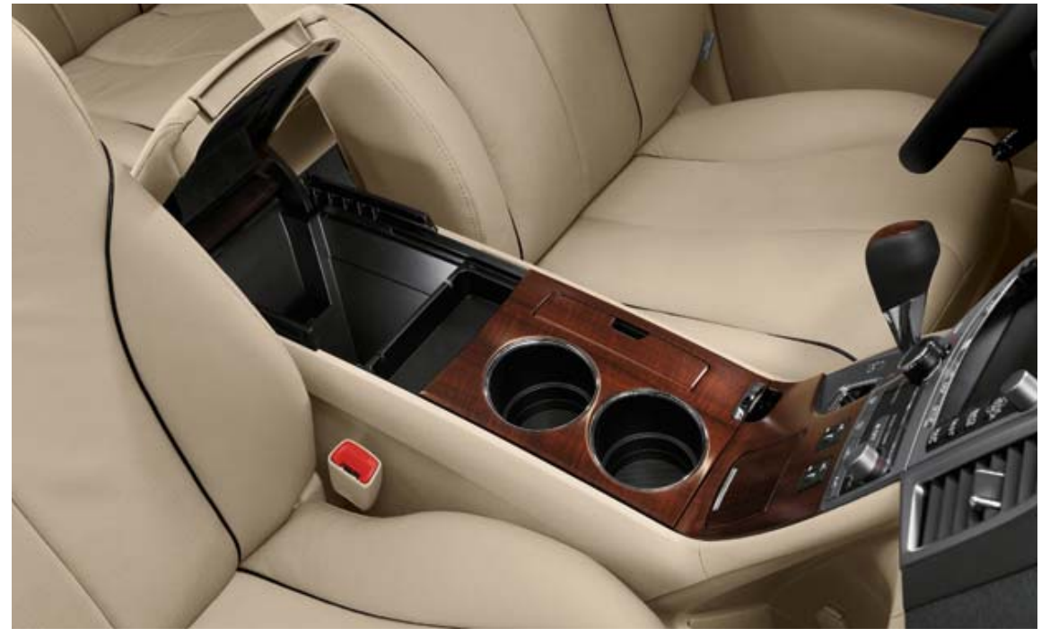
1. See footnote 15 in Disclaimers section.