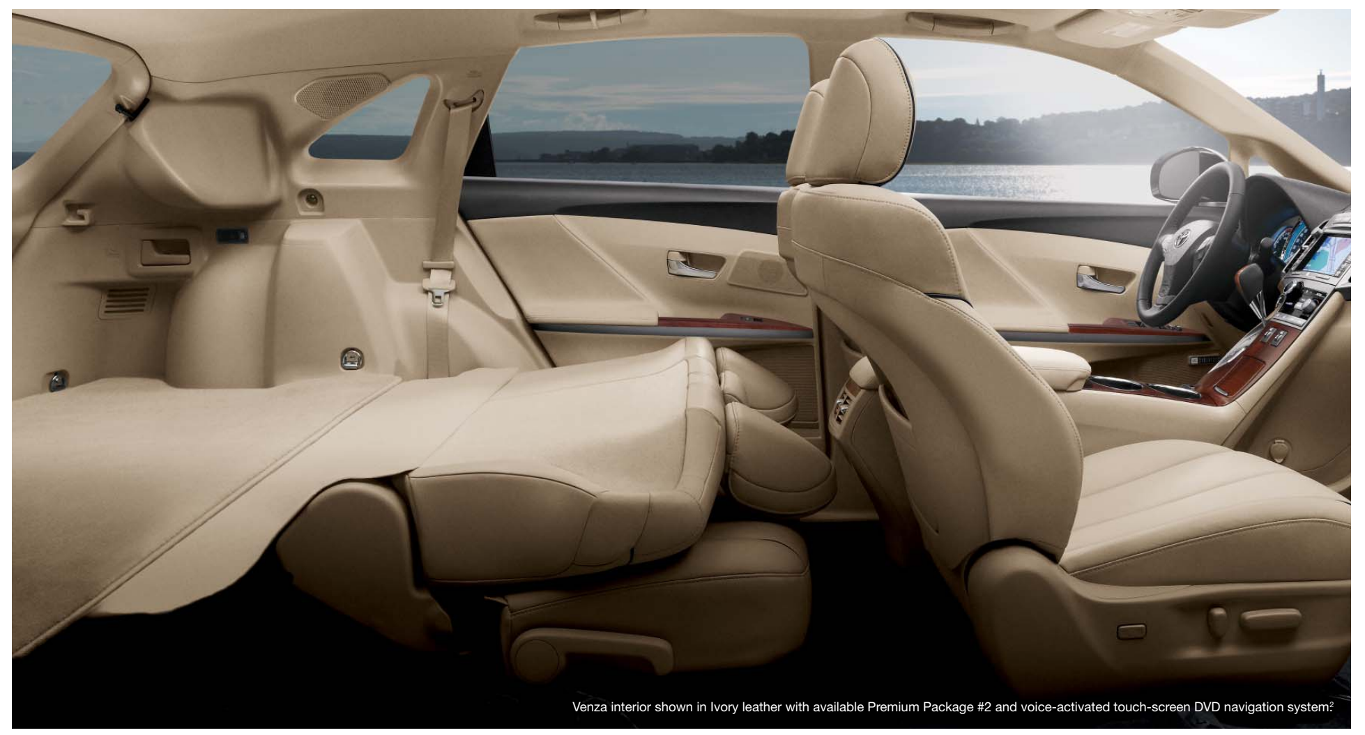
1. Cargo and load capacity limited by weight and distribution. 2. See footnote 7 in Disclaimers section.

It's as flexible as your schedule demands. Running an errand that requires you to carry big, bulky items? No problem. With its rear seatbacks folded down, Venza has up to 70.1 cubic feet of cargo space! And its rear seat features a 60/40 split, so you can carry a rear-seat passenger and still have expansive space left to hold the things you need to haul. Even with the rear seats reclined and all the seats occupied, there's still plenty of room left in the cargo area for everyone's luggage.