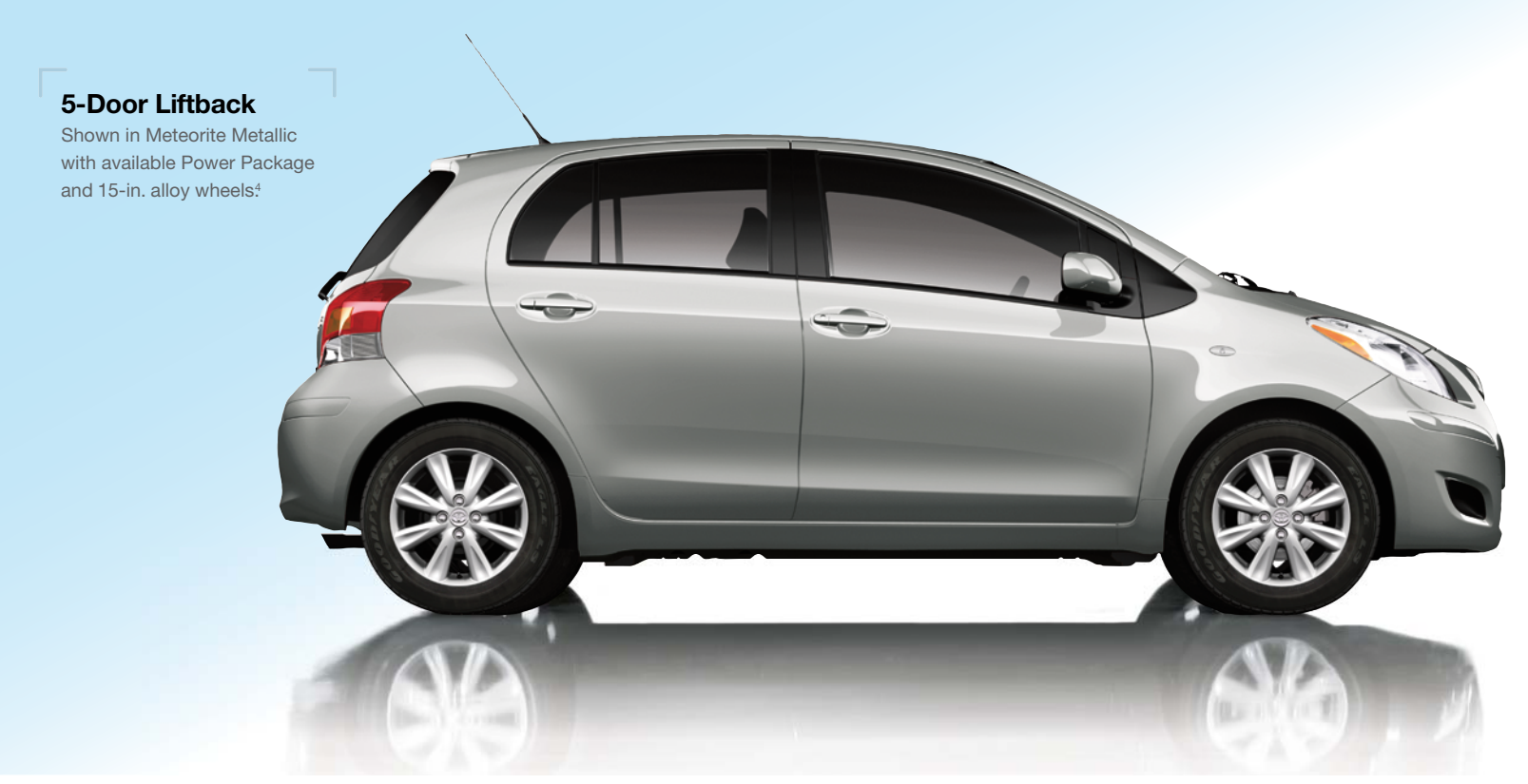
1. See footnote 15 in Disclaimers section. 2. See footnote 6 in Disclaimers section. 3. See footnote 16 in Disclaimers section. 4. Requires Power or Sport Package.

Every 2011 Yaris comes standard with the Star Safety System.™ A set of six accident avoidance technologies designed to help keep drivers out of harm's way, the Star Safety System™ includes Vehicle Stability Control (VSC),¹ Traction Control (TRAC), Anti-lock Brake System (ABS), Electronic Brake-force Distribution (EBD), Brake Assist (BA)² and Smart Stop Technology (SST).³ To view videos of Star Safety System™ features, visit toyota.com/safety