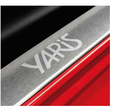
1. See footnote 19 in Disclaimers section.

An available aluminum trim piece accessory, silk-screened with the Yaris name, protects the car's doorsills from everyday scuffs and scrapes.