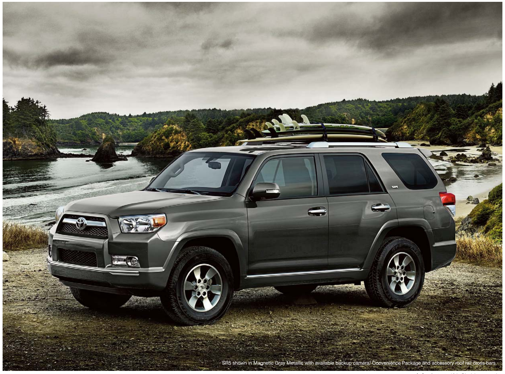
1. See footnote 13 in Disclaimers section.