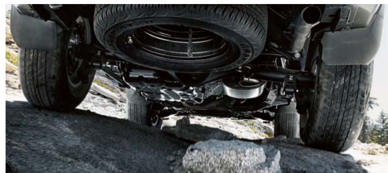
1. See footnote 2 in Disclaimers section. 2. See footnote 27 in Disclaimers section.