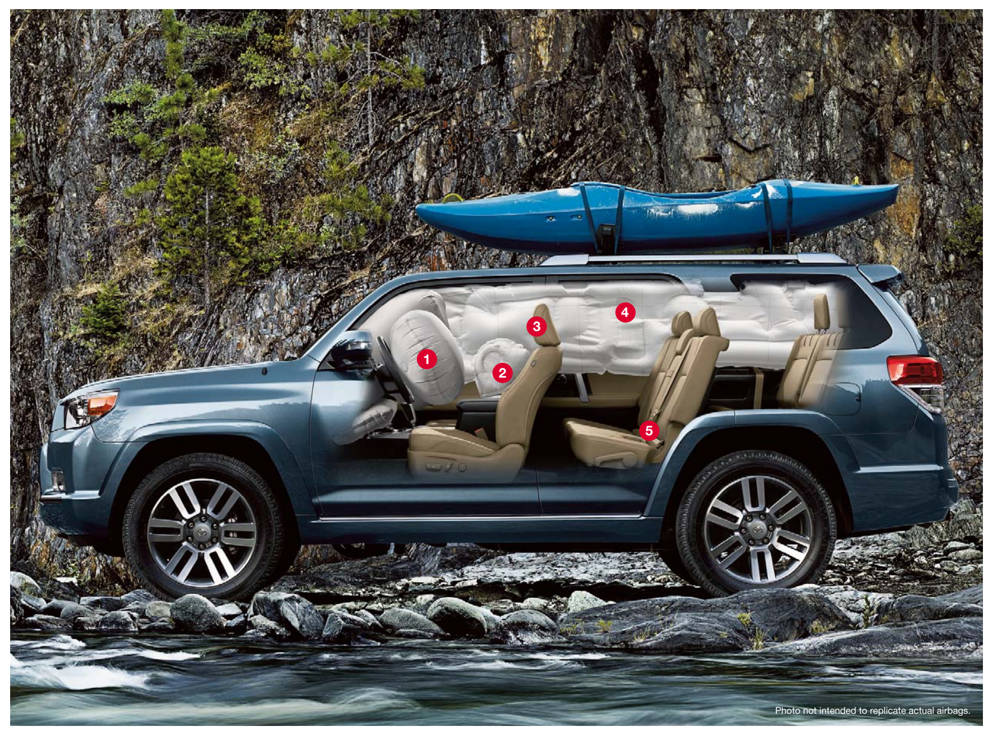
Numbers 1-5 descriptions on previous page.