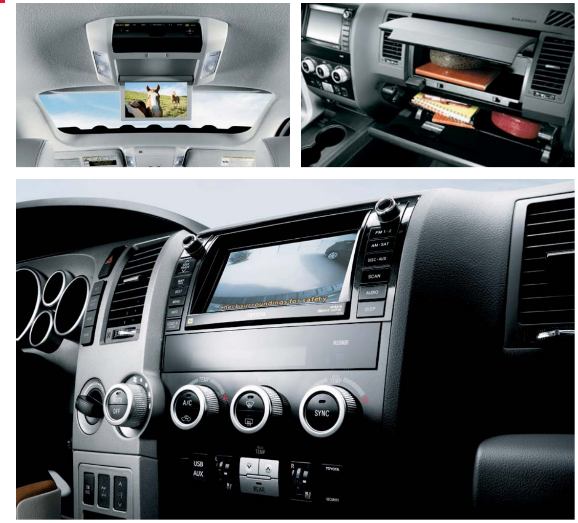
1. See footnote 15 in Disclaimers section. 2. See footnote 16 in Disclaimers section. 3. See footnote 12 in Disclaimers section. 4. See footnote 14 in Disclaimers section.

Sequoia's available touch-screen DVD navigation system includes a handy backup camera. Put Sequoia in Reverse and it automatically shows what the camera sees immediately behind you. So if you're towing a boat, you'll be able to line up the towing receiver hitch like a pro. The navigation system also has a USB<sup>3</sup> port compatible with most MP3/WMA audio devices and built-in Bluetooth <sup>®4</sup> wireless technology for hands-free phone capability and music streaming. For more information about our available audio systems, as well as Bluetooth <sup>®</sup>-compatible features, please contact your local Toyota dealer.