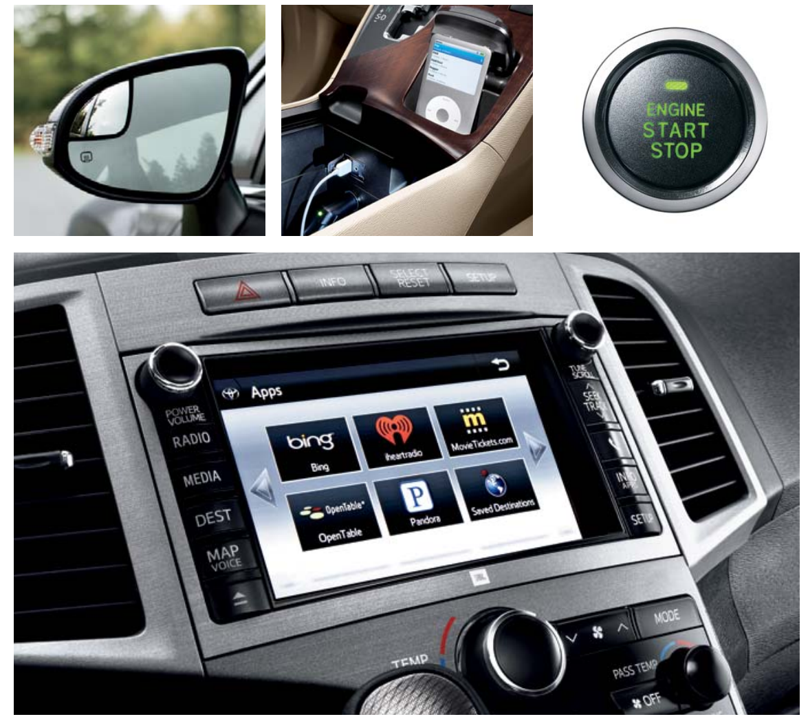
1. See footnote 12 in Disclosures section. 2. See footnote 9 in Disclosures section. 3. iPod<sup>®</sup> accessory is not included. iPod<sup>®</sup> is a registered trademark of Apple Inc. All rights reserved. 4. See footnote 7 in Disclosures section. 5. See footnote 16 in Disclosures section.

New for 2013, the upper outside corner on each of Venza's outside mirrors gives you a wide-angle view to help you detect vehicles that might be lurking in your blind spots.