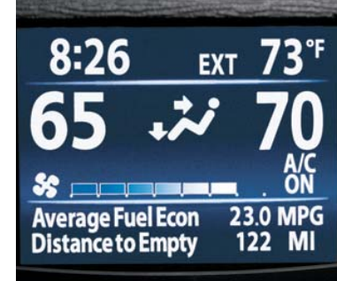
1. Standard on Limited. 2. See footnote 10 in Disclosures section.

MULTI-INFORMATION DISPLAY The Multi-Information Display provides data such as climate settings, outside temperature, fuel economy and trip information, and other important details.