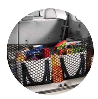
Cargo net — envelope41