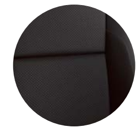
Limited and Hybrid Limited perforated