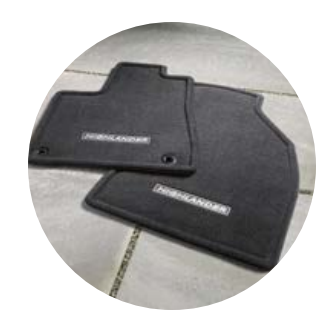
Carpet floor mats44