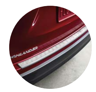
Rear bumper protector