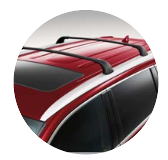
Roof rail cross bars (XLE, Limited)