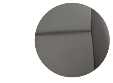
XLE leather shown in Ash