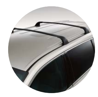
Roof rail cross bars (LE, LE Plus)