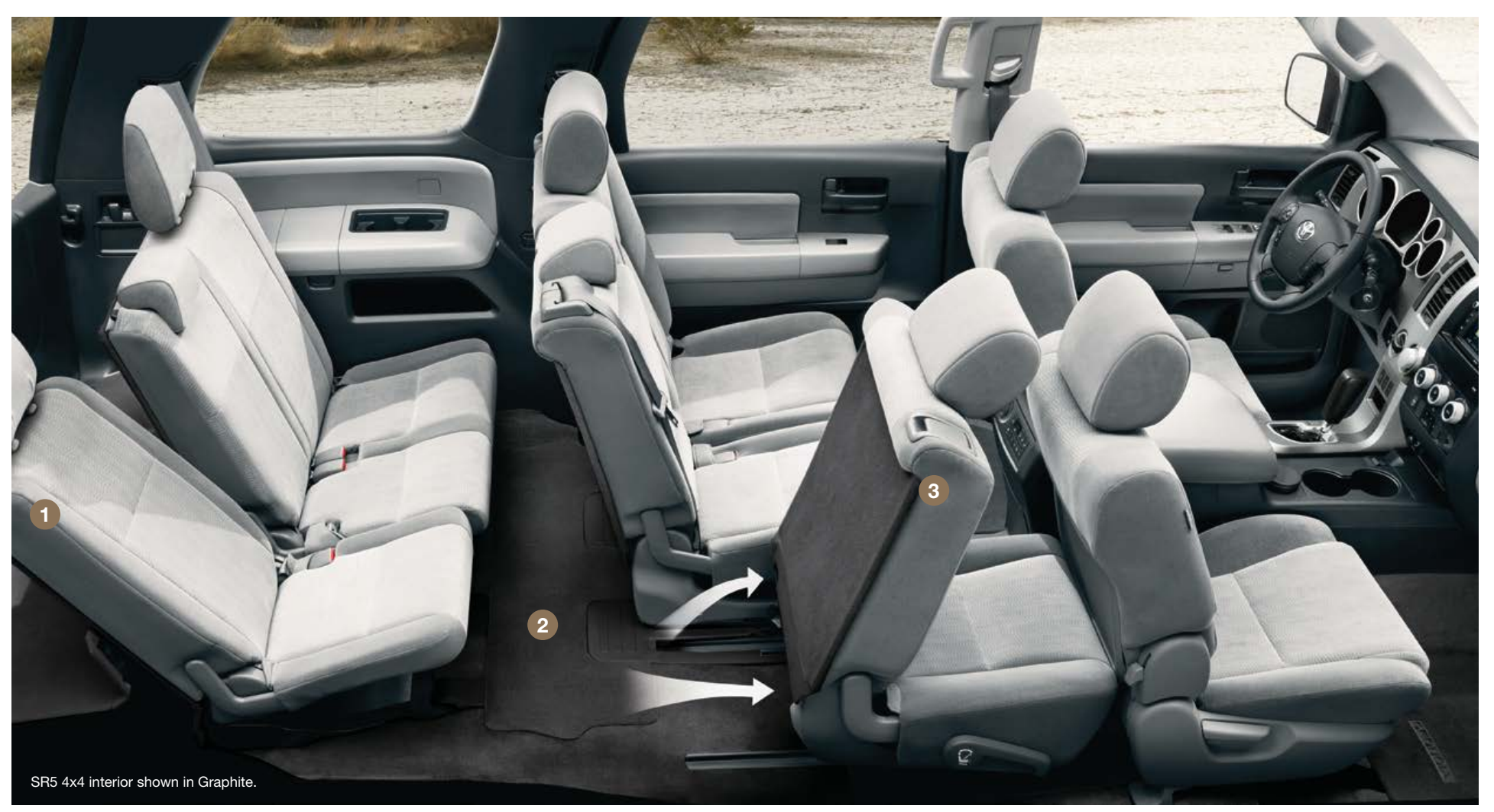
1. Standard on SR5 and Limited. Not available on Platinum.

With spacious seating for eight,<sup>1</sup> Sequoia has room for the whole family and then some. And what could be better? After all, adventures are best shared.