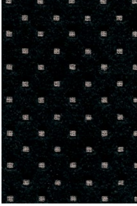
Black Leather Coupe