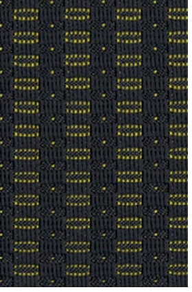
Black Cloth with Yellow Trim Heritage Edition