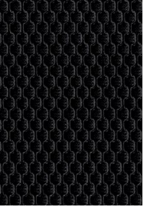
Black Leather Roadster