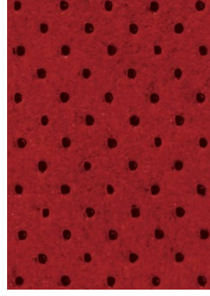
Black Leather/Red Alcantara® Inserts NISMO