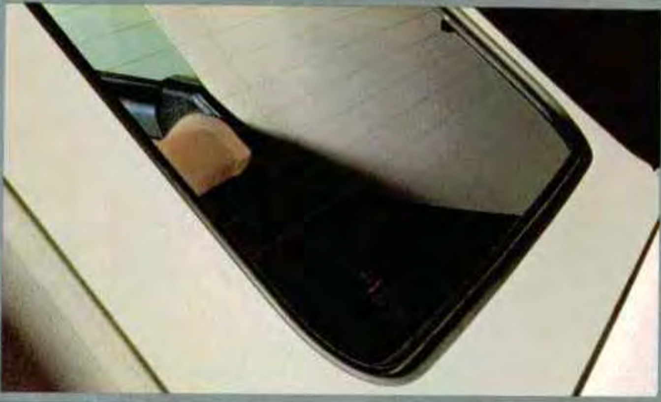
Swivel sunvisor with vanity mirror. Rear window with heating elements.