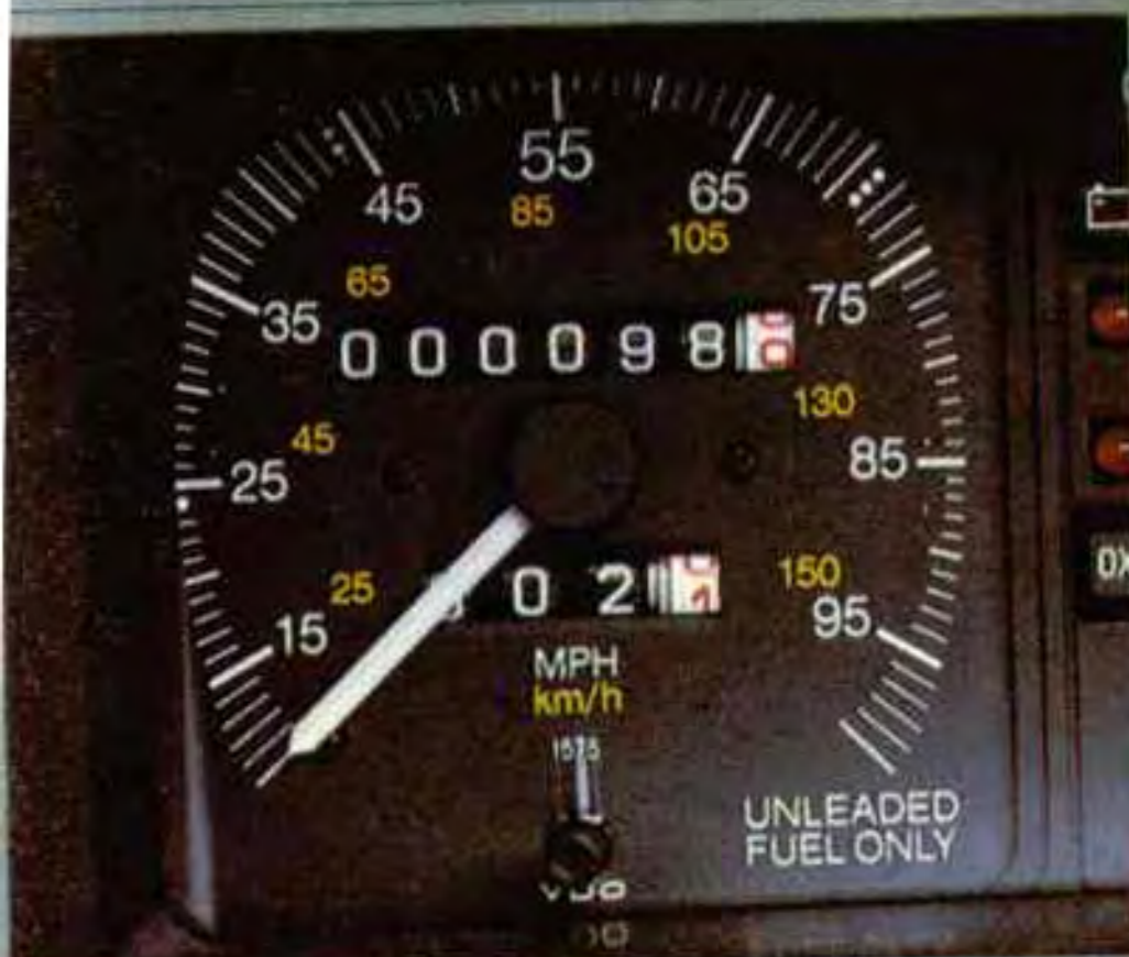
Rear backrest safety release (Convertible only). 100 mph speedometer face plate (except GTI).