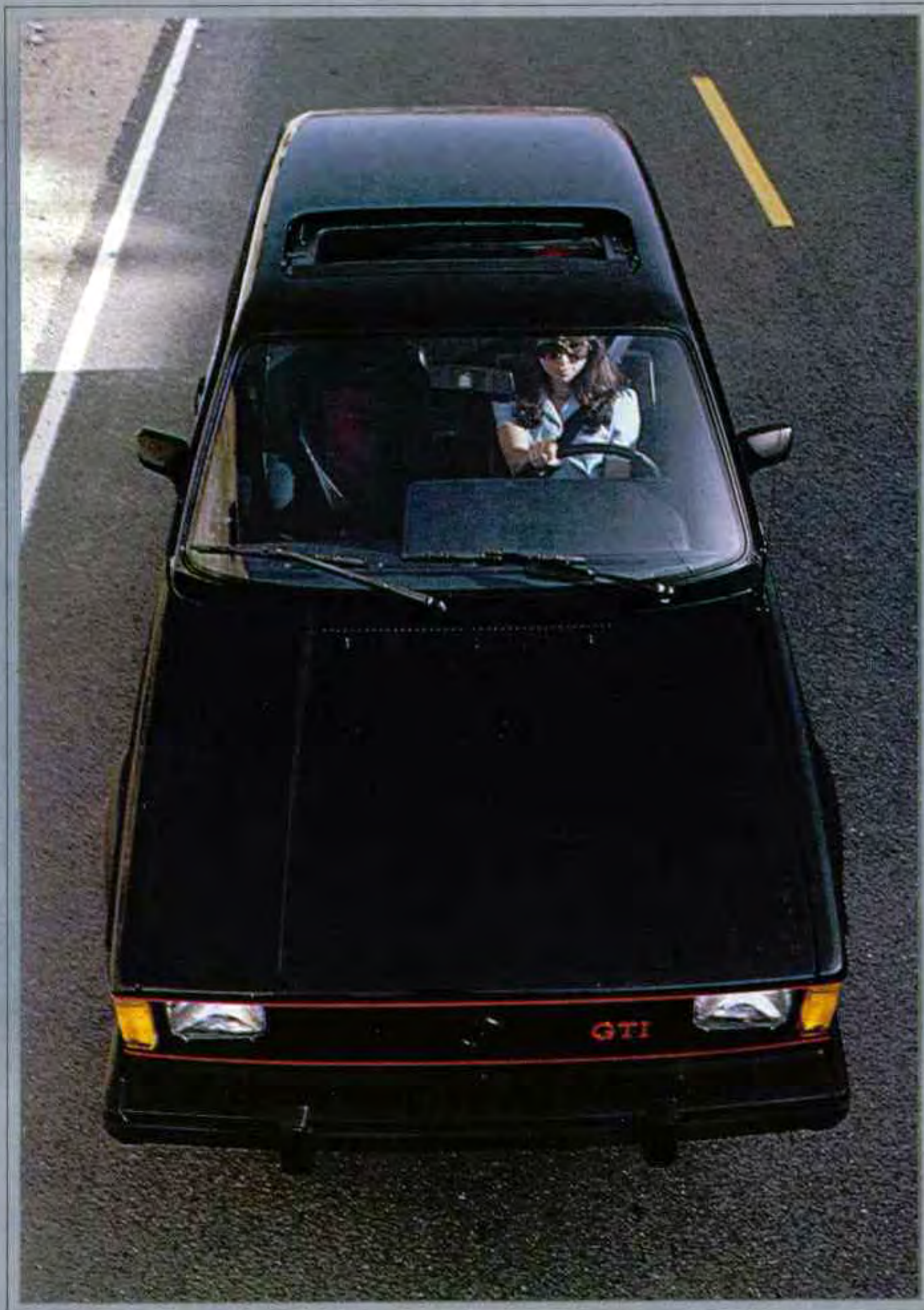
Black GTI with optional sunroof