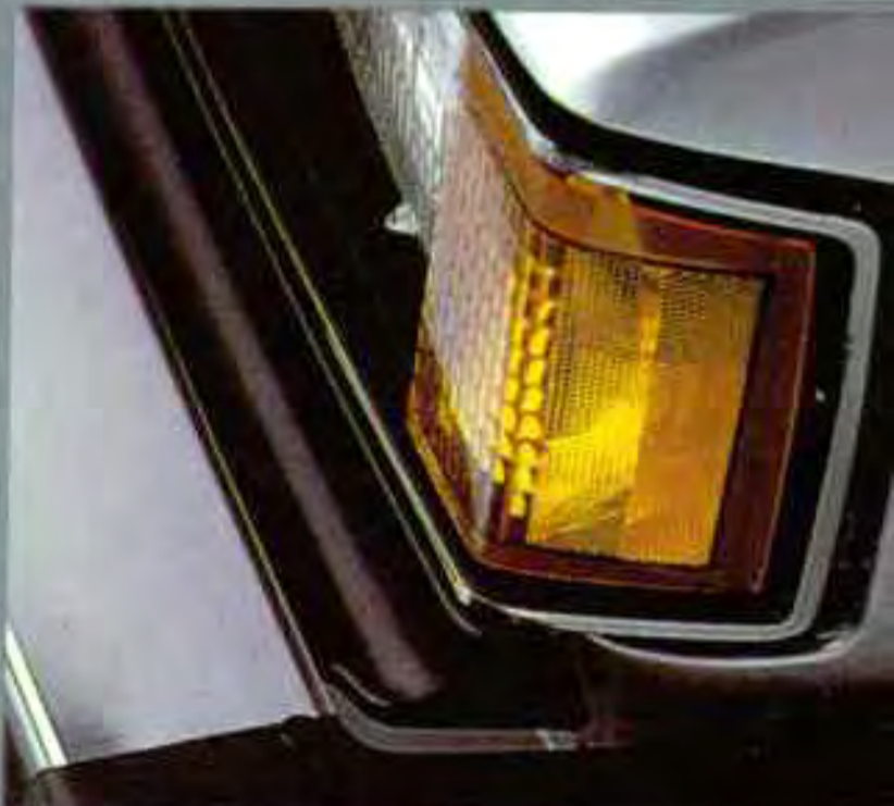
Lockable gas cap (Convertible only). Filler panel on front bumper (except Convert).