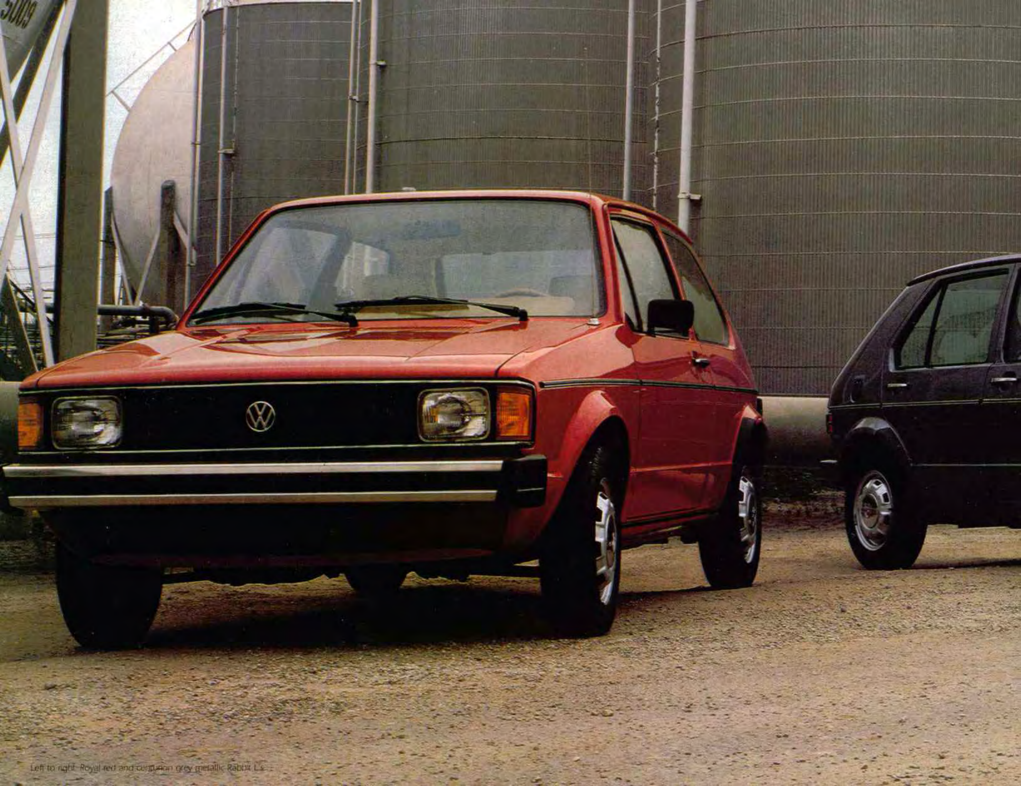
Left to right: Royal red and cerise grey metallic Rabbit L's