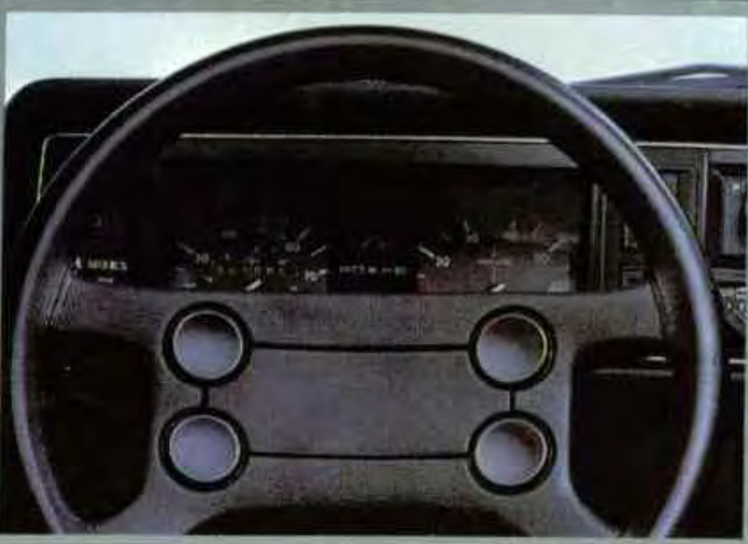
Sport steering wheel with padded center hub. (Standard on GTI)