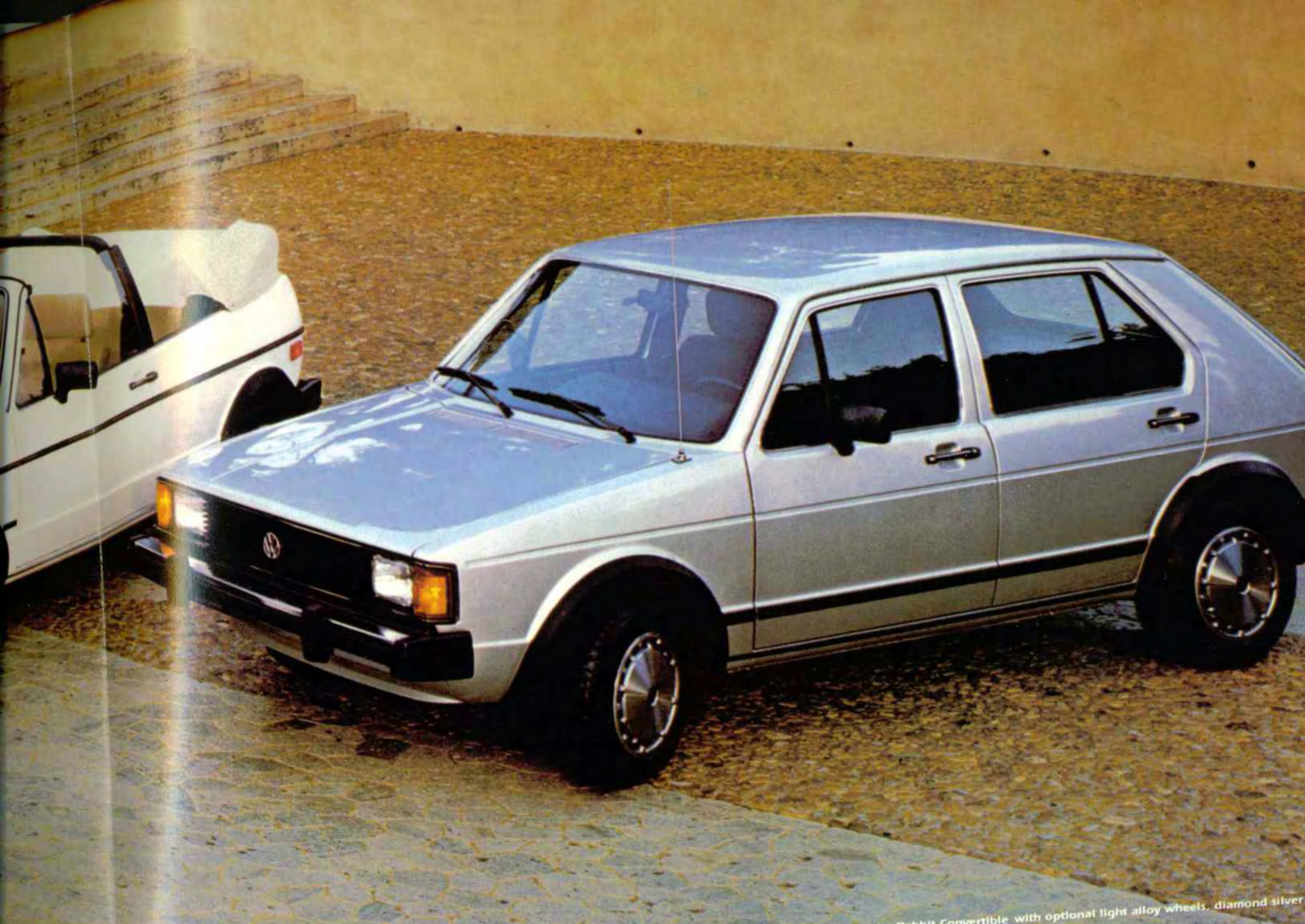
Left to right: Diamond silver metallic Rabbit GTI and centurion grey metallic Rabbit L both with optional sunroof; Alpine white Rabbit Convertible with optional light alloy wheels, diamond silver