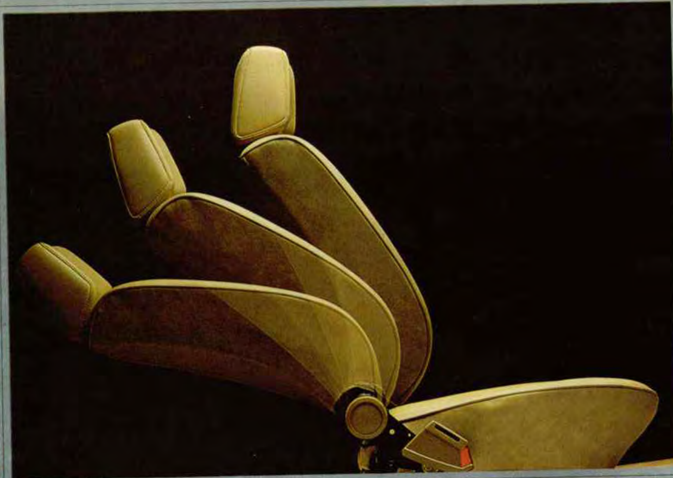
Seat recliner mechanism with adjustable head rest.