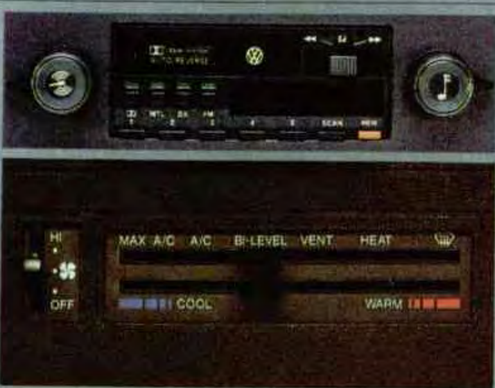
Electronic AM/FM stereo cassette and air conditioner.