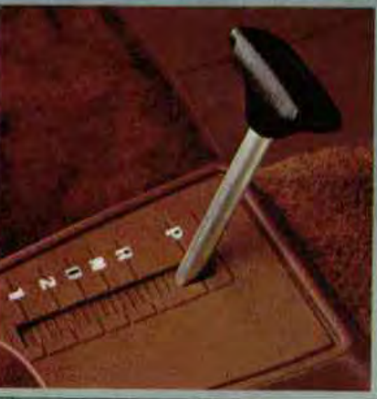
Fully automatic 3-speed transmission. (Rabbit L, GL and Convertible).