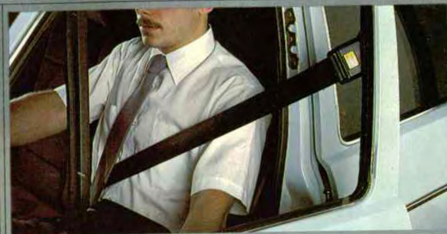
Passive restraint system (Rabbit L and GL only).