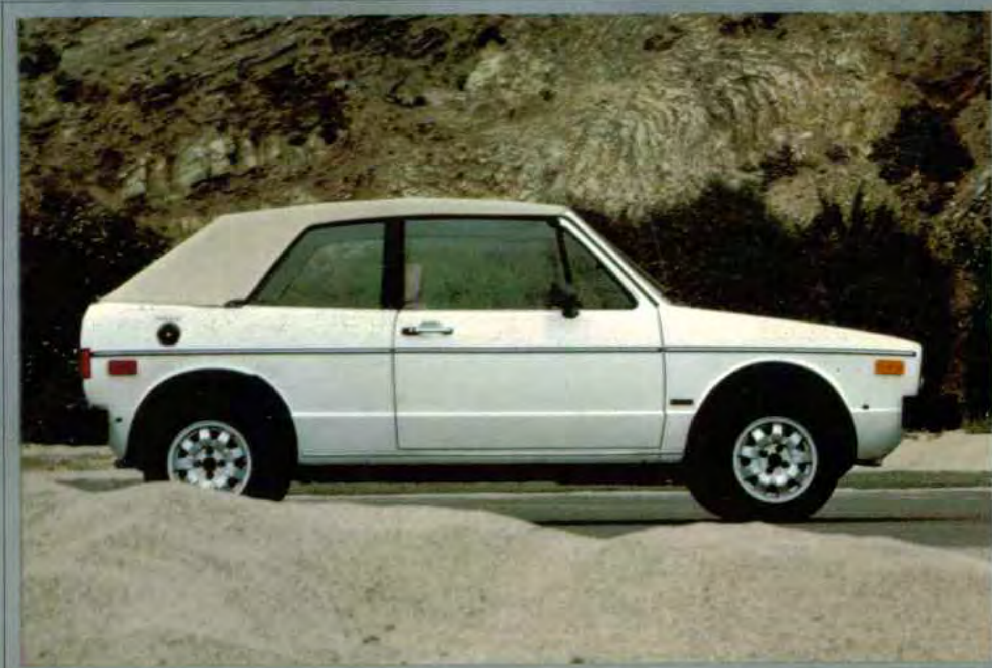
Opposite page: Alpine white Rabbit Convertible with optional light alloy wheels. Radio included as standard equipment on all convertibles.