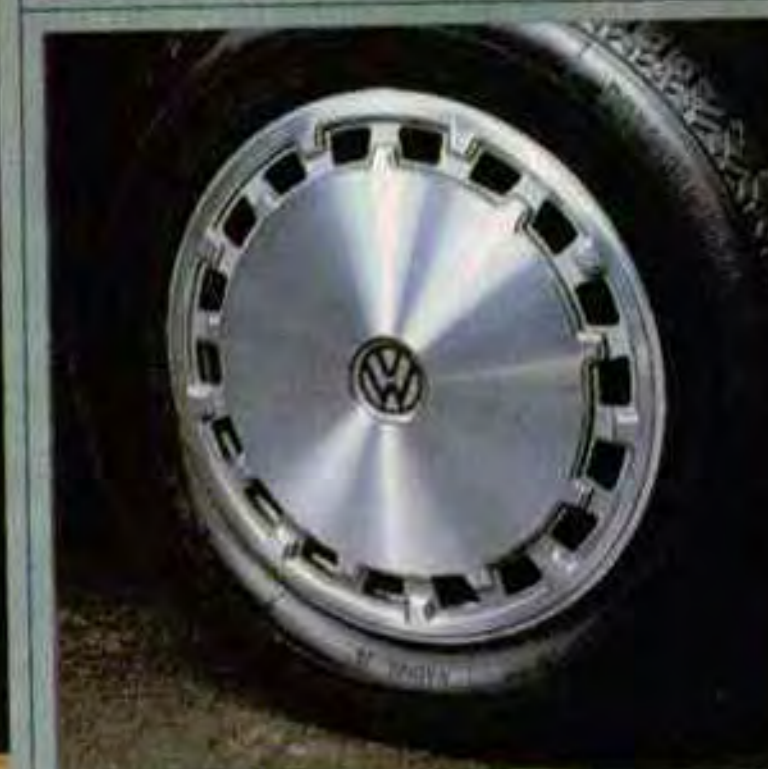
GTI light alloy wheel. Rabbit GL full wheel cover.