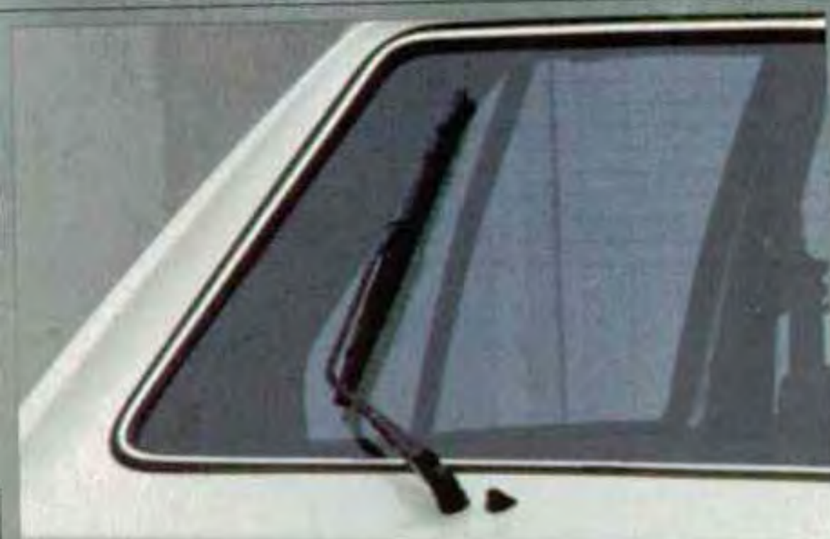
Rear window wiper and washer (standard on GTI).