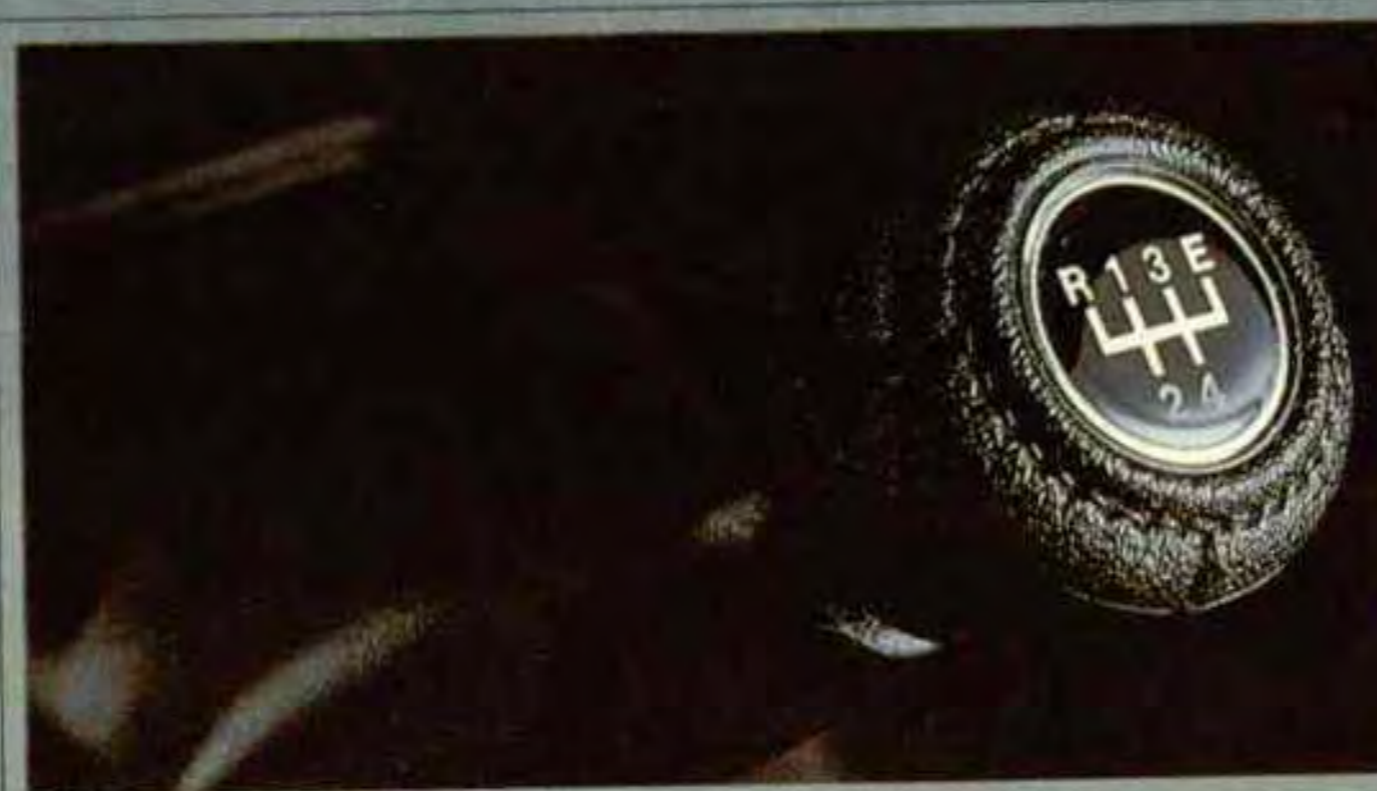
5-speed transmission with overdrive ratio (Rabbit L and GL).