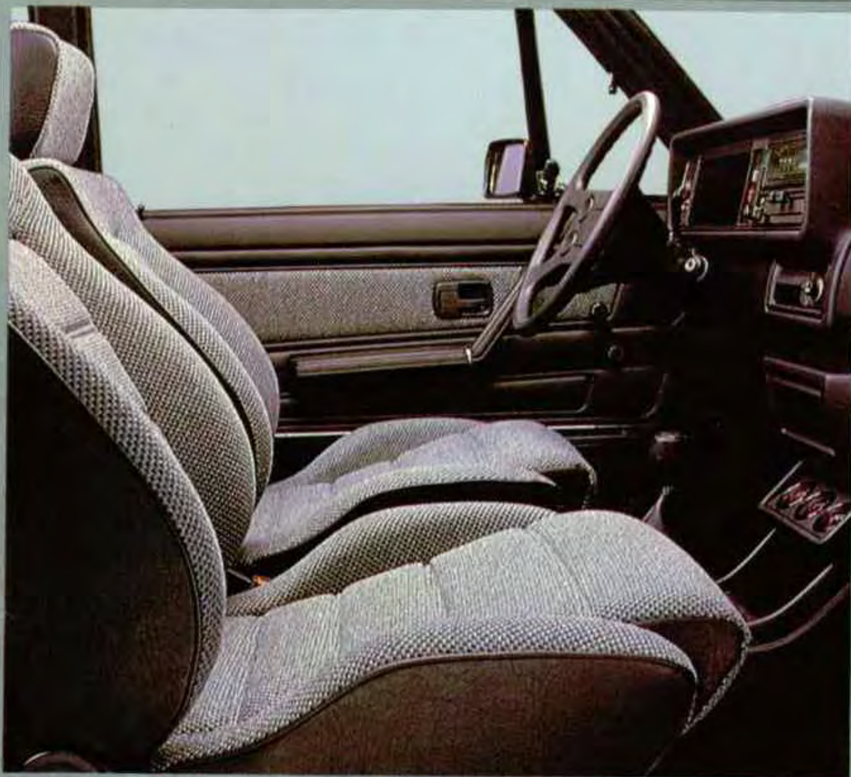
Rabbit Convertible interior. Center console with voltmeter, oil pressure and temperature gauge standard, sport steering wheel and cloth sport seats optional.