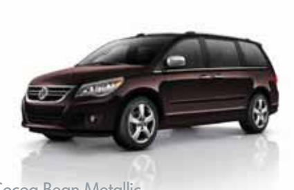
Cocoa Bean Metallic