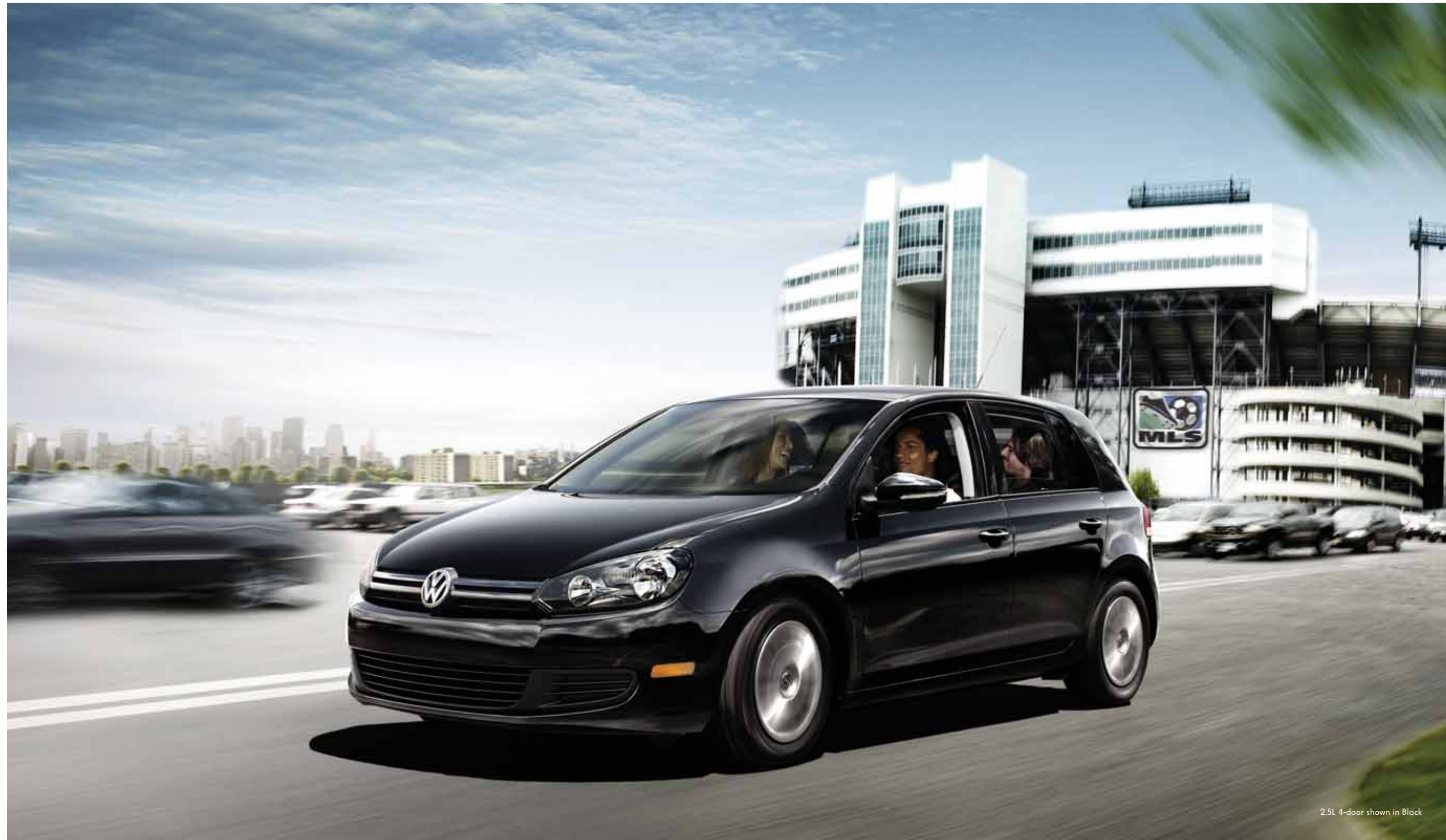
2.5L 4-door shown in Black

It's no small feat for the Golf TDI® Clean Diesel to be named a 2010 "Top 10 Green Car" by Kelley Blue Book's kbb.com.* Especially when it was announced at the New York International Auto Show that the Golf was awarded "World Car of the Year"*** in 2009. The thing is, what matters most is that customers around the world have been making the Golf one of the most popular compact cars for 36 years. And they've kept the Golf TDI in ultra-high demand every year it's been on the market. Don't get us wrong, all those awards are incredibly important and very flattering. But the awards panelists only have the privilege of driving the Golf during the judging process. When you own one, you get to drive it for years. So in the end, the fact that our customers keep coming back for more year after year is what keeps us innovating. Those awards, well, they're just more proof that we're doing something right.