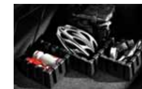
Heavy Duty Trunk Liner with Cargo Organizer Blocks