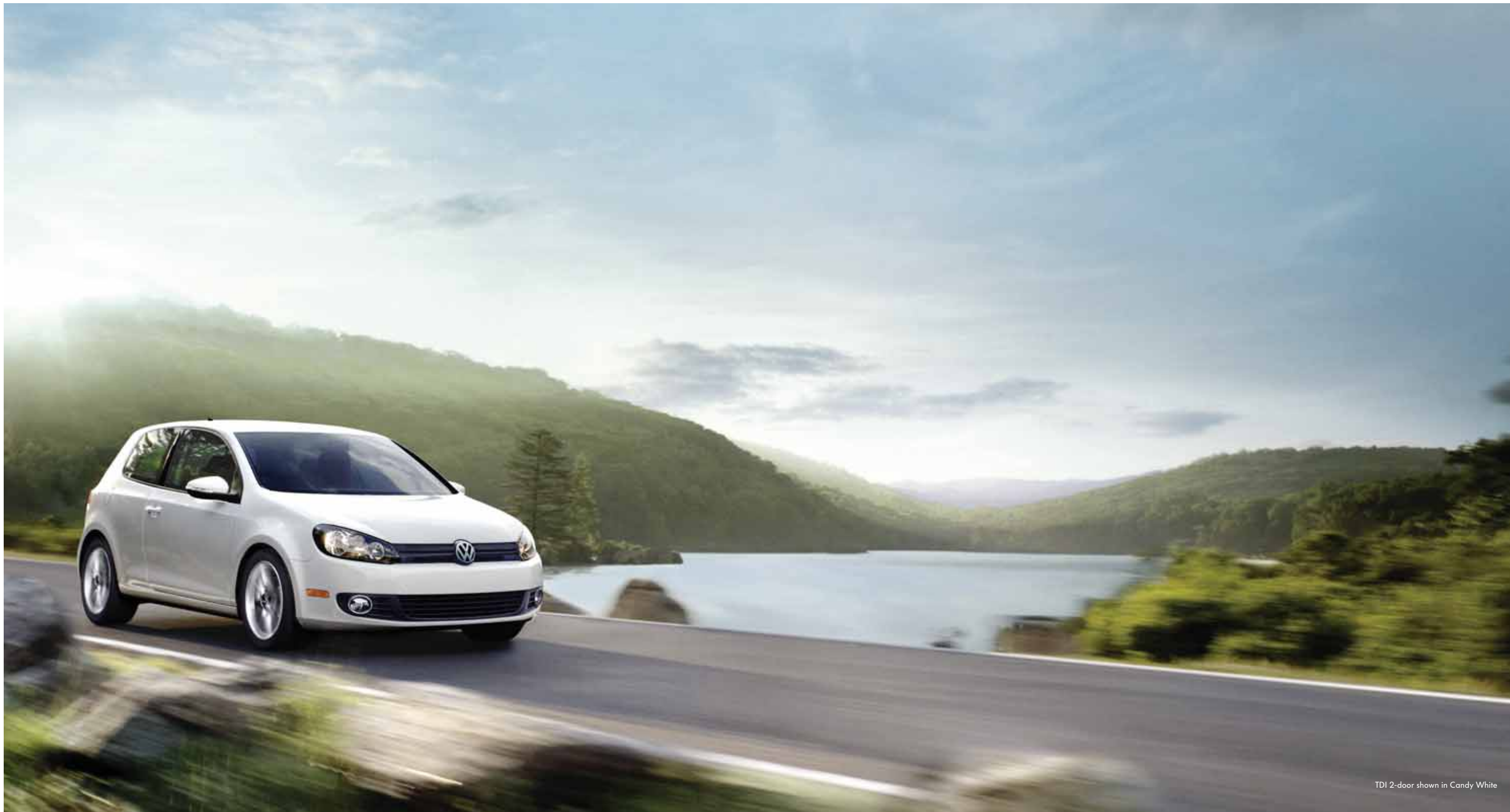
TDI 2-door shown in Candy White