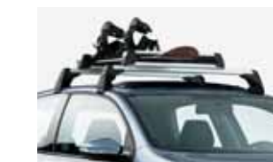
Base Carrier Bars with Ski and Snowboard Rack