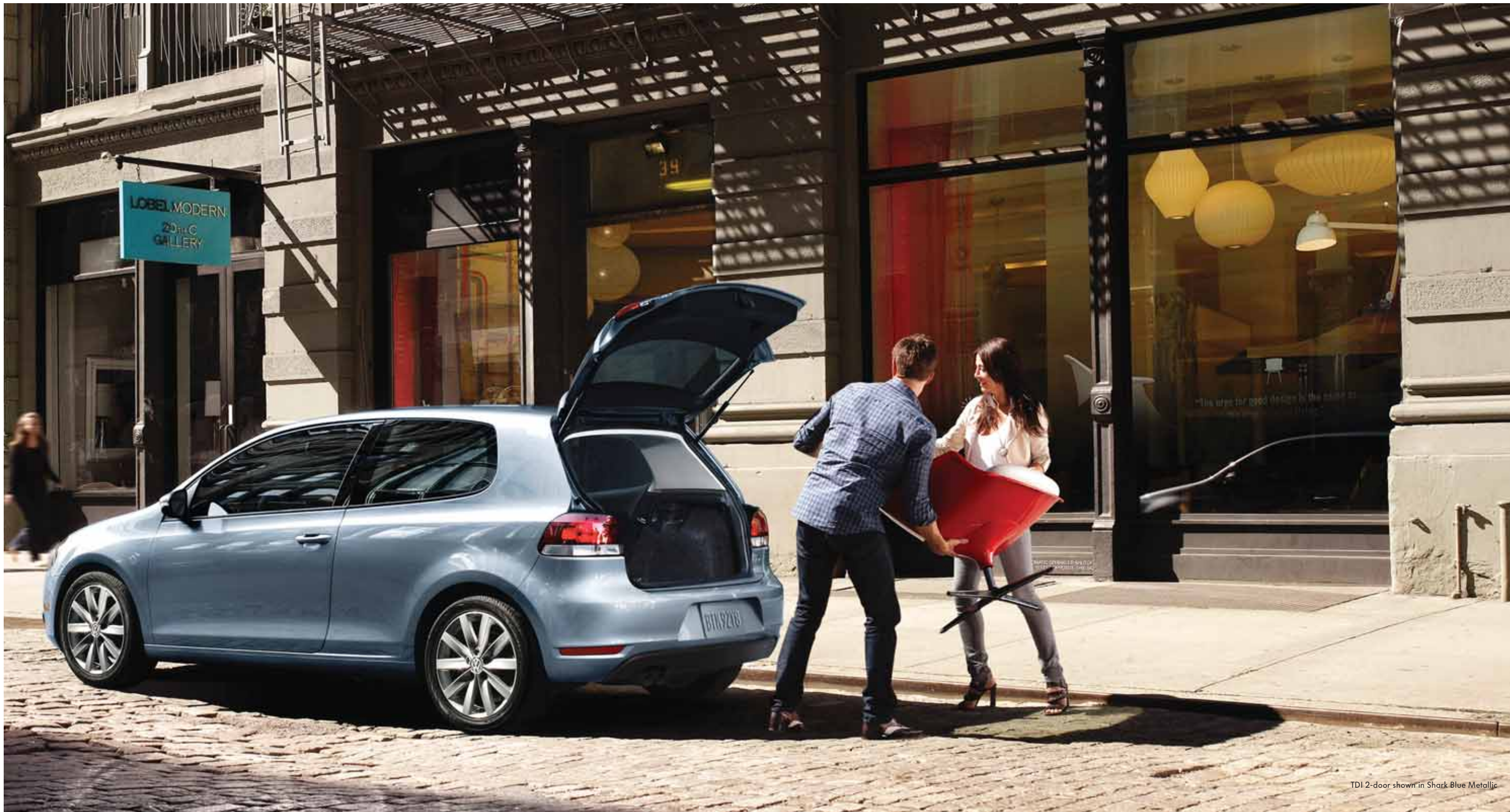
TDI 2-door shown in Shark Blue Metallic