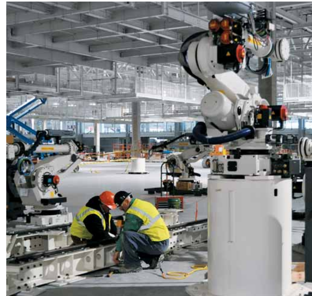
To help us ensure the highest-quality production for our cars, our employees help program each state-of-the-art robot to perform its specific task so the robots can assist during the production and assembly process.

In order to enable our employees to meet our high quality standards, we partnered with the state of Tennessee to build the Volkswagen Academy. We then hired the best team of trainers to ensure that we have the most talented group of plant technicians anywhere.