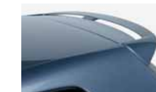
Rear Hatch Spoiler