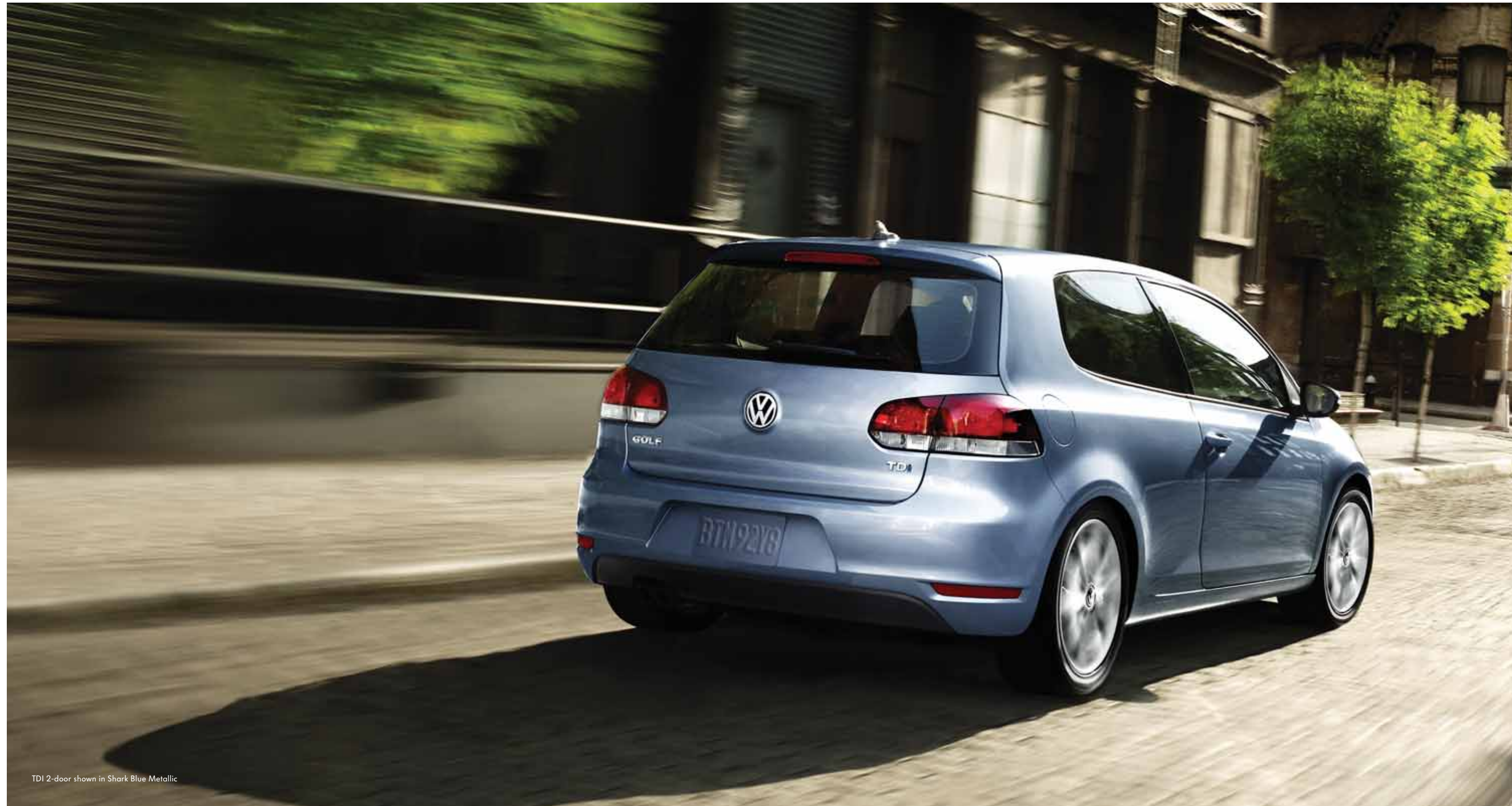
TDI 2-door shown in Shark Blue Metallic

*23 city/30 highway mpg (2011 Golf 2.5L, automatic transmission). **30 city/42 highway mpg (2011 Golf 2.0L TDI Clean Diesel, automatic transmission). Range based on 42 highway mpg estimate and a 14.5-gallon tank. EPA estimates. Your fuel consumption will vary. †2010 IntelliChoice Best Overall Values of the Year, www.IntelliChoice.com .