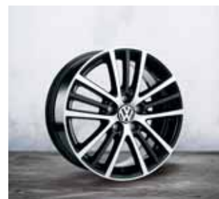
17" Bi-Color Onyx