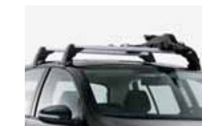
Base Carrier Bars with Barracuda® Bike Holder