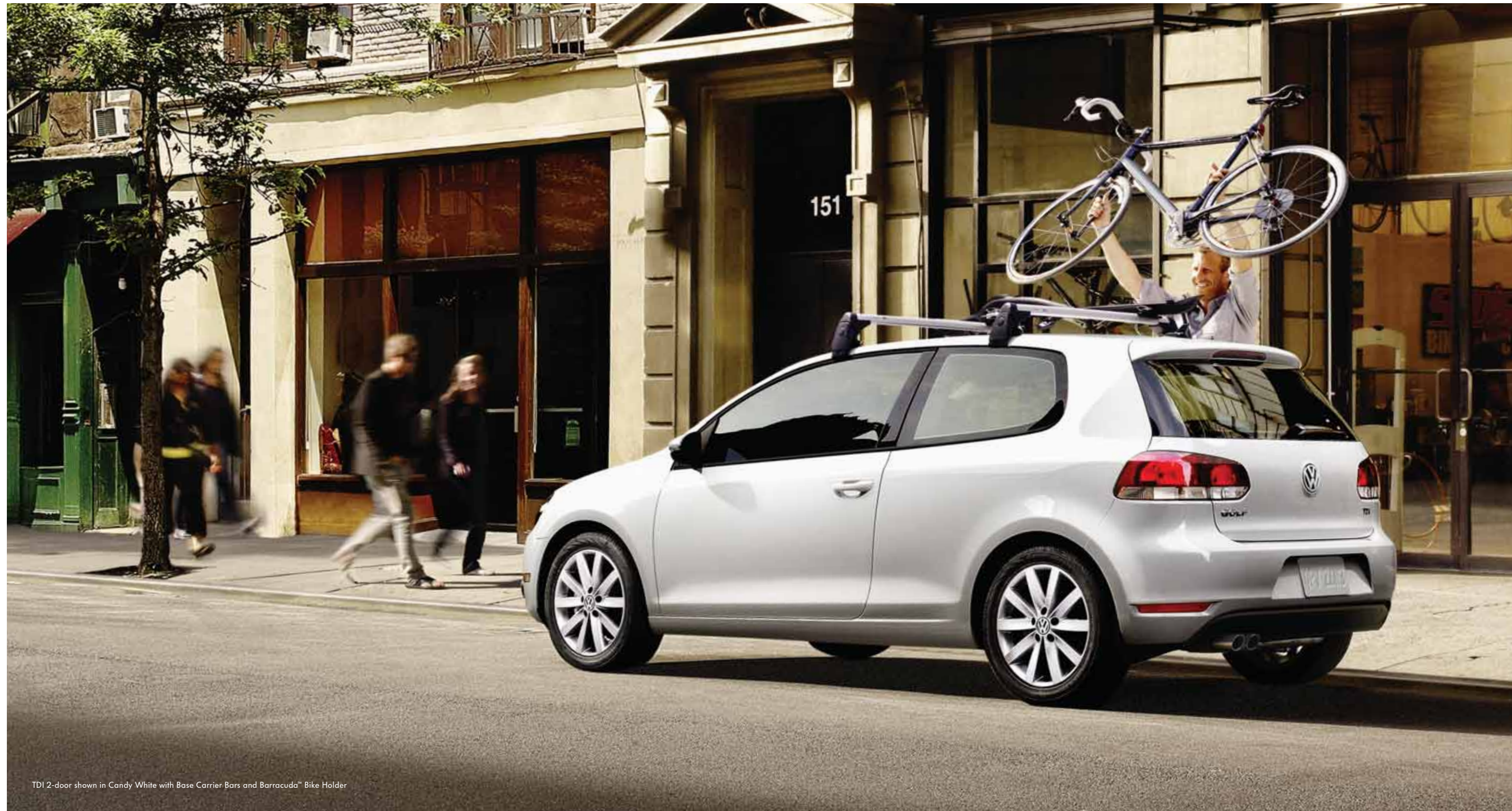
TDI 2-door shown in Candy White with Base Carrier Bars and Barracuda™ Bike Holder

How do you improve an icon? Slowly, but surely. Enter the 2011 Golf. Its signature front end tells you right away that you're driving the latest in Volkswagen design. Those assertive front headlights, the crisp, aerodynamic lines that take the classic shape one step forward—that's all Golf, and yet it's still fresh and new. The side mirrors have the turn signals built in. There are dual exhaust tips to complement the rear of every model. Or, should we say, complement it twice over. And the Golf TDI even comes standard with sleek, 17-inch Porto alloy wheels. These may seem like tiny improvements overall, but when you're starting with something that's already been perfected time and again, the only things that should be changed are the ones that can be improved. As they say, if it ain't broke, don't fix it. Which is probably why there are still so many Golf models on the road after all these years.