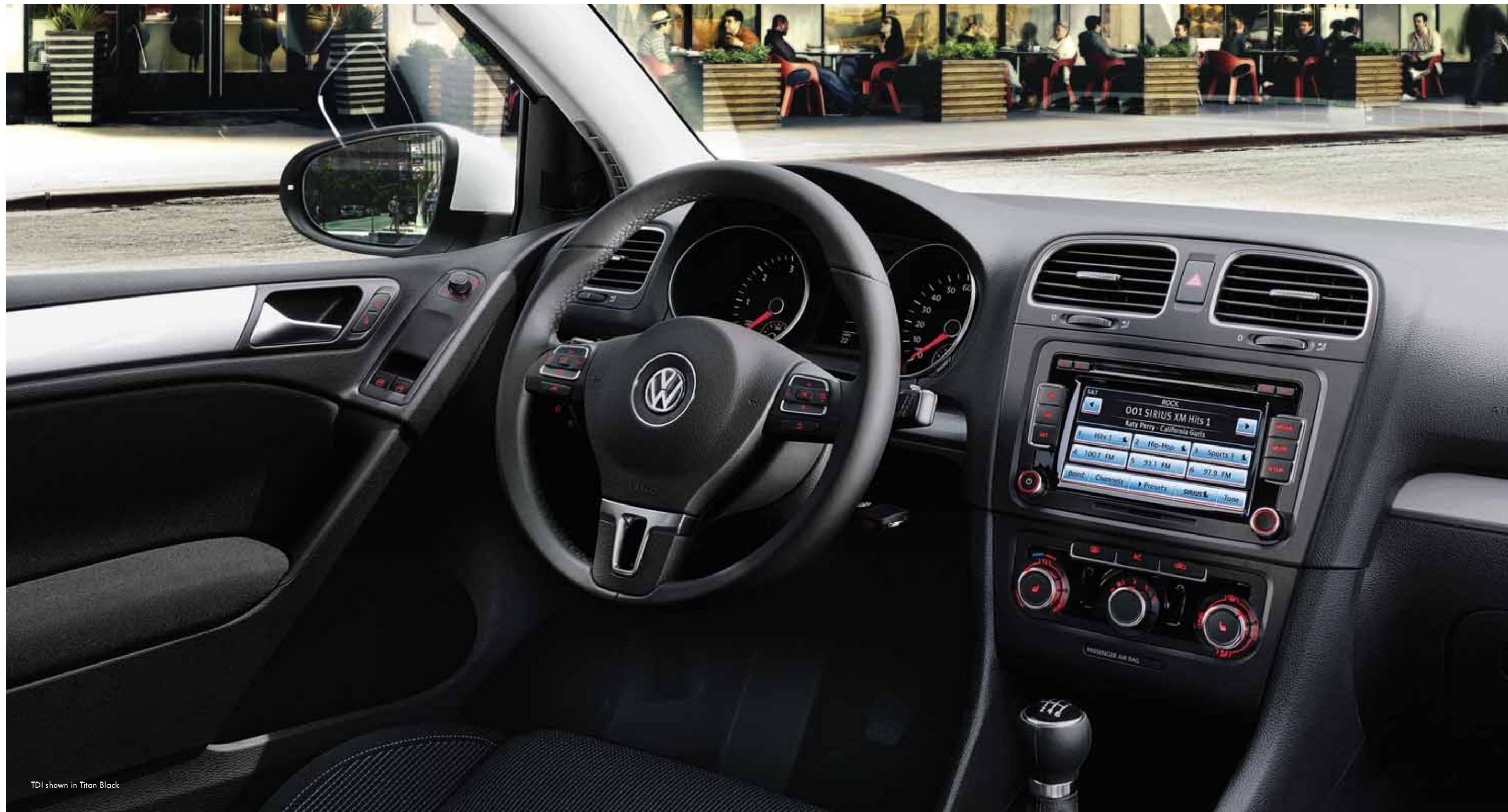
TDI shown in Titan Black

There's standard, and then there are standards. Every Golf is designed to the highest standards, and the 2-door and 4-door 2.5L models come standard with an AM/FM stereo, an in-dash CD player, an auxiliary input for connecting your portable MP3 player, and an eight-speaker sound system. You can even add Bluetooth® and heated front seats for an upgrade in both convenience and comfort. The 2-door and 4-door TDI Clean Diesel models, now that's a bit of a different story. They come standard with a premium touchscreen sound system complete with in-dash six-CD changer, Media Device Interface (MDI) with iPod® cable so you can easily navigate your playlists, albums, and songs, and a three-month trial subscription to SIRIUS Satellite Radio with over 130 channels, including 100% commercial-free music plus sports, news, talk, and entertainment. And don't forget the Bluetooth with voice command and phonebook download. All of those features can be controlled by the leather-wrapped, multi-function steering wheel, along with the onboard trip computer that can tell you everything from the temperature outside to the miles until your next fill up. And if you opt for the touchscreen navigation system, you'll always be able to find your way to wherever you're going and back home again. Just in case you want to get lost in the music, or the world, for a little while.