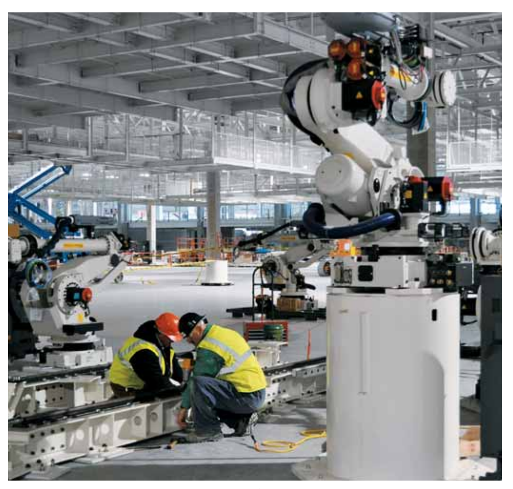
To help us ensure the highest-quality production for our cars, our employees help program each state-of-the-art robot to perform its specific task so the robots can assist during the production and assembly process.

In order to enable our employees to meet our high quality standards, we partnered with the state of Tennessee to build the Volkswagen Academy. We then hired the best team of trainers to ensure that we have the most talented group of plant technicians anywhere.