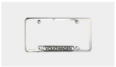
License Plate Frames