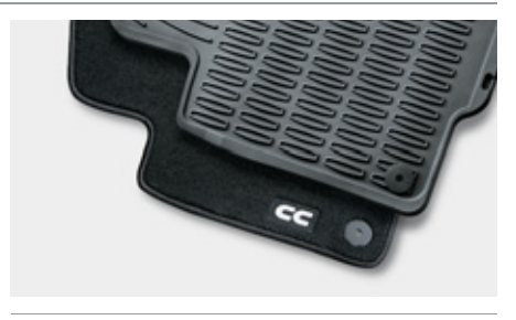
Monster Mats<sup>®</sup> and MojoMats<sup>®</sup>