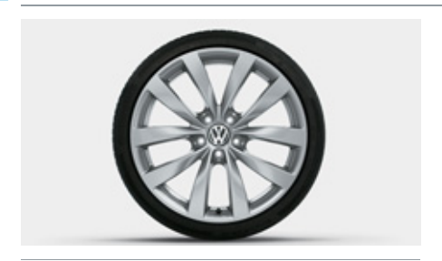
19" Sagitta Wheels