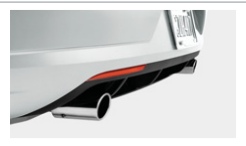
Chrome Exhaust Tips