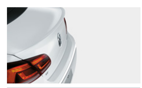
Rear Lip Spoiler