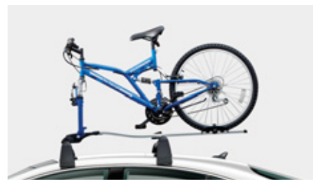
Base Carrier Bars and Fork Mount Bike Holder Attachments