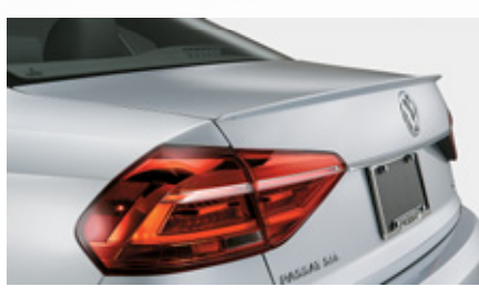
Rear Lip Spoiler