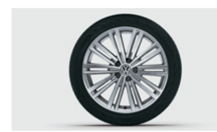
19" Luxor Wheel