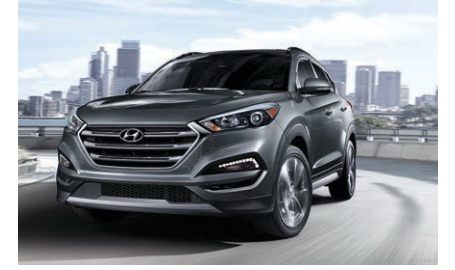
Confidence At All Four Corners To optimize traction, Tucson offers an available Active Cornering Control All Wheel Drive system. It uses an engineering advance called torque vectoring to distribute more power to the outside rear wheel, while applying braking to the Tucson's Active Cornering Control, our advanced inside rear wheel for better stability and neutral handling when cornering.

Suit Yourself A feature called Drive Mode Select tailors the engine, transmission and steering response to suit your preference. Choose Eco, Normal or Sport mode, and Tucson precisely alters its performance to that characteristic. Drive Mode Select also syncs with next-generation All Wheel Drive system.