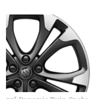
20" Dynamic Twin-Spoke Bi-Color Finish Standard on Premium.