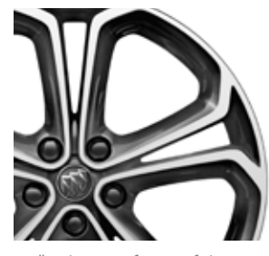
20" Diamond Graphic Twin-Spoke Bi-Color Finish Standard on Cascada (1SV). Available on Premium