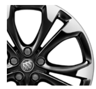
20" Dynamic Twin-Spoke With Blacked-Out Pockets Exclusive to Sport Touring.