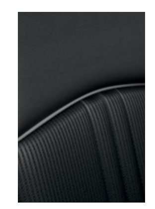
Black Leatherette with cloth inserts Touring