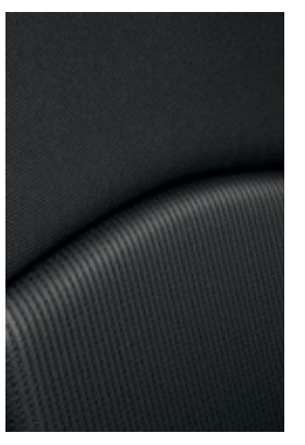
Black Cloth Sport