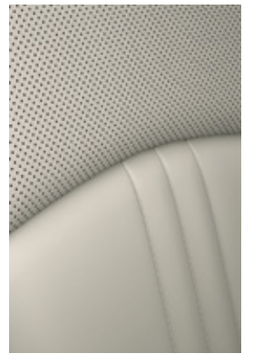
Parchment Leather Grand Touring

Upholstery plays a unique role in automotive design. It is the one element that makes direct contact with the driver and passengers throughout the entire drive. Every inch of our carefully constructed upholstery elevates your journey in both beauty and comfort. Expert fabricators experiment with textures, stitching and seam placements to create a range of distinct and expressive designs. So you can enjoy an elegant level of refinement in every Mazda CX-3. It's one more way we consider you in every aspect of your drive.