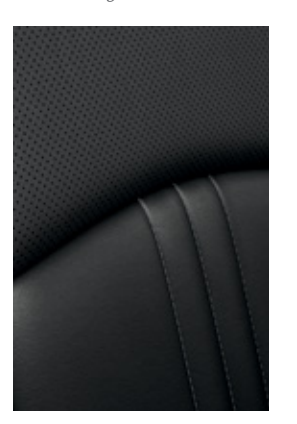
Black Leather Grand Touring