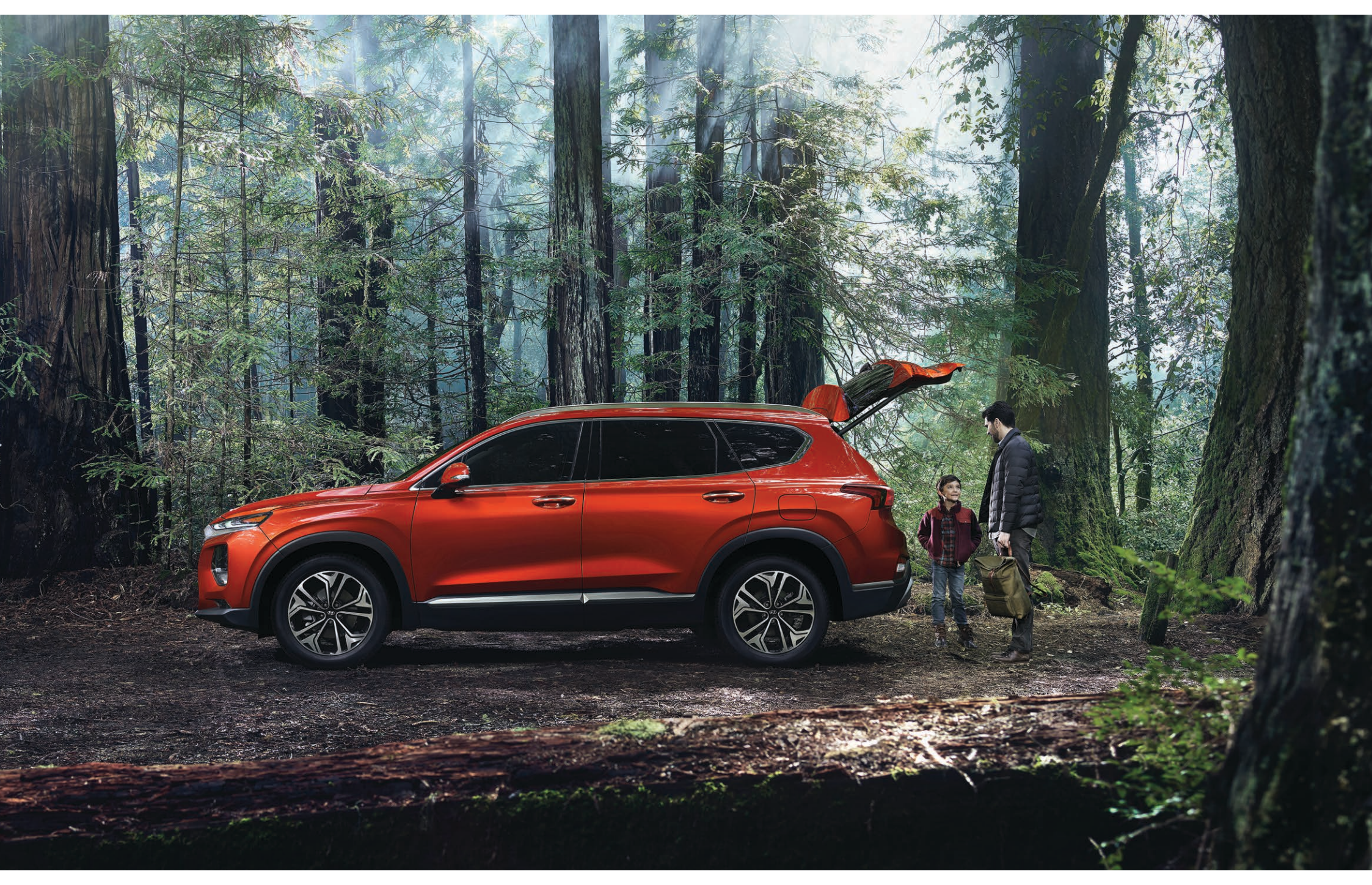
SANTA FE Ultimate in Lava Orange