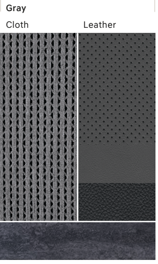
Metallic Interior Accents