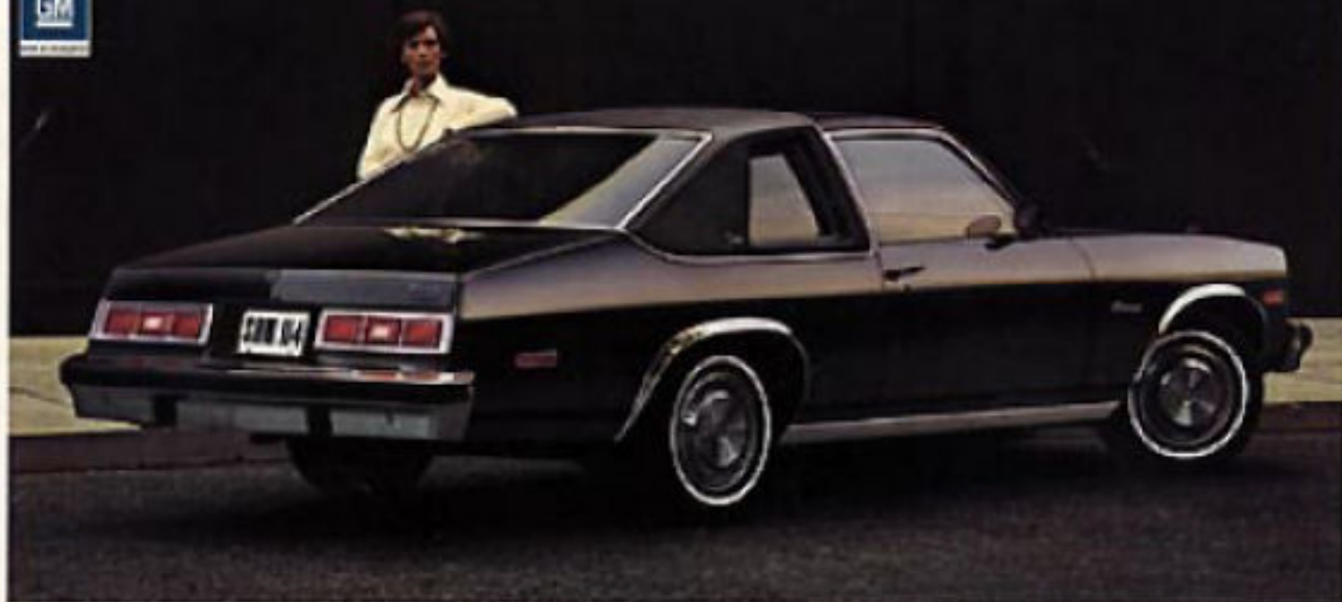
Concours Coupe, shown with available Cabriolet vinyl roof cover, Custom Appearance Group, sport mirrors and white stripe tires.