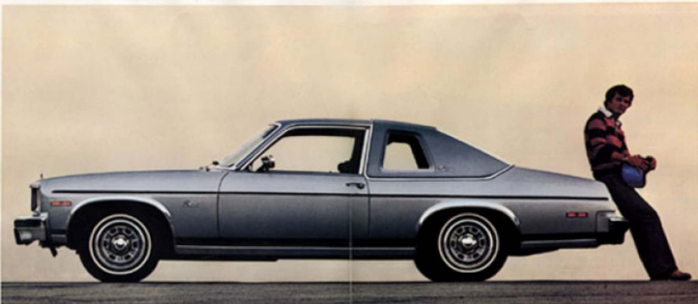
Concours Coupe. Shown with available Custom Appearance Group, Cabriolet roof cover, remote-control outside mirror, white stripe tires and Rally wheels.

For example, Concours' standard engineering features include front disc and finned rear drum brakes for smooth stops. A High Energy Ignition system delivers to the plugs a spark that is up