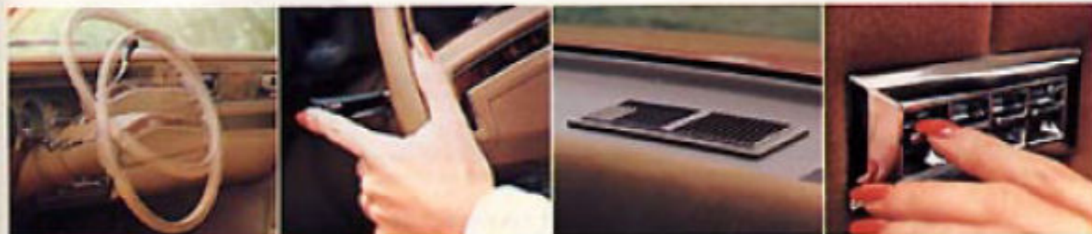
Comfortilt steering wheel.