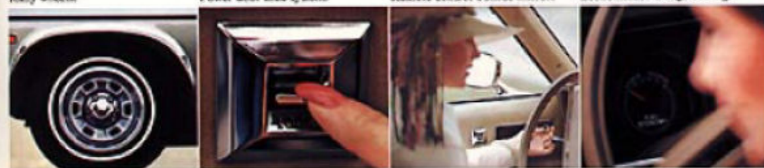
Econominder Gauge Package.