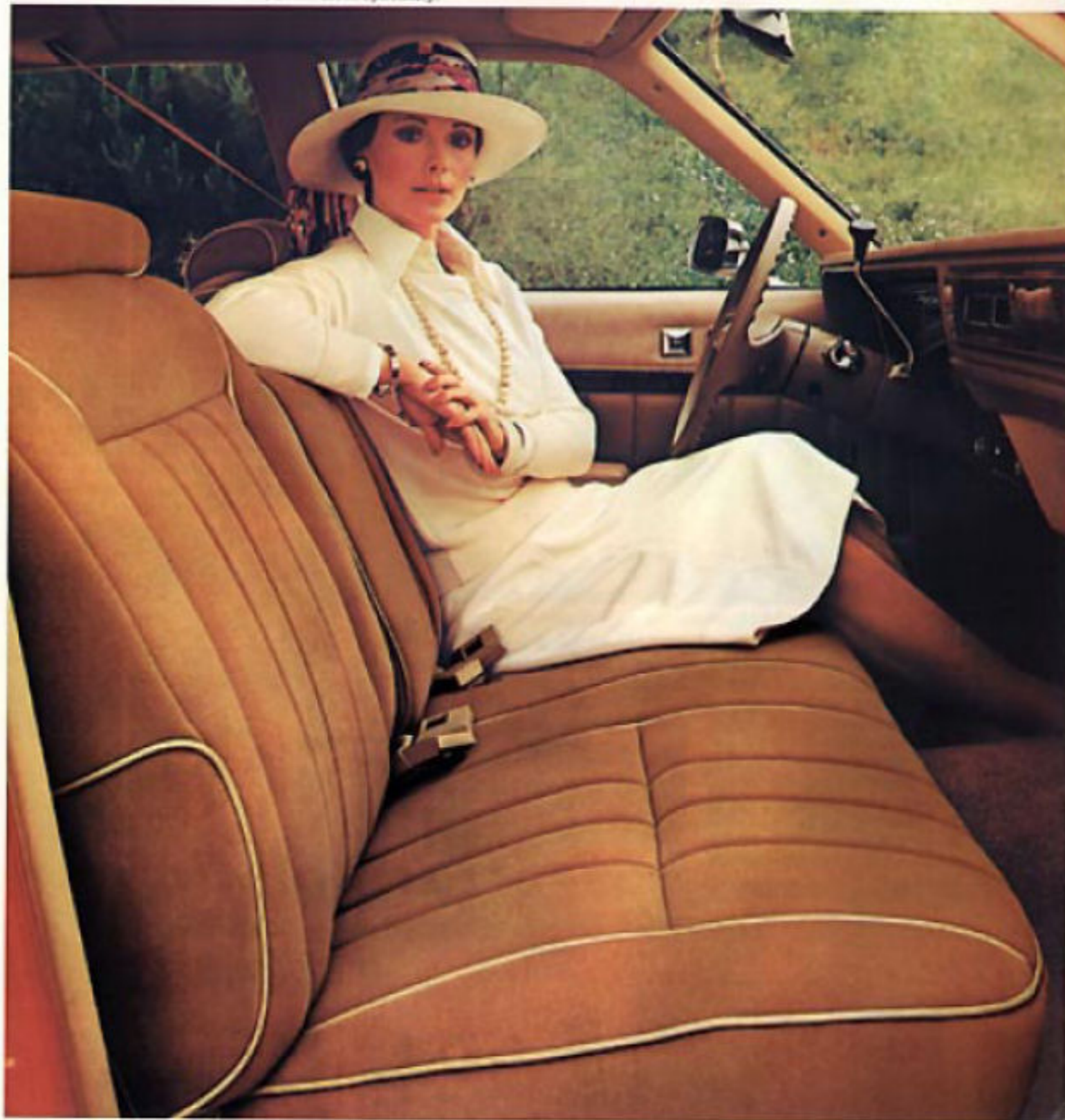
Concours Sedan interior with available knit cloth upholstery.