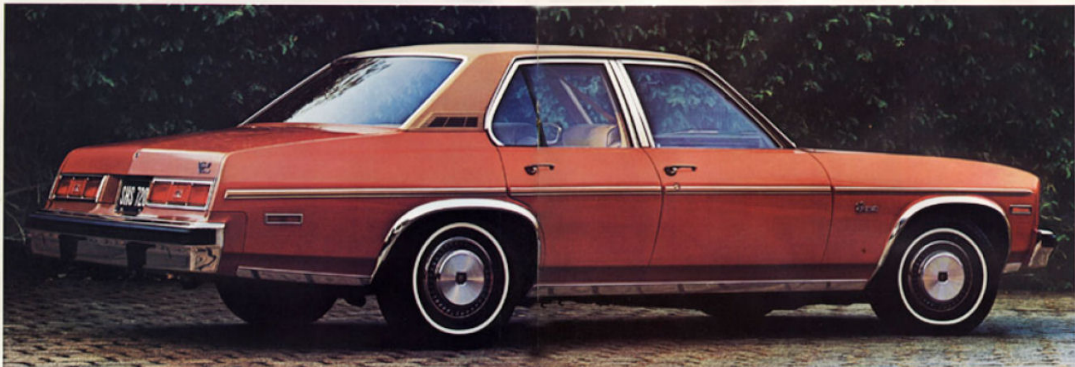
Concoors 4-Door Sedan, shown here and on front cover, with available Custom Appearance Group, remote-control outside mirror and white stripe tires.

Concours. It looks luxurious. It works beautifully.