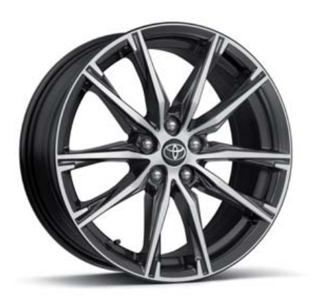
17-in. twisted spoke alloy wheel