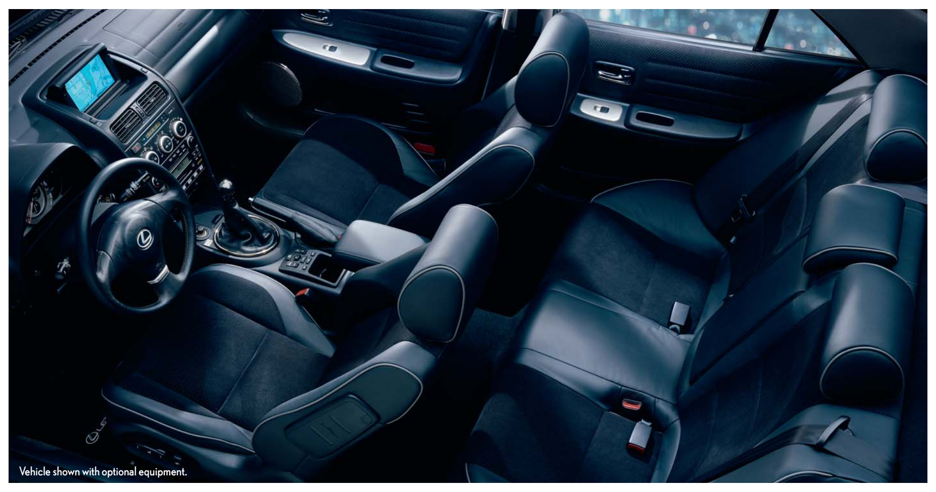
PRO: There's room for passengers. CON: Eventually, they'll ask to drive. In addition to the available perforated leather-trimmed seats, you can choose the available leather/Alcantara seating surface. This textured combination is designed to hold you tightly in the center of the seat as well as helping to secure you during aggressive cornering.