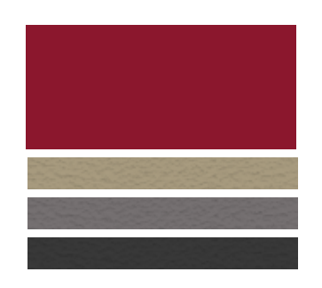
MATADOR RED MICA Ivory, Light Gray or Black Leather