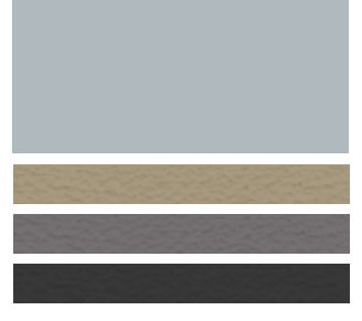
BREAKWATER BLUE METALLIC Ivory, Light Gray or Black Leather