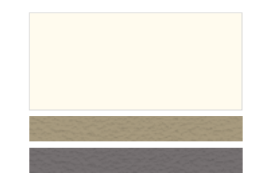
BAMBOO PEARL Ivory or Light Gray Leather