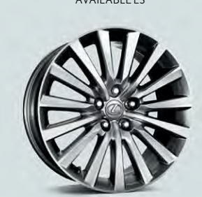
19-in 15-spoke alloy wheels<sup>1</sup> AVAILABLE LS