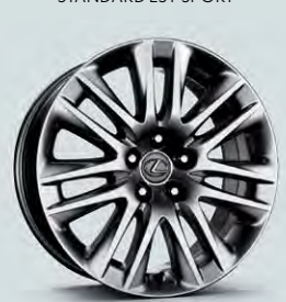
19-in split-seven-spoke alloy wheels<sup>1</sup> STANDARD LSh AVAILABLE LS