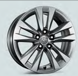
18-in split-five-spoke alloy wheels<sup>1</sup> STANDARD LS