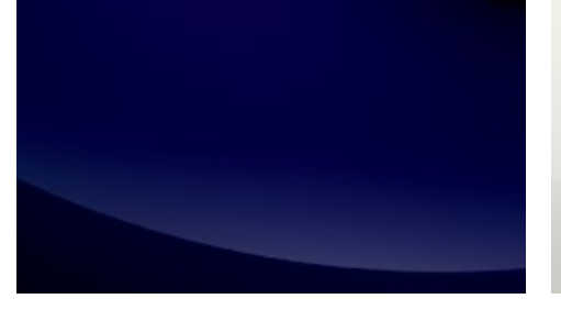
DEEP SEA MICA