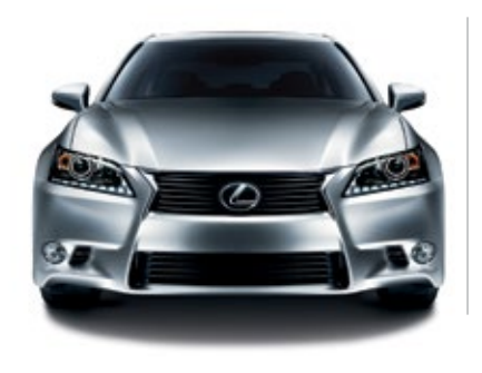
HEIGHT 57.3 IN (RWD, Hybrid) 57.9 IN (AWD)

FUEL ECONOMY, ESTIMATED RATINGS (CITY / HIGHWAY / COMBINED)