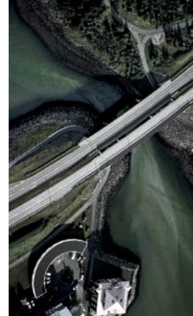
Lexus engineers traveled the equivalent of 26 times around the Earth—from the ice-covered streets of Moscow to the extreme heat of Death Valley—all to develop the precise driving feel and responsiveness of the GS. Strap yourself in and carve through that first turn, and you'll quickly discover it was worth every inch.