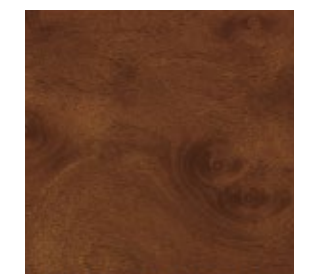
MATTE DARK BROWN WALNUT* WOOD<sup>†</sup>