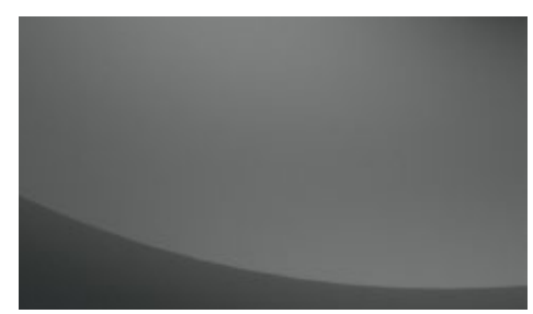
NEBULA GRAY PEARL