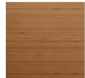
LINEAR ESPRESSO MATTE BAMBOO