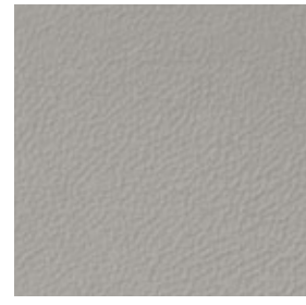
LIGHT GRAY LEATHER