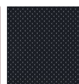
BLACK WITH WHITE PERFORATIONS LEATHER