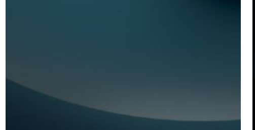
METEOR BLUE MICA