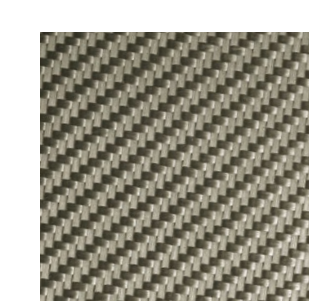
DARK ALUMINIZED COMPOSITE