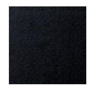
BLACK SEMI-ANILINE LEATHER