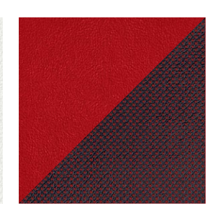
RED and BLACK LEATHER with BLACK ALCANTARA