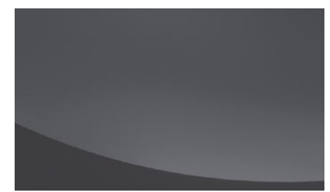
NEBULA GRAY PEARL