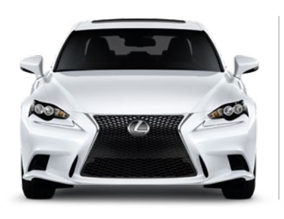
HEIGHT 56.3 IN

FUEL ECONOMY, EPA-ESTIMATED RATINGS (CITY/HIGHWAY/COMBINED)