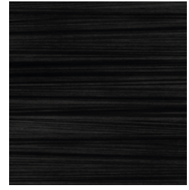
LINEAR DARK GRAY WOOD