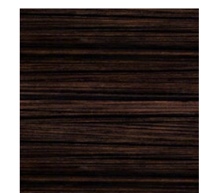
LINEAR DARK BROWN WOOD