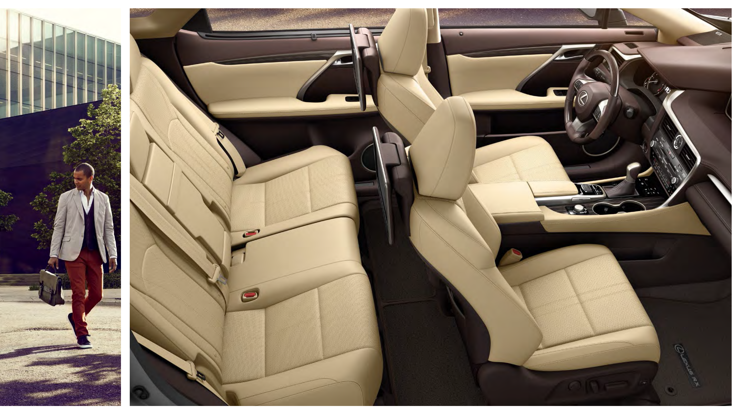
The cutting edge doesn't have to sacrifice comfort. The RX offers power-reclining<sup>5</sup> and power-folding 60/40-split heated rear seats, as well as heated and ventilated front seats.