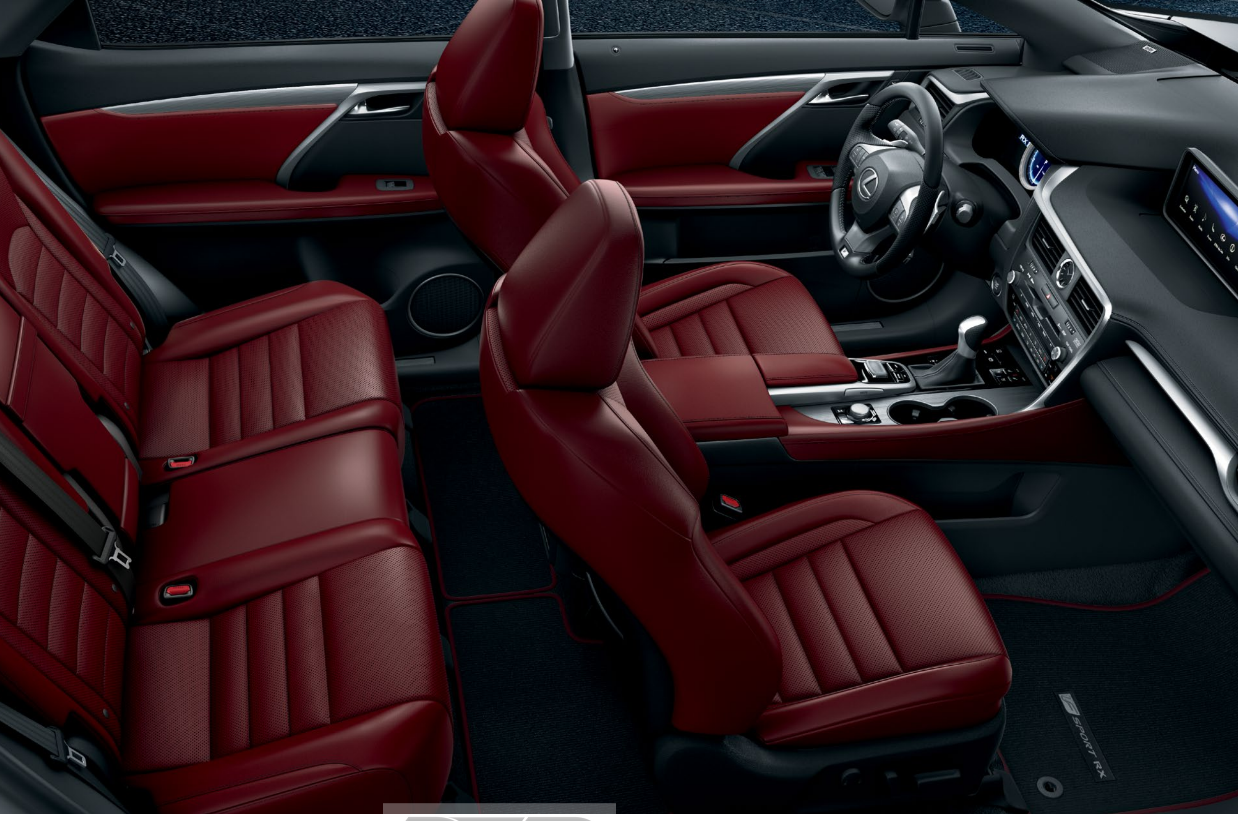
The cutting edge doesn't have to sacrifice comfort. The RX features 40/20/40-split rear seats, and offers heated and ventilated front seats.