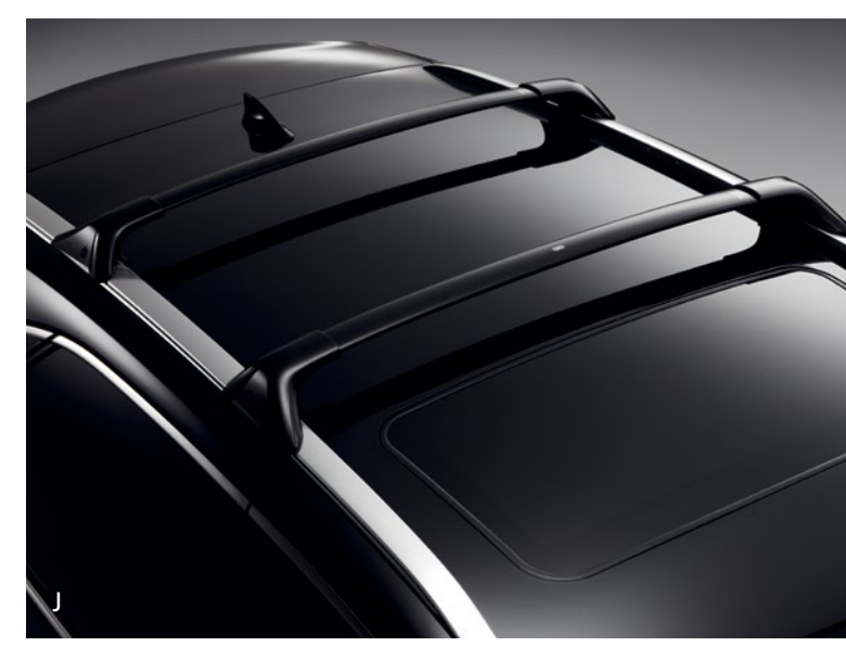
For a complete list of Genuine Lexus Accessories, visit lexus.com/RX/accessories