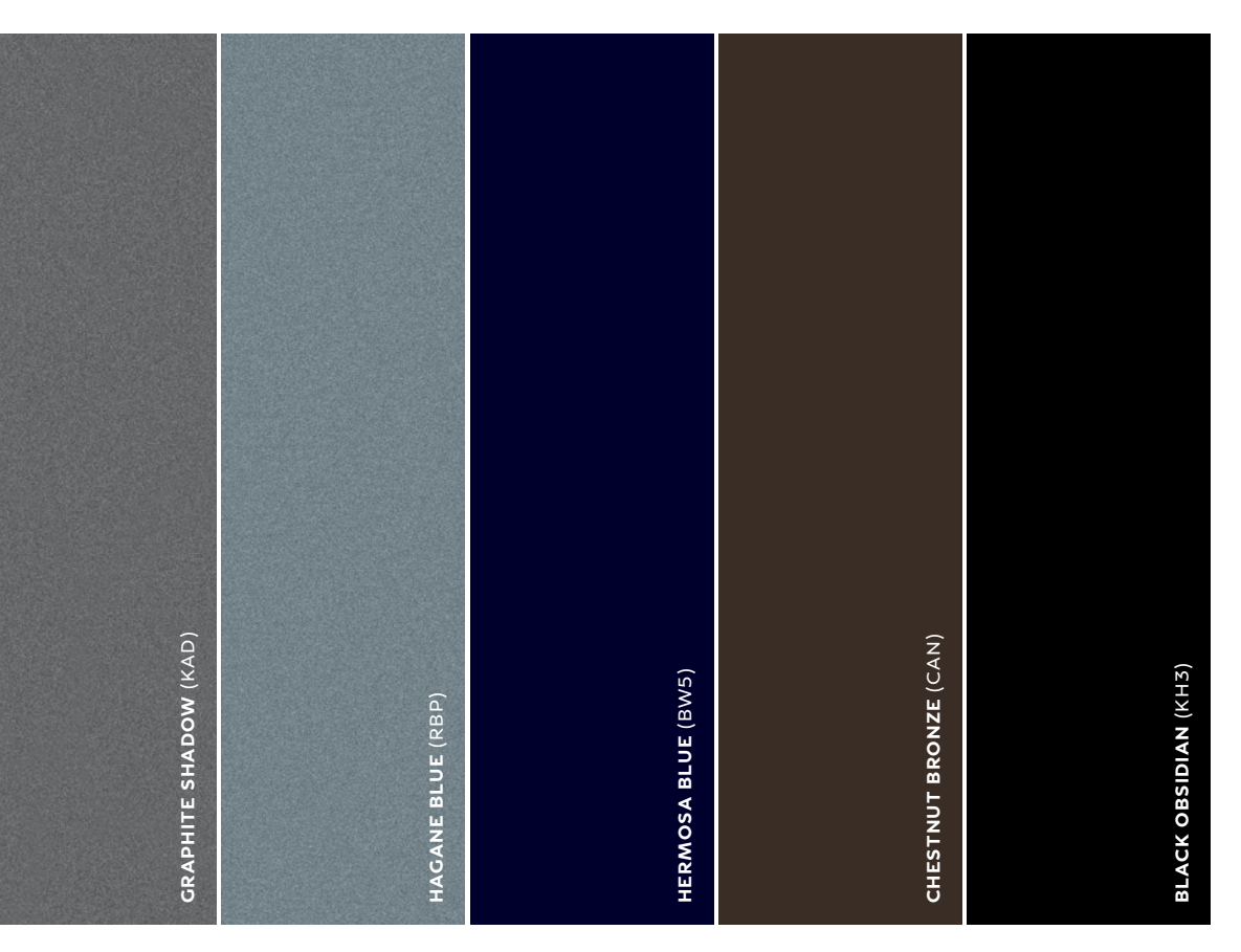
INFINITI has taken care to ensure that the color swatches presented here are the closest possible representations of actual vehicle colors. Swatches may vary slightly due to the printing process and whether viewed in daylight, fluorescent or incandescent light. Please see the