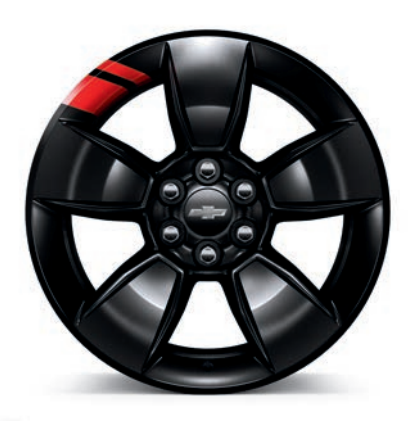
18" Black-Painted Cast-Aluminum with Red Accents (Available with Redline Edition)