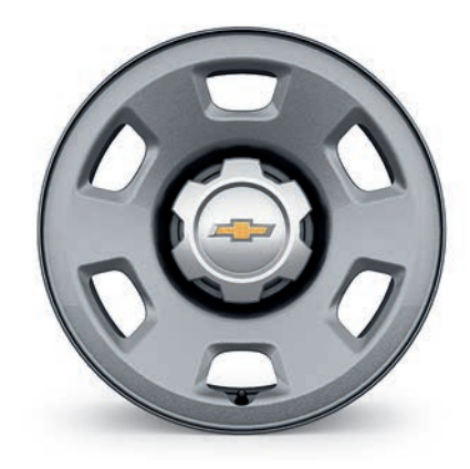
16" Ultra Silver Metallic-Painted Steel (Standard on Base and WT)