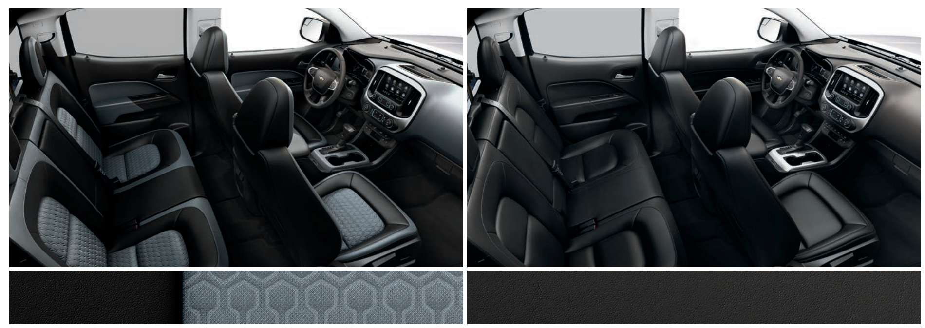
Jet Black/Dark Galvanized Cloth with Leatherette Appointments and Jet Black Accents<sup>3</sup>