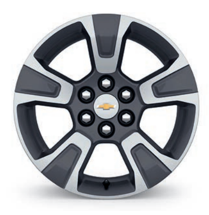
17" Dark Argent Metallic-Painted Cast-Aluminum (Standard on Z71)