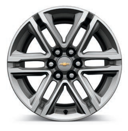
18" Dark Argent Metallic-Painted Cast-Aluminum (Available on WT<sup>1</sup> and LT)