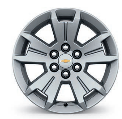
17" Blade Silver Metallic-Painted Cast-Aluminum (Standard on LT and available on WT with Duramax 2.8L Turbo-Diesel engine)