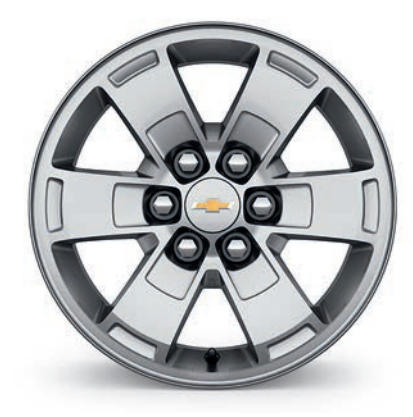
16" Ultra Silver Metallic-Painted Cast-Aluminum (Available with WT Appearance Package)