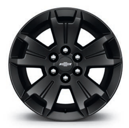
17" Gloss Black-Painted Cast-Aluminum (Available with Z71 Midnight Edition, ZR2 Dusk Special Edition or ZR2 Midnight Special Edition)