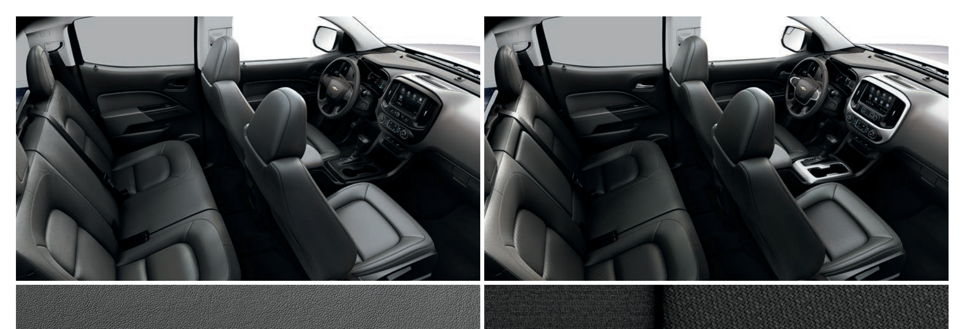
Dark Ash Vinyl with Jet Black Accents<sup>1, 2</sup>