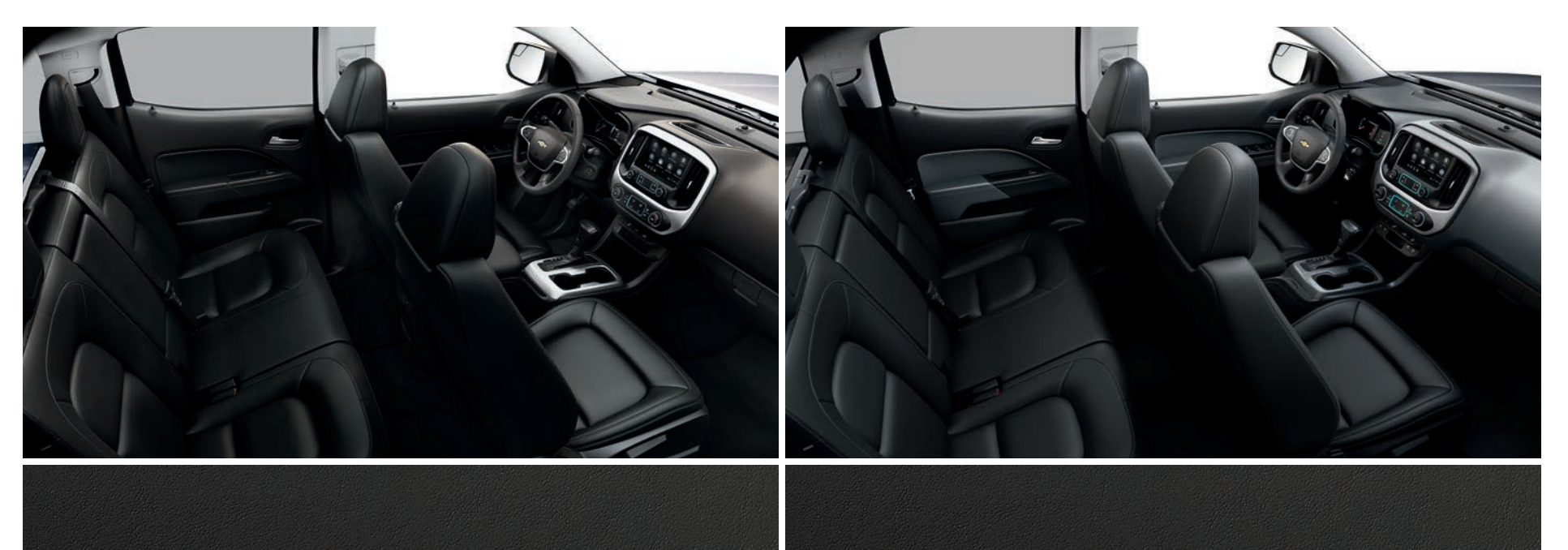
Jet Black Leather Appointments with Jet Black Accents<sup>1</sup>