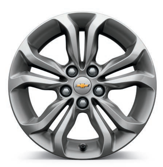
16" Aluminum (Standard on LT and Diesel; included with LS Convenience Package)