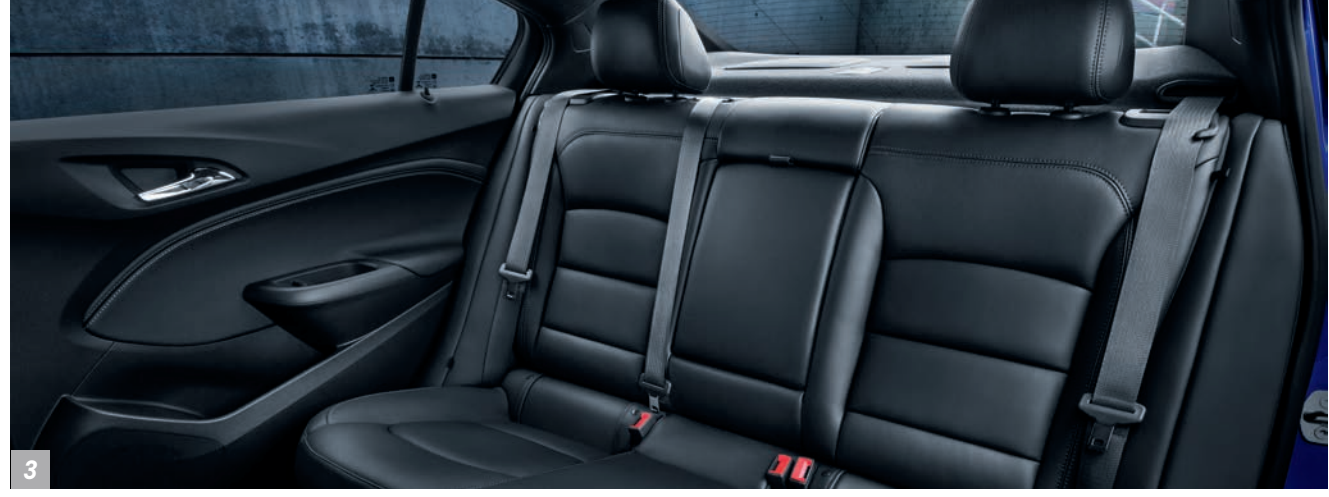
\underline{1} \ \textit{Read the vehicle Owner's Manual for important feature limitations and information.} \ \underline{2} \ \textit{Does not detect people or items. Always check rear seat before exiting.}