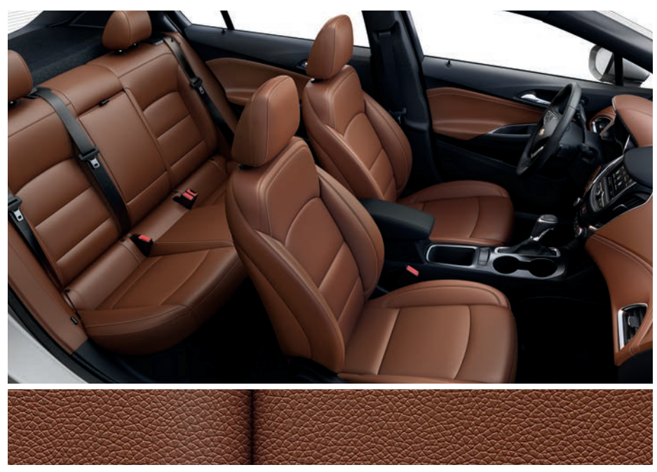
Umber Leatherette with Jet Black Accents<sup>1,2</sup>