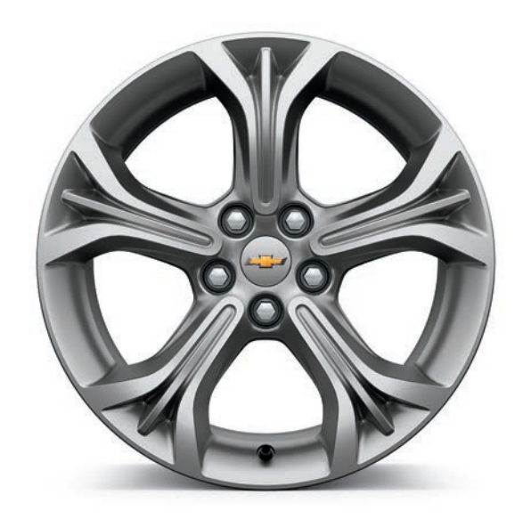
17" Aluminum (Standard on Premier)