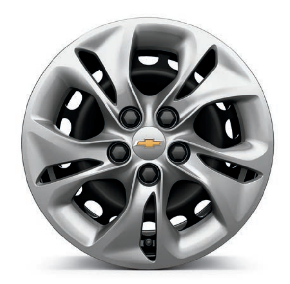
15" Steel with Painted Wheel Cover (Standard on L and LS)