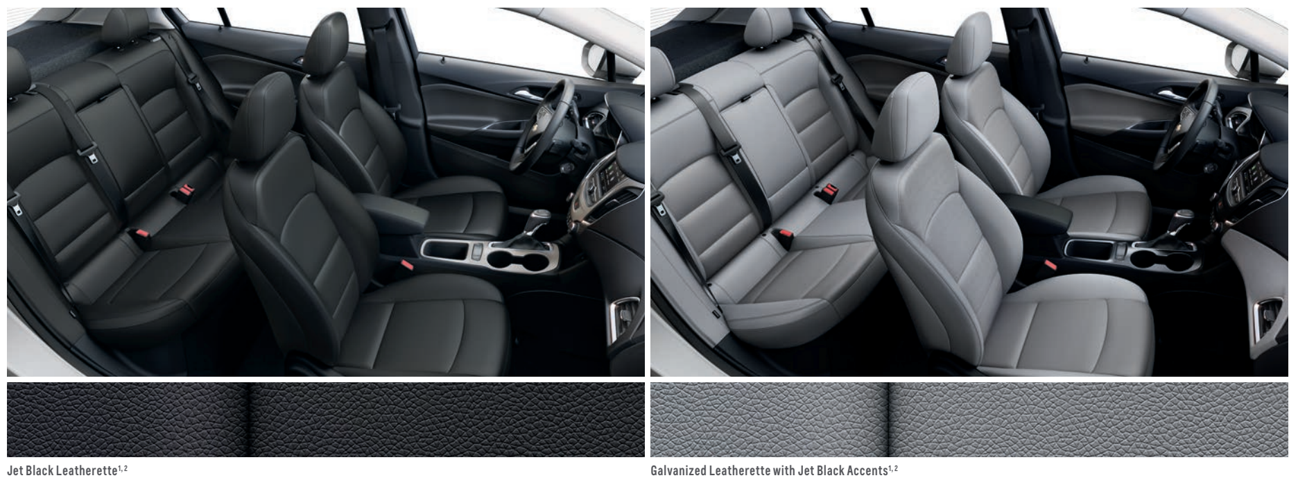
Jet Black Leatherette<sup>1, 2</sup>