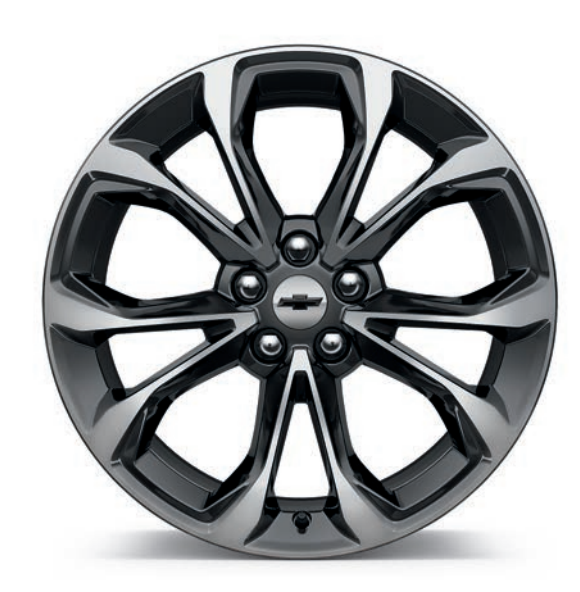
18" Machined-Face Aluminum (Included with RS Package on Diesel Hatchback and Premier)