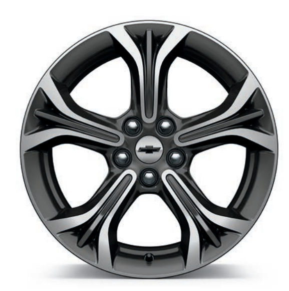
17" Aluminum (Included with RS Package on LT)