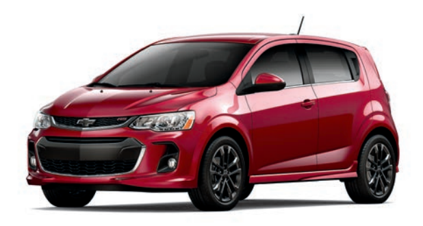
CAJUN RED TINTCOAT<sup>1, 2</sup>