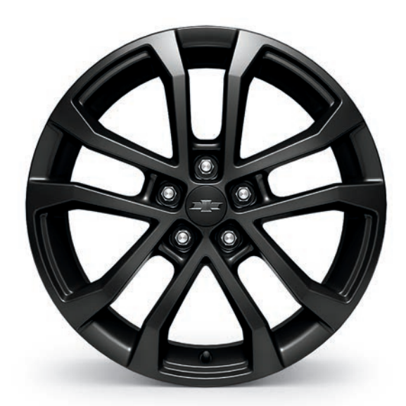
17" Black-Painted Aluminum (Standard on Premier RS Hatchback. Available on Premier Sedan; requires available RS Package)