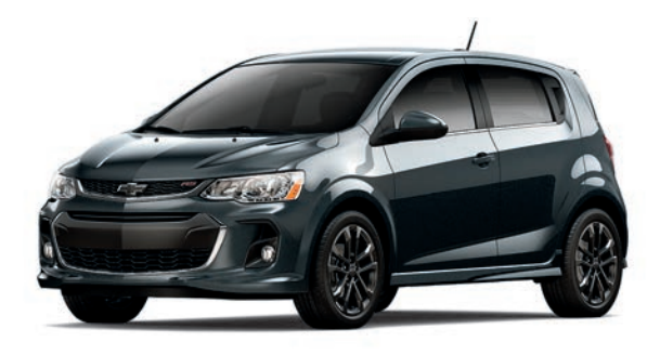
NIGHTFALL GRAY METALLIC