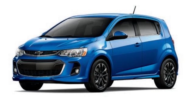
KINETIC BLUE METALLIC1