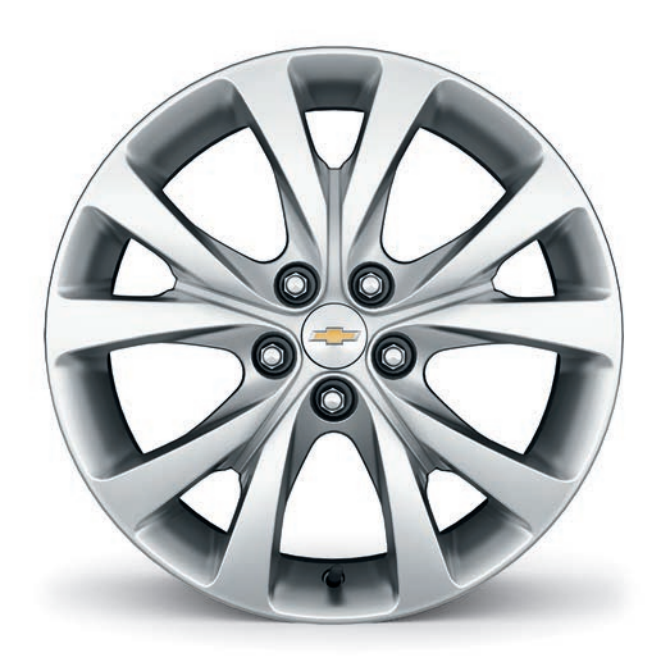
17" Silver-Painted Aluminum Wheel available from Chevrolet Accessories.