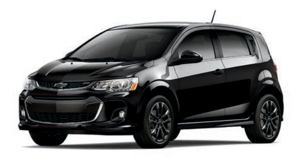
MOSAIC BLACK METALLIC