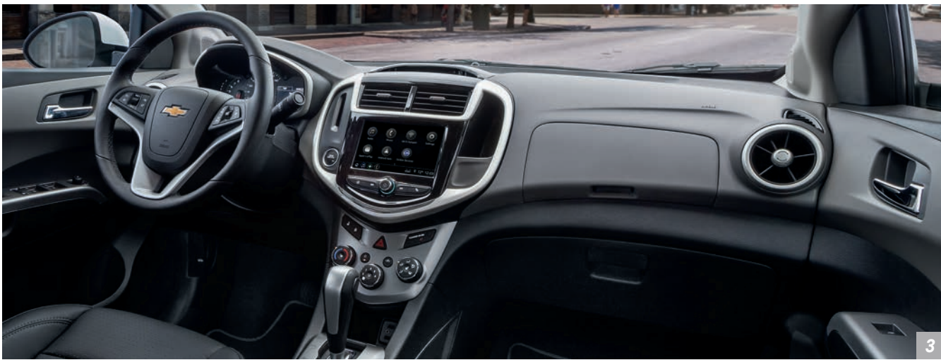
1 Cargo and load capacity limited by weight and distribution. 2 Chevrolet Infotainment System functionality varies by model. Full functionality requires compatible Bluetooth and smartphone, and USB connectivity for some devices. 3 Sedan only.