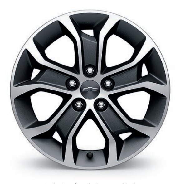
16" Aluminum (Standard on LT Hatchback. Available on LT Sedan; requires available RS Package)