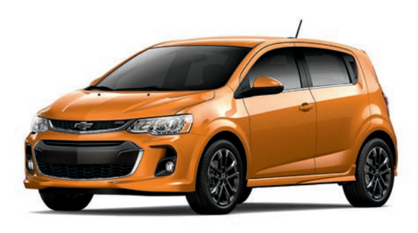
ORANGE BURST METALLIC<sup>1,3</sup>