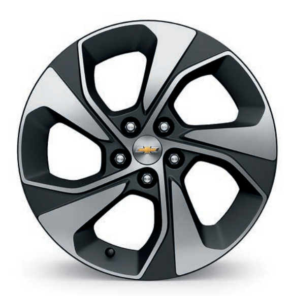
17" Painted-Aluminum (Available on Premier Sedan with automatic transmission)