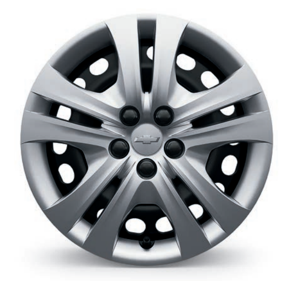
15" Steel with Bolt-On Wheel Cover (Standard on LS)