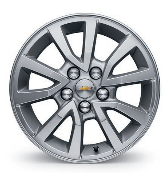
15" Aluminum (Standard on LT Sedan)