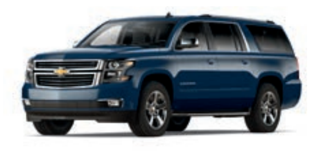
BLUE VELVET METALLIC