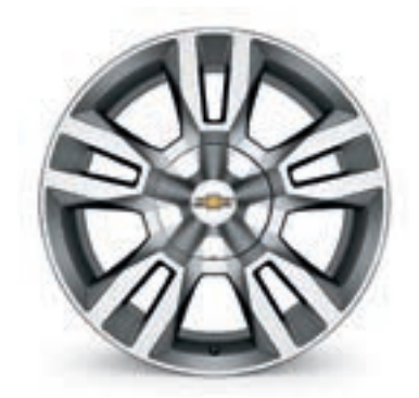
22" Bright Machined-Aluminum with Bright Silver Finish (SIY) (Available on Premier)