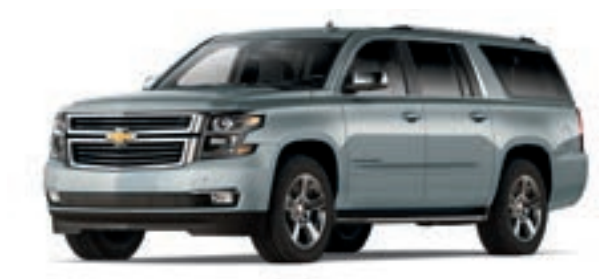
SATIN STEEL METALLIC