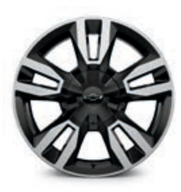
22" Gloss Black-Painted Aluminum with Custom Silver Accents (SGK) (Included with RST Edition)