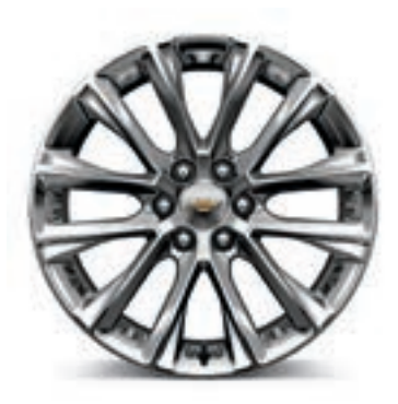
22" 12-Spoke Aluminum with Polished Finish (SHO) (Included with Premier Plus Edition)