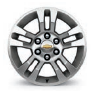
18" Aluminum with High-Polished Finish (PZX) (Standard on LS and LT)