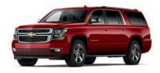
SIREN RED TINTCOAT<sup>1</sup>