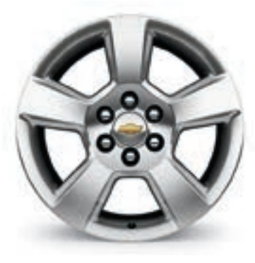
20" Polished-Aluminum (RD4) (Standard on Premier; available on LS and LT)