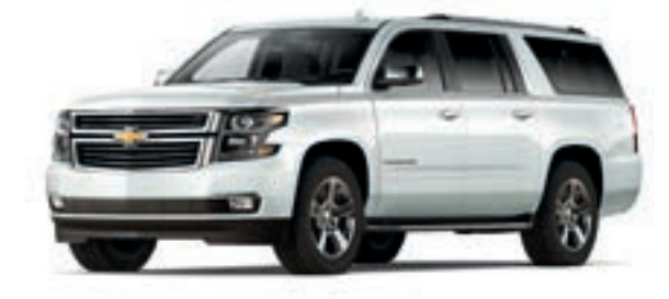
IRIDESCENT PEARL TRICOAT<sup>1,2</sup>