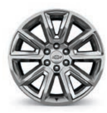
22" Premium Painted-Aluminum with Chrome Inserts (SGF) (Available on LT and Premier)