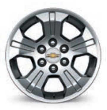
18" Painted-Aluminum (RCV) (Included with Z71 Off-Road Package)