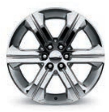
22" Chrome-Aluminum (SMI) (Available on LT and Premier)