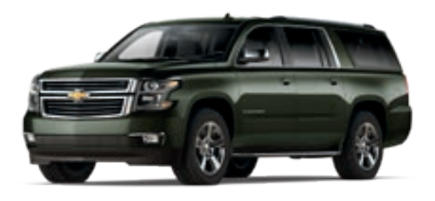
DEEPWOOD GREEN METALLIC<sup>1,3</sup>