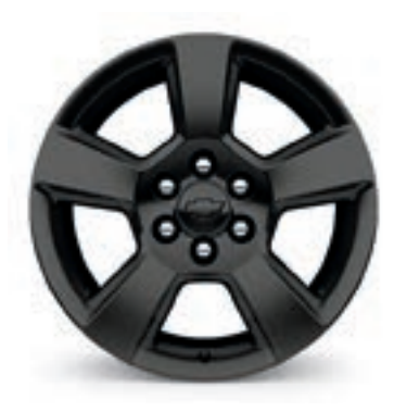
20" Black-Painted Aluminum (NZQ) (Included with LT Midnight Edition)