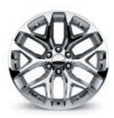
22" Chrome-Aluminum Multi-Featured Design (RPT) (Available on LT and Premier)