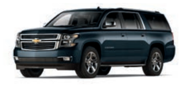
SHADOW GRAY METALLIC