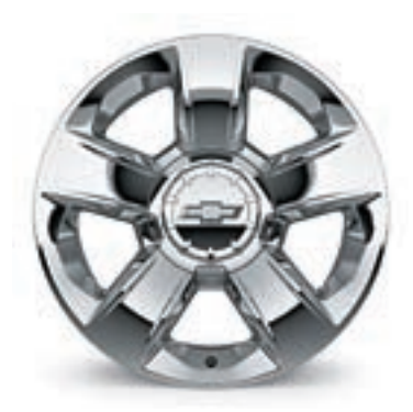
20" Chrome-Aluminum (RD2) (Available on Premier; included with LT Signature Package)