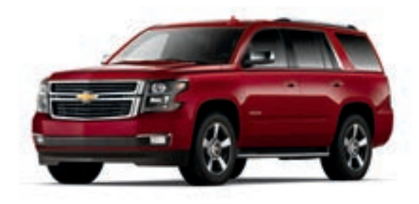
SIREN RED TINTCOAT<sup>1</sup>