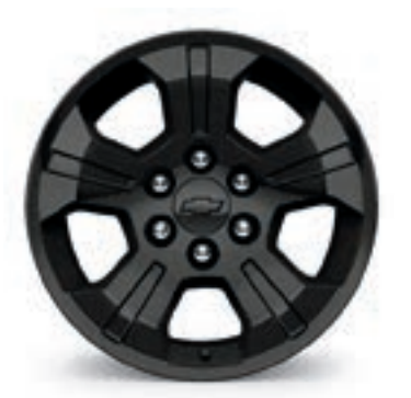
18" Black-Painted Aluminum (REG) (Included with Z71 Midnight Edition and Custom Midnight Edition)