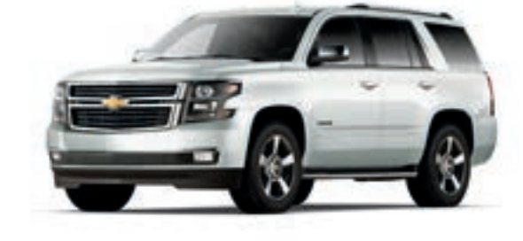
IRIDESCENT PEARL TRICOAT<sup>1,2</sup>