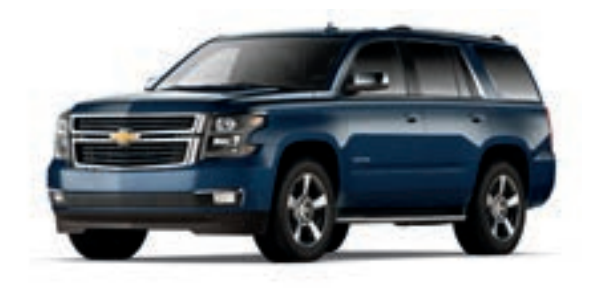
BLUE VELVET METALLIC