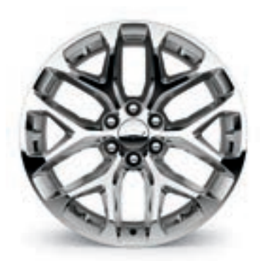
22" Chrome-Aluminum Multi-Featured Design (RPT) (Available on LT and Premier)