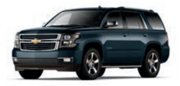
SHADOW GRAY METALLIC