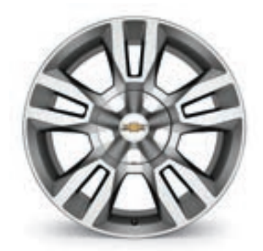
22" Bright Machined-Aluminum with Bright Silver Finish (SIY) (Available on Premier)