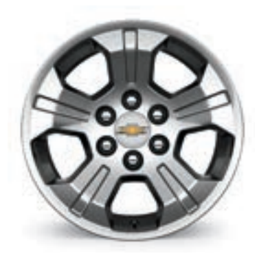
18" Painted-Aluminum (RCV) (Included with Custom Edition and Z71 Off-Road Package)