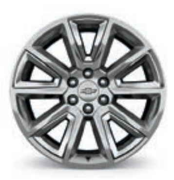
22" Premium Painted-Aluminum with Chrome Inserts (SGF) (Available on LT and Premier)