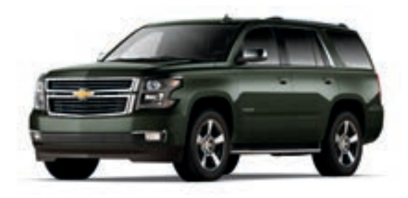
DEEPWOOD GREEN METALLIC<sup>1,3</sup>