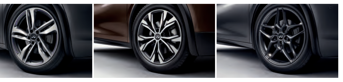
19 X 8.0-INCH MACHINE-FINISHED ALUMINUM 18 X 7.0-INCH MACHINE-FINISHED ALUMINUM 19 X 8.0-INCH GUN METALLIC DOUBLE 5-SPOKE ALLOY WHEELS WITH PURPLE ACCENTS** ALLOY WHEELS 19 X 8.0-INCH GUN METALLIC DOUBLE 5-SPOKE