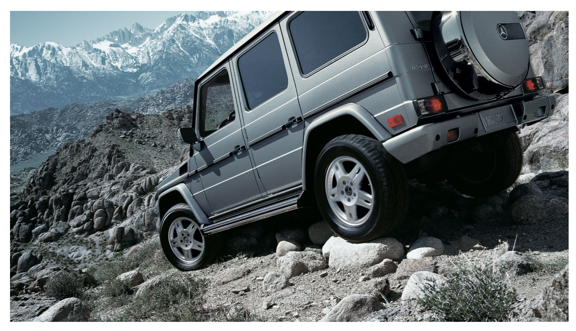
G 500 shown in Pewter metallic.