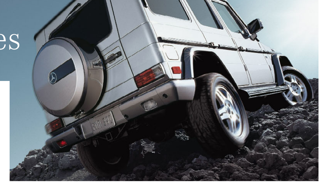
G 500 shown in Brilliant Silver metallic with dealer-installed accessory trailer hitch.

In an age when so many SUVs just seem to talk the talk, the Mercedes-Benz G-Class actually walks the walk—over almost any terrain. Permanent 4-wheel drive teams with our 4-wheel Electronic Traction System (4-ETS) to take you places ordinary SUVs only go in their dreams. With three mechanical differential locks and the ability to climb or descend an 80% incline, the G-Class gives you off-road options many SUVs can only imagine. Step above the fray and take the shortcut on the way home. Not to save time, but just because you can. In fact, "you can" is a concept you'll get used to behind the wheel of the G-Class.