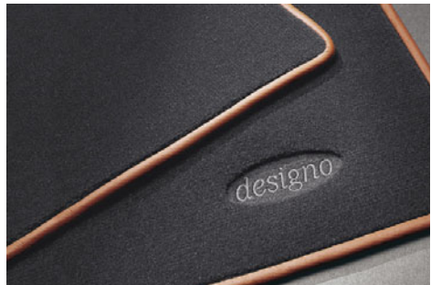
G 500 designo editions shown.