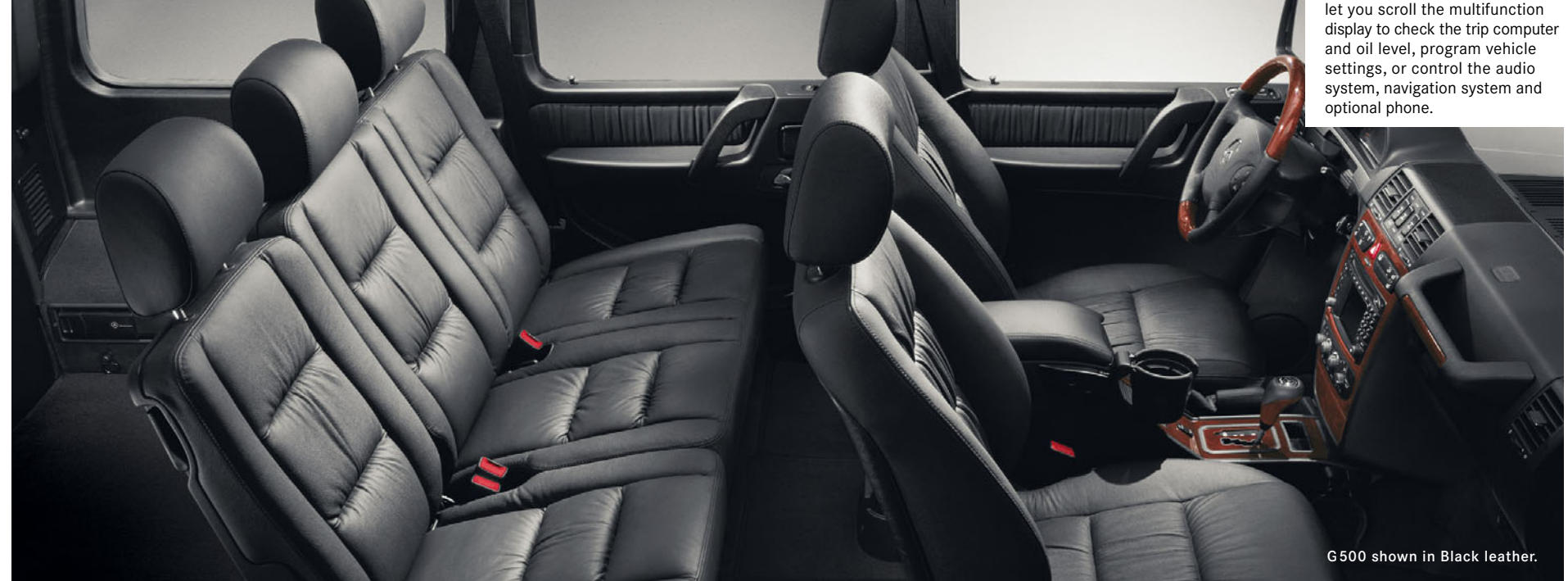
1 In-dash CD player/CD-ROM drive can play an audio CD when navigation system is not in use. 2 While the navigation system provides directional assistance, the driver must remain focused on safe driving behavior, including paying attention to traffic and street signs. The driver should utilize the system's audio cues while driving and should only consult the map or verbal displays once the vehicle has been stopped in a safe place. CD-ROM maps do not cover all areas nor all routes within an area.

The G500 puts luxury right at your fingertips. The 10-way power front seats adjust to your ideal position with intuitive controls. including 3-position memory buttons to capture the front-seat settings, as well as the driver's preferred steering-column and outside-mirror positions. And controls on the heated wood and leather trimmed steering wheel let you scroll the multifunction