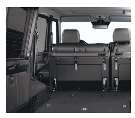
Here's one standard feature that actually gives you options. The second-row seats fold forward in a 60/40 split, so you can accommodate up to five passengers, or nearly 80 cu ft of cargo, or a variety of combinations in between.