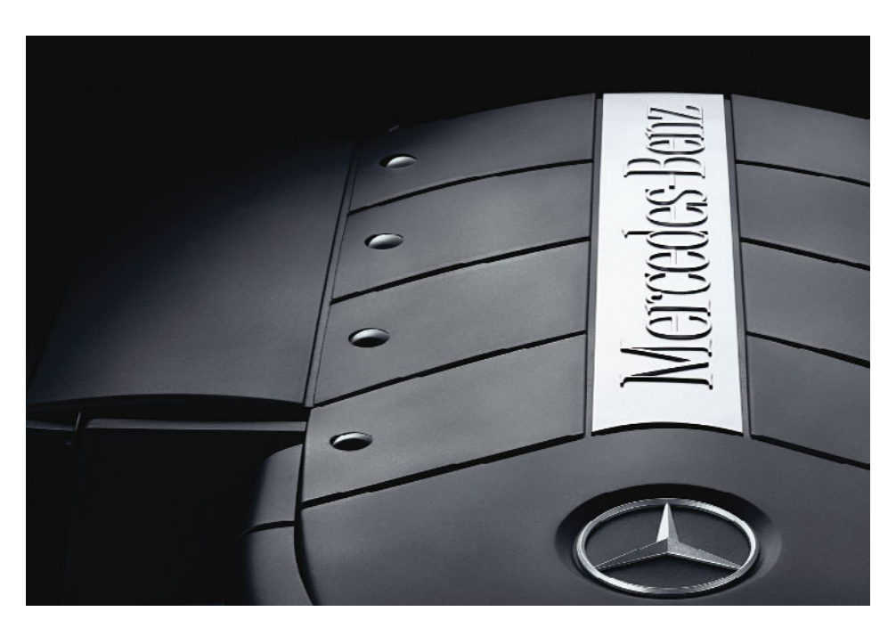
The G500's 4,966-cc V-8 produces a robust 292 horsepower and a monstrous 336 lb-ft of peak torque that starts at just 2,800 rpm and keeps on giving maximum thrust up to 4,000 rpm. With such a nice wide torque band, it's always ready to pounce.