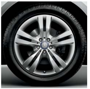
Standard 19" twin 5-spoke (ML 350 models)