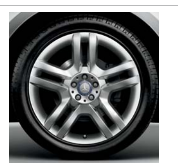
Optional 20" twin 5-spoke<sup>4</sup> (Dynamic Handling Package, ML 350 models)