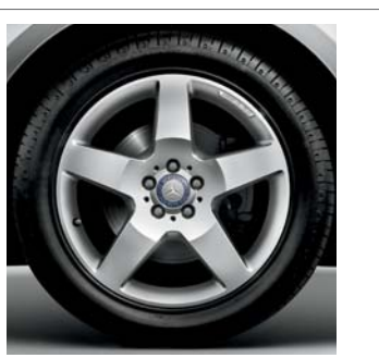
Standard 19" AMG 5-spoke (ML550 4MATIC)