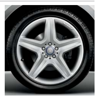
Optional 20" AMG 5-spoke (Dynamic Handling Package, ML 550 4MATIC)