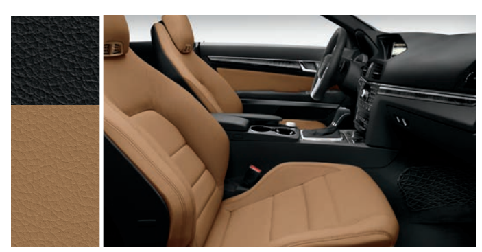
Natural Beige/Black (with Black Ash wood)