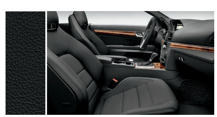
Black (with Burl Walnut wood)