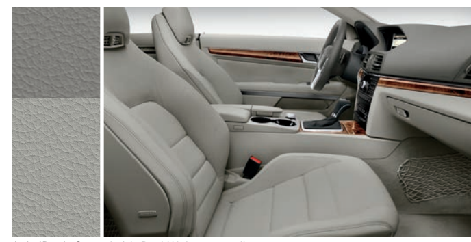
Ash/Dark Grey (with Burl Walnut wood)