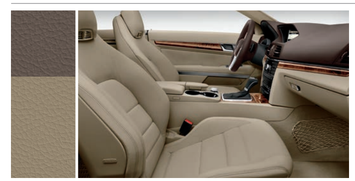
Almond Beige/Mocha Brown (with Burl Walnut wood)