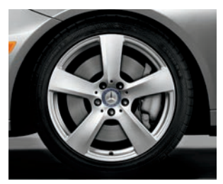
18" 5-spoke (E 350)