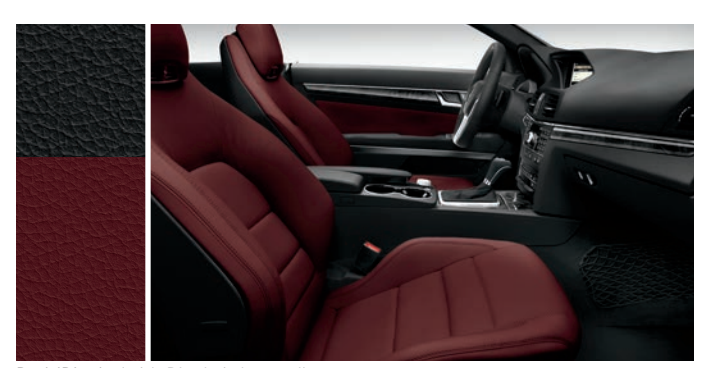
Red/Black (with Black Ash wood)