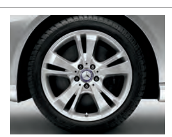
18" split 5-spoke<sup>1</sup> (E350 Sport Sedan)