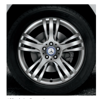
19" triple 5-spoke