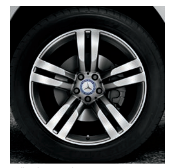
20" twin 5-spoke (Appearance Package)