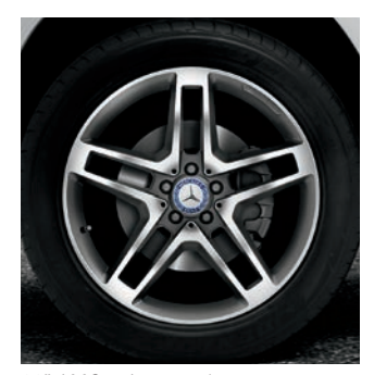
20" AMG twin 5-spoke (AMG Styling Package)