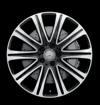
WHEEL: 19" 10-spoke Δ SL450