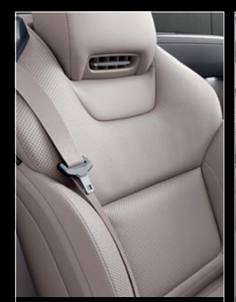
UPHOLSTERY: Leather SL450, SL550