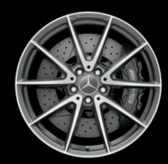
WHEEL: 19" AMG 10-spoke AMG SL 63