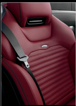
UPHOLSTERY: designo Exclusive Nappa leather SL450, SL550