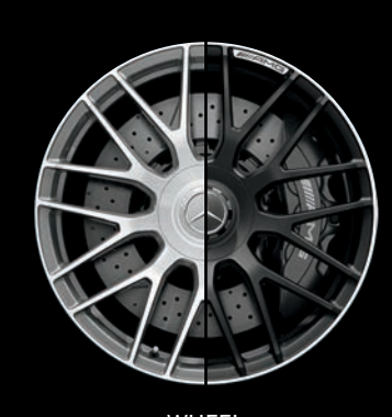
WHEEL: 19"/20" f/r AMG forged cross-spoke Silver Black O AMG SL63 O AMG SL63 Δ AMG SL 65 O AMG SL65