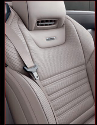
UPHOLSTERY: AMG Nappa leather AMG designo Exclusive Nappa leather AMG SL 63