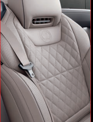
UPHOLSTERY: AMG Exclusive Nappa leather AMG designo Exclusive Nappa leather AMG SL65