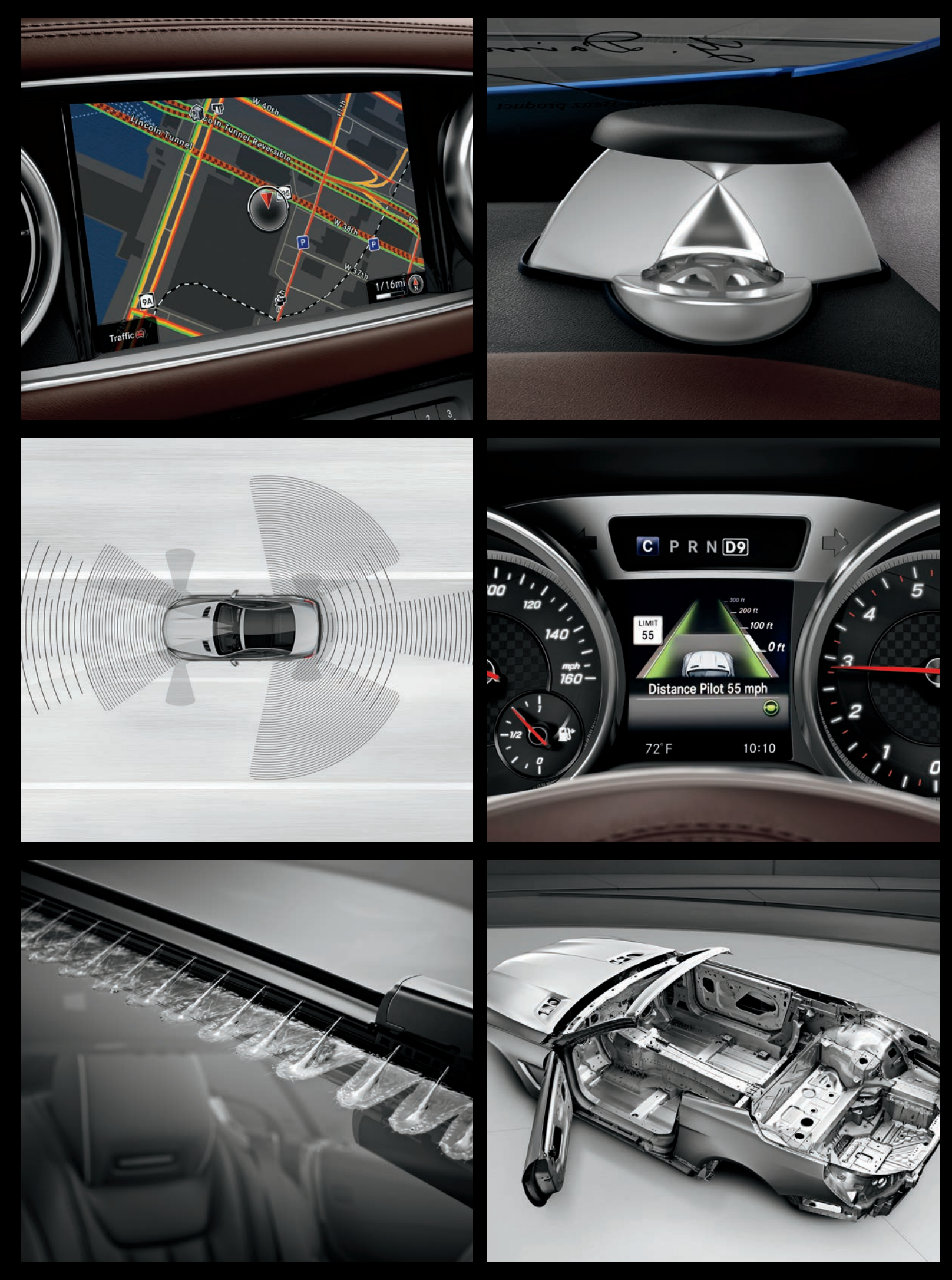
*Optional or not available on some models. Please see back of brochure.