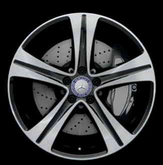
WHEEL: 19" 5-spoke • SL450