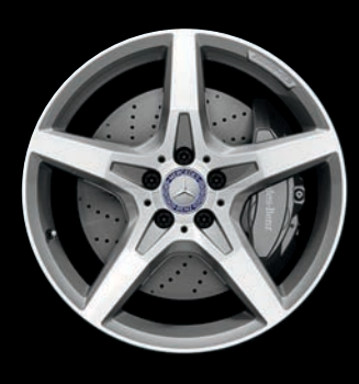
WHEEL: 19" AMG<sup>®</sup> 5-spoke ● SL550