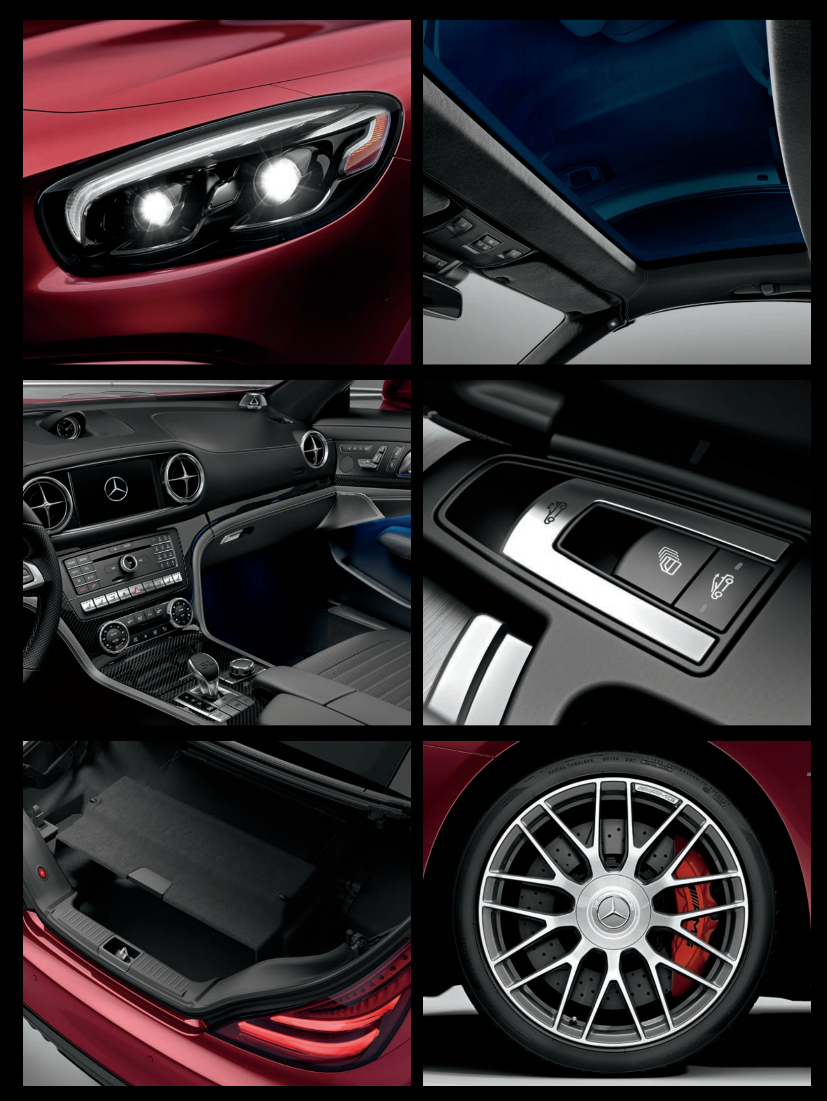
*Optional or not available on some models. Please see back of brochure.