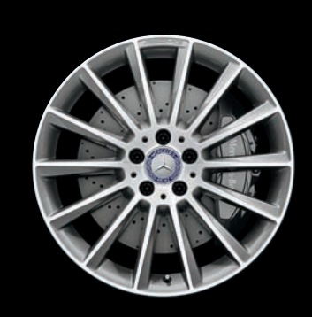
WHEEL: 19" AMG multispoke O SL450 Δ SL550