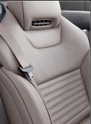
UPHOLSTERY: Nappa leather SL450, SL550