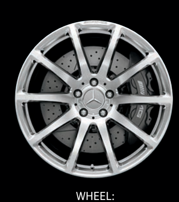
19"/20" f/r AMG forged 10-spoke, high-polished AMG SL 65