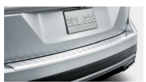
Rear Bumper Protection Plate - Chrome