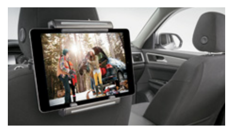
Universal Tablet Holder**