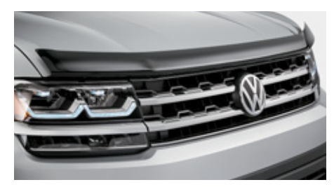
Hood Deflector - Tinted