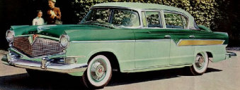
New 1956 Hudson Hornet Custom Four-Door Sedan