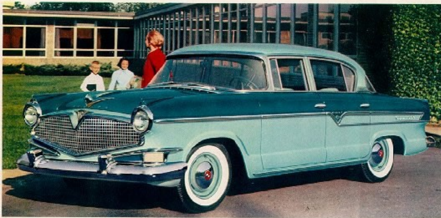
New Hudson Hornet Special V-8 Four-Door Sedan