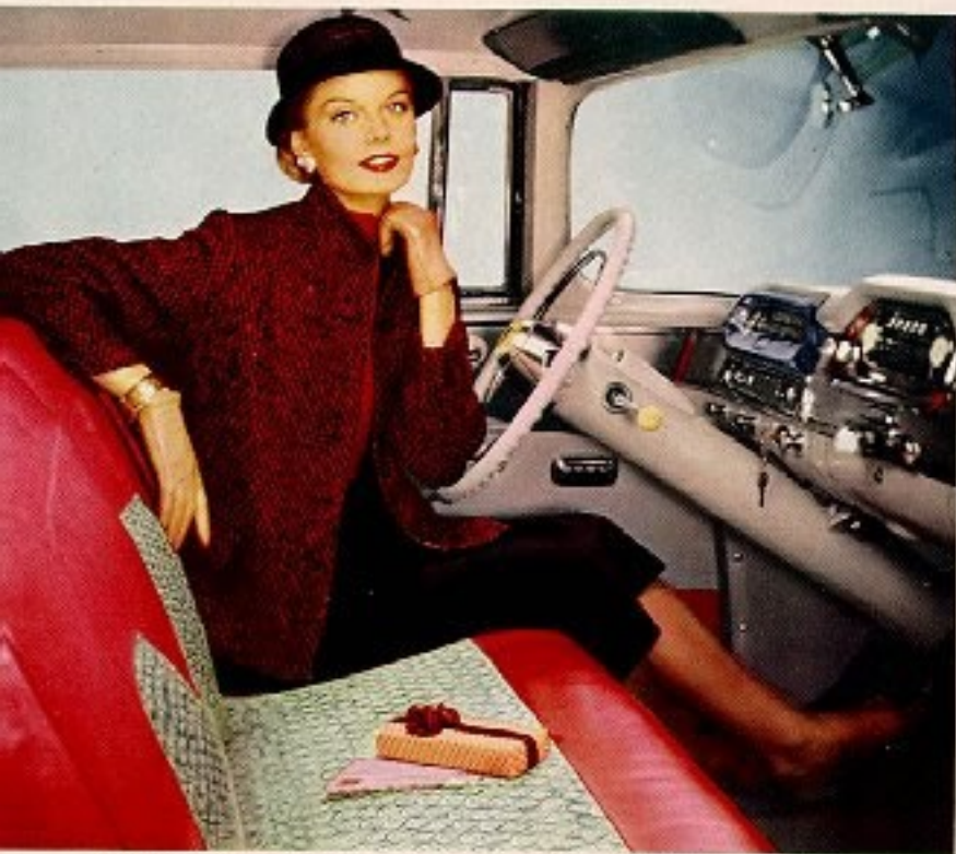
Interior of the new 1956 Hudson Hornet Custom Hollywood Hardtop

Choose any of 14 body colors or 21 two- and three-tone combinations