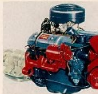
Hornet V-8 Special Engine features rugged design; combines flashing performance, sensational mileage on less-expensive regular with automatic transmission.

Sleek with V-Line styling—offering a wide variety of matching interior and exterior colors—the Hornet Special V-8 is a beautiful, compact, easy-to-handle performer... priced to let everyone enjoy big-car luxury!