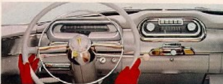
New Hudson instrument panel, with new two-spoke wheel, and all instruments grouped for quick, easy reading. New thermometer-type speedometer.