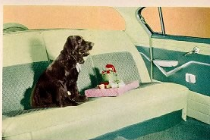
With all their beauty, Hudson interiors are durable, hard-woven, hard-finish fabrics that wear and wear!

Hudson's new interiors feature modern metallic-weave upholsteries in a variety of colors, and combined with genuine leather or vinyl bolsters in either contrasting or harmonizing colors. Even the floor coverings feature new, colorful pile carpeting.