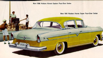
New 1956 Hudson Hornet Super Four-Door Sedan