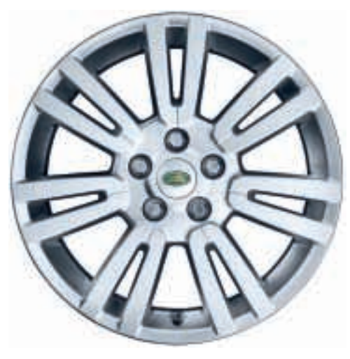
HSE 19 INCH 7-SPLIT SPOKE ALLOY WHEELS Tire Specification: 255/55 AT