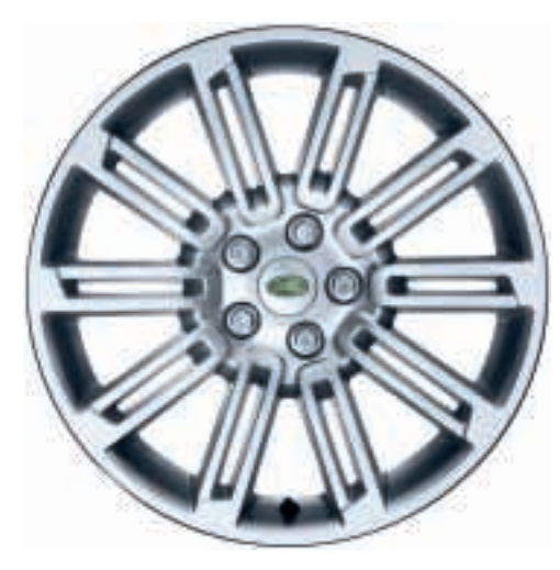
OPTIONAL 20 INCH 10-SPLIT SPOKE ALLOY WHEELS Tire Specification: 255/50 AT

Please note: When choosing vehicles fitted with specific wheel and tire combinations or optional wheels and tires, your intended use of the vehicle should be considered. Wheels with larger diameters and lower profile tires may offer certain styling or driving benefits, but may be more vulnerable to damage, please discuss your requirements with a Retailer when selecting your vehicle and specification.