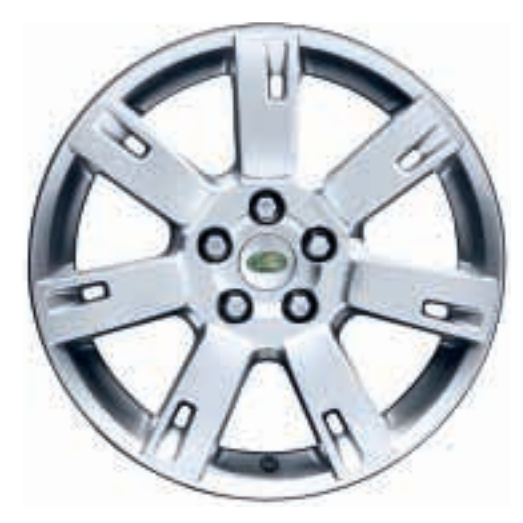
LR4 19 INCH 7-SPOKE ALLOY WHEELS Tire Specification: 255/55 AT