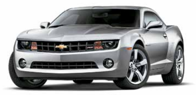
GAN – Silver Ice Metallic