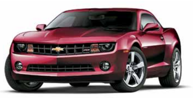
GAQ – Red Jewel Tintcoat*