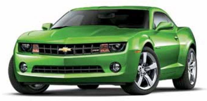
GHS - Synergy Green Metallic***