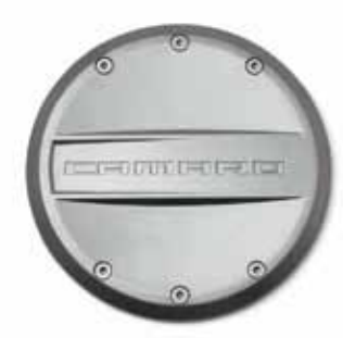
SATIN-NICKEL FUEL DOOR