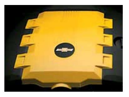
BODY-COLOURED ENGINE COVER