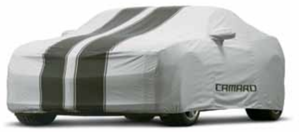
CUSTOM CAMARO CAR COVER