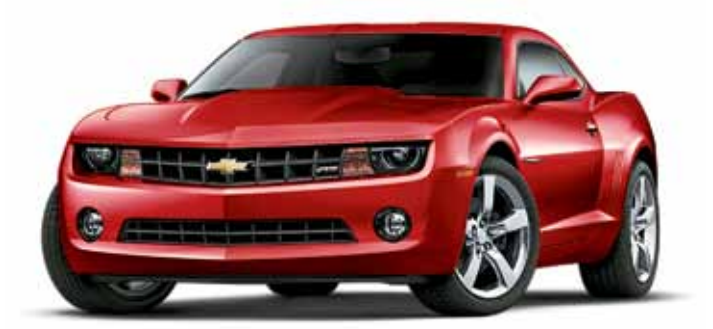
GCN – Victory Red