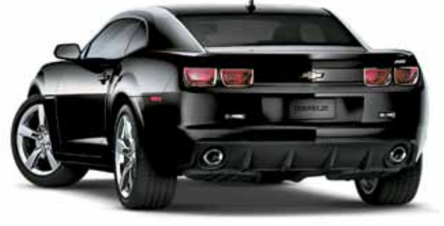
GBA – Black