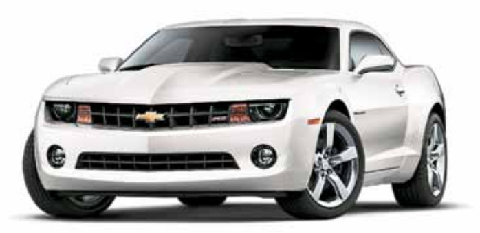
GAZ - Summit White