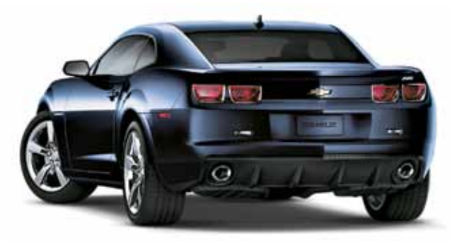
GAP – Imperial Blue Metallic