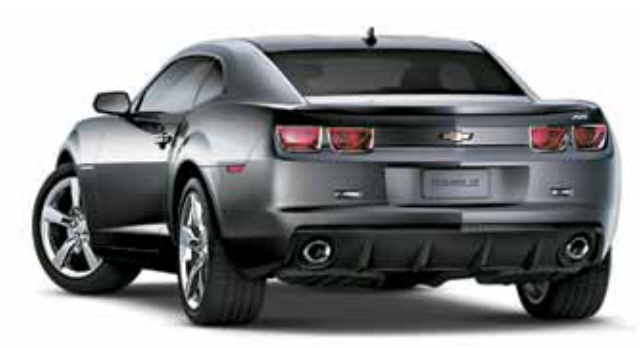
GBV – Cyber Gray Metallic