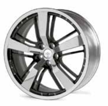
21-IN. MACHINED-ALUMINUM WHEEL WITH BLACK ACCENTS