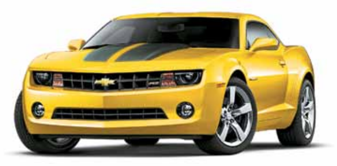
STRIPES – Dual Hood and Trunk