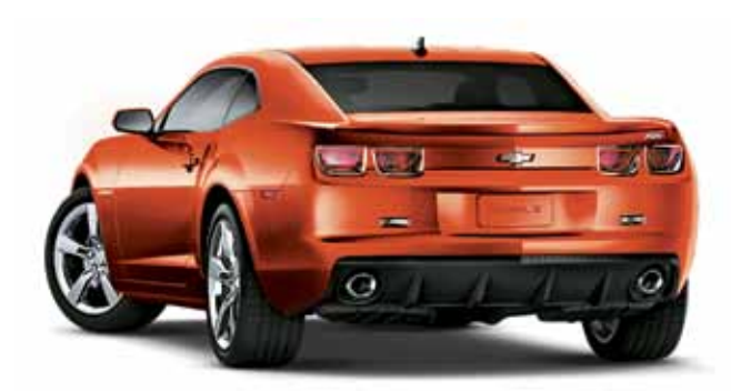
GCR - Inferno Orange Metallic*