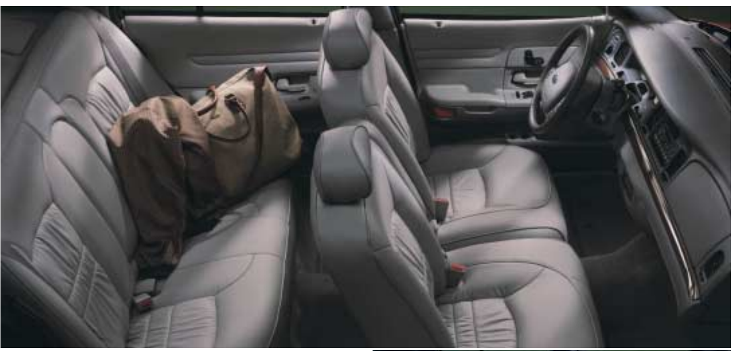
Crown Victoria LX shown in optional Light Graphite leather trim and with optional equipment.

Crown Victoria is spacious. Controls are conveniently positioned. At the right is the expansive 6-passenger interior. And below is something quite new. Introducing the LX Sport with 5-passenger seating. Sporty? Yes. Luxurious? Yes. And above is the fold-down rear armrest with built-in beverage holders. Thoughtful? Naturally.