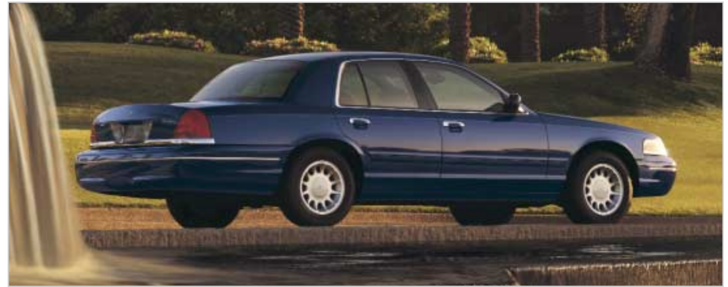
Crown Victoria LX shown in Deep Wedgewood Blue.

Set the position of the power adjustable pedals to your driving preference (a). Grasp the new "controls inclusive" steering wheel (b). These features are standard luxuries on both LX models. Now press the accelerator and feel what confident power can do for your well being. Some will call it luxury. We simply believe it's the way it should be.