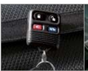
Comfort is knowing that when you need to, you can get into Crown Victoria quickly with its remote keyless entry. Standard on both LX models.

Crown Victoria LX and LX Sport have a standard Anti-Lock Braking System (ABS) that allows you to aggressively apply the brakes in order to avoid an accident while still retaining steering control.