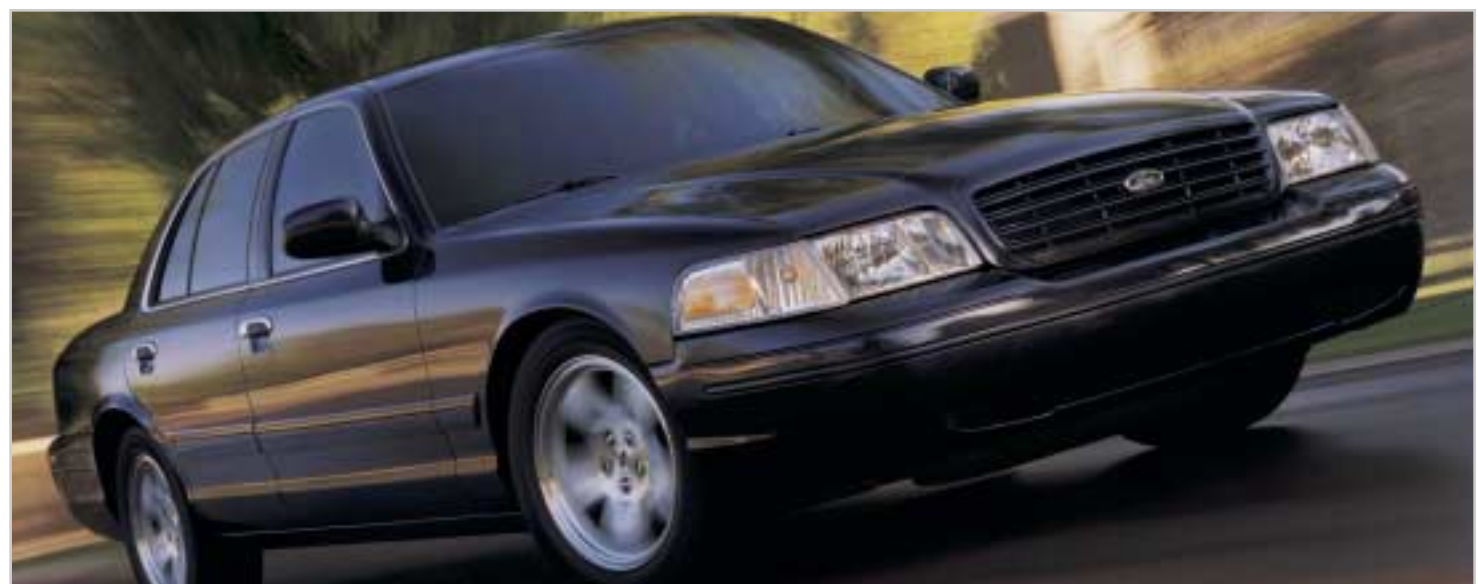
IT'S JOY. PURE. HONEST. JOY.

So very often, people will gravitate toward the "latest" cars that possess a lot of one thing (speed, for instance) at the expense of another (an honest back seat, for instance). Crown Victoria manages to be a truly fulfilling balanced mix of everything a thoroughly modern automobile should be. Underway, it is remarkably smooth. Conversations often revolve around how quiet it is. Crown Victoria is more than generous to its passengers, to be sure. But, in particular, the driver is treated to the kind of handling and response normally reserved for the far more expensive of its class.