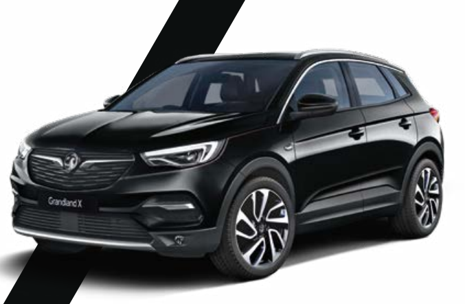
Diamond Black -Two-coat Metallic*