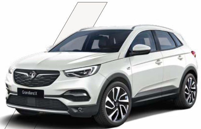
Pearl White - Tri-coat Premium

The vehicles shown are for colour illustrative purposes only and do not represent a specific model. *Please refer to the latest Grandland X Price and Specification Guide available from vauxhall.co.uk/gograndlandx for details of colour availability by model and price. Due to the limitations of the printing process, the colours reproduced may vary slightly from the actual paint colour and trim material. As a result, they should be used as a guide only. Your Vauxhall Retailer has a comprehensive display of paint finishes.