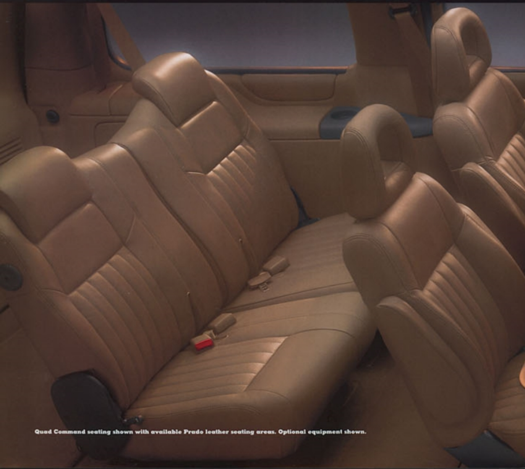
Quad Command seating shown with available Prado leather seating areas. Optional equipment shown.

theater seating: The second-row seats are higher than the front seats, and the third-row seats are higher than the second. Experts attest that this arrangement helps reduce motion sickness because of the improved outward visibility. With the exception of the standard seating on regular-length Trans Sports, all rear seats also recline, have fore/aft adjustability and are easily removable by one person. Regardless of which interior you select, their flexibility will work to meet your changing day-to-day needs.