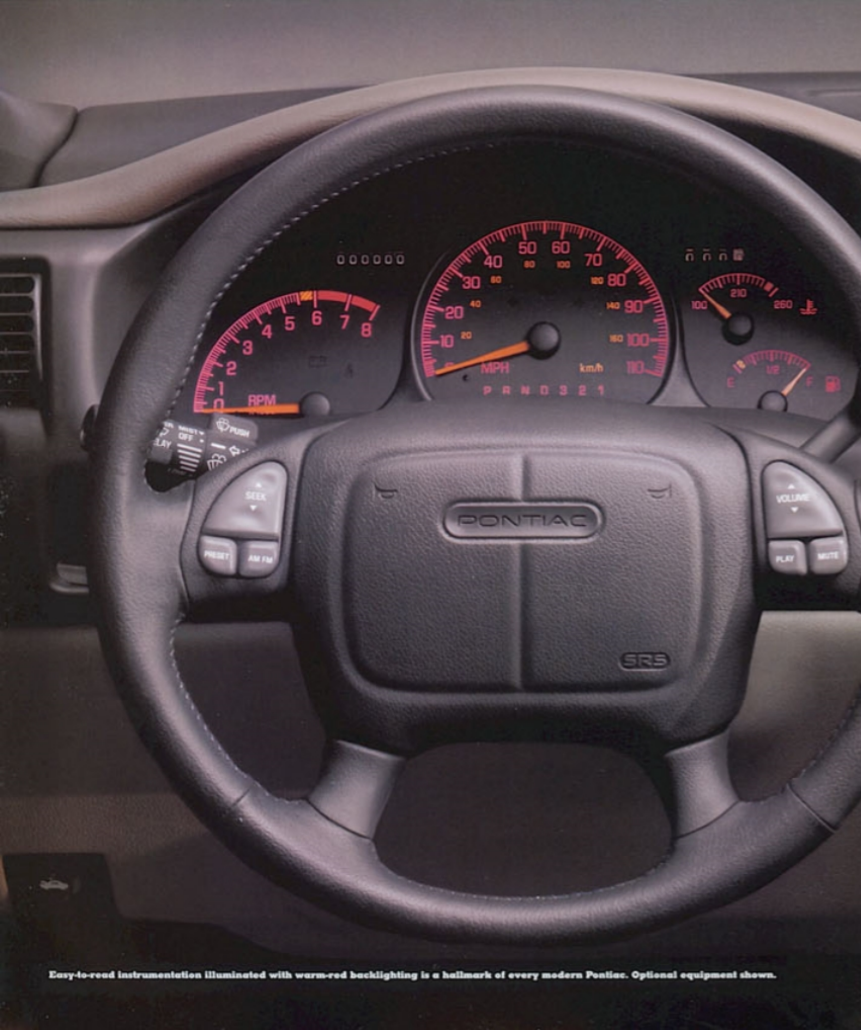
Easy-to-read instrumentation illuminated with warm-red backlighting is a hallmark of every modern Pontiac. Optional equipment shown.