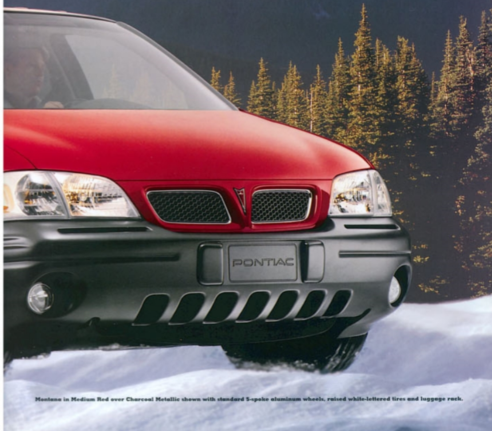
Montana in Medium Red over Charcoal Metallic shown with standard 5-spoke aluminum wheels, raised white-lettered tires and luggage rack.

R uggedly sporty, Trans Sport Montana combines the aggressiveness of a sport utility vehicle with the practicality of a minivan and the excitement of a Pontiac. The Montana Package includes all that is standard on Trans Sport models but packages it with a unique exterior color theme highlighted with Charcoal Metallic lower accents. Additional features include self-sealing tires with enhanced rain and snow capabilities, all-weather traction control, automatic load leveling and the auxiliary air inflator.