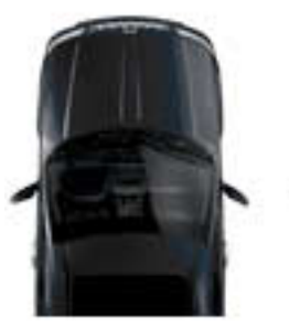
Brilliant Black Crystal Pearl 1,2,3,4,5,6

Grand Cherokee Overland, Limited, Freedom, Columbia Edition (not shown), Special Edition and Laredo all take on their very own persona, while the definitive grille serves as a reminder of their roots.